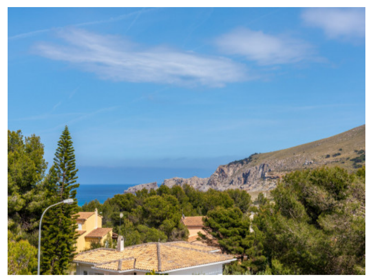
Beautiful sea views