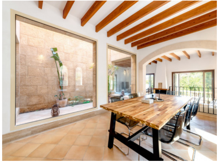
Dining area with glazed patio