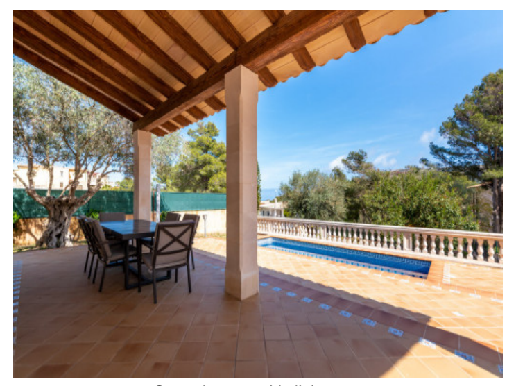
Covered terrace with dining area