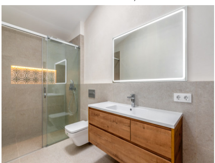
Bathroom with walk-in shower One of 3 bedrooms All information is correct to the best of our knowledge. Errors and prior sale excepted. This prospectus is purely for information purposes. Only the notarized deed of sale is legally binding.