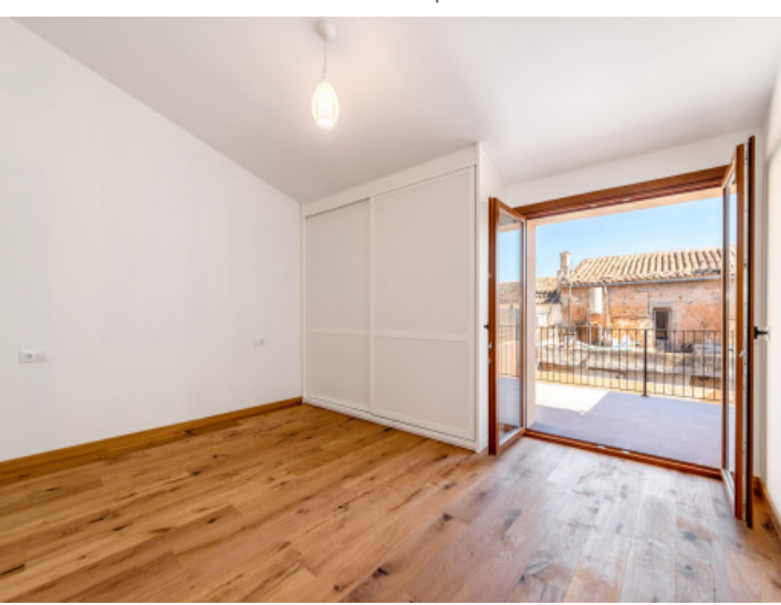
Main bedroom with balcony access