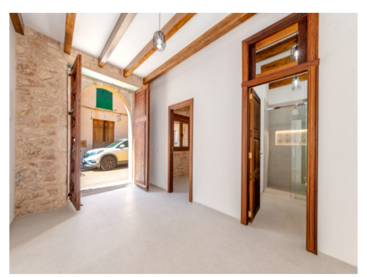
Entrance area and guest bathroom