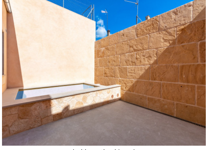
Inviting patio with pool