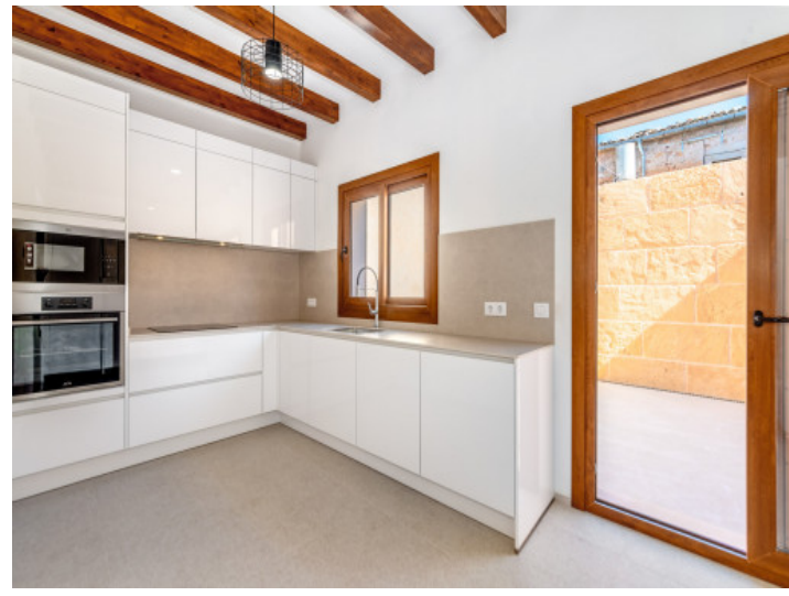
Access to the patio

PORTA MALLORQUINA<sup>®</sup> Your home. Our passion.