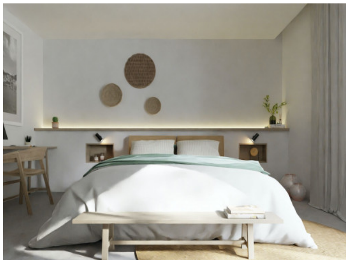
Spacious double bedroom