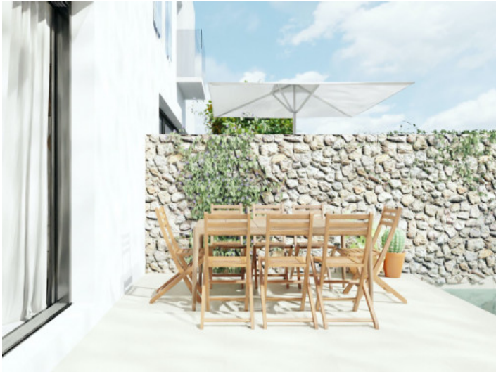
Beautiful pool terrace