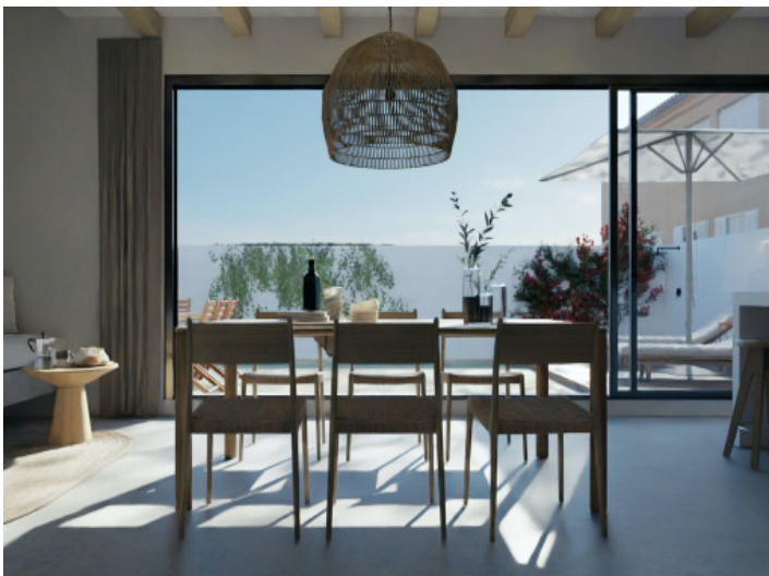
Luxurious dining area