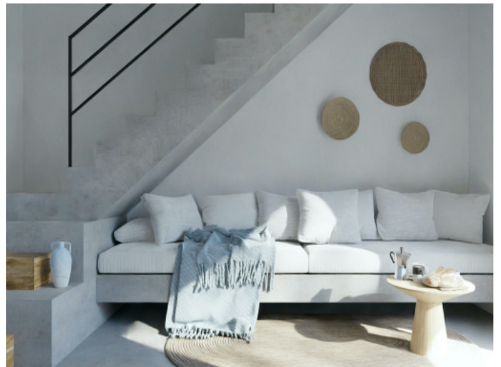
Light-flooded living area