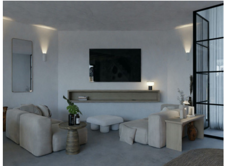
Large living area