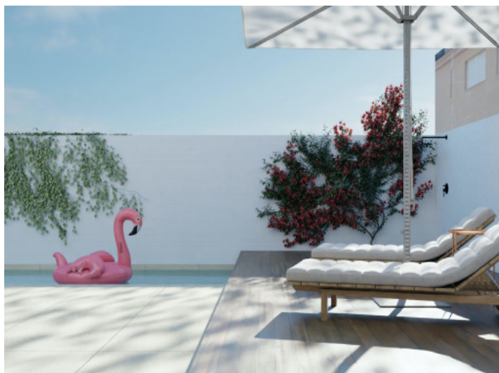
Fantastic outdoor area