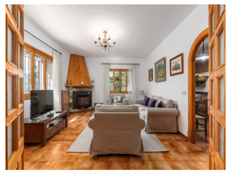
Cozy living area with fireplace