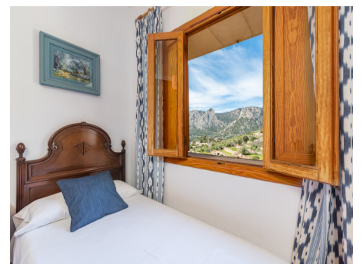
Bedroom with a view