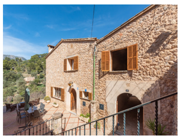
View to the terrace