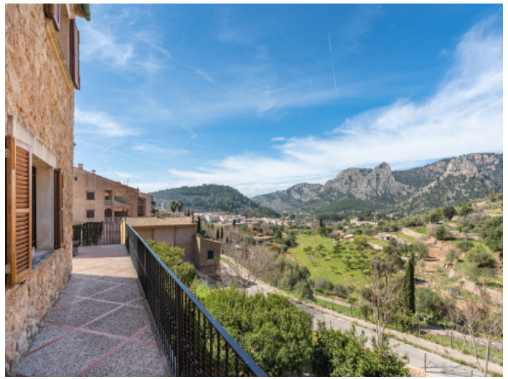
Side view of the town house