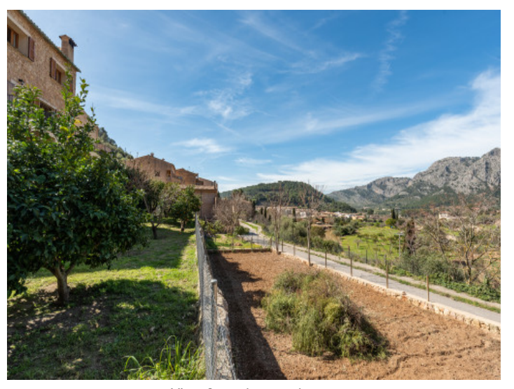
View from the townhouse

All information is correct to the best of our knowledge. Errors and prior sale excepted. This prospectus is purely for information purposes. Only the notarized deed of sale is legally binding.