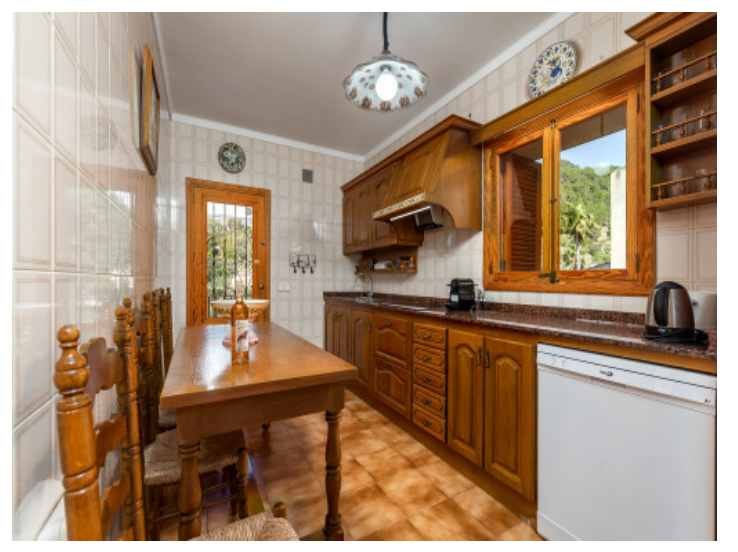
Rustic kitchen with dining area

All information is correct to the best of our knowledge. Errors and prior sale excepted. This prospectus is purely for information purposes. Only the notarized deed of sale is legally binding.