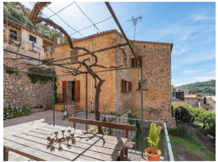
View to the terrace