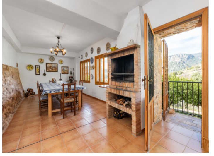
Separate exterior kitchen

All information is correct to the best of our knowledge. Errors and prior sale excepted. This prospectus is purely for information purposes. Only the notarized deed of sale is legally binding.