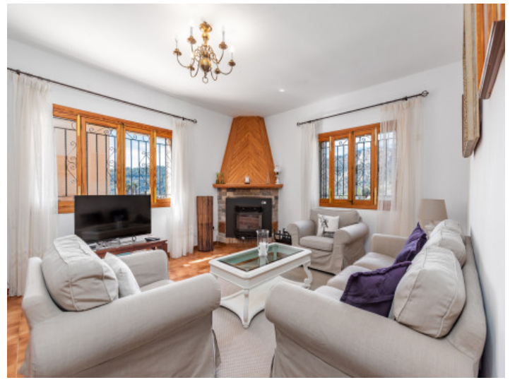
Cozy living area with fireplace