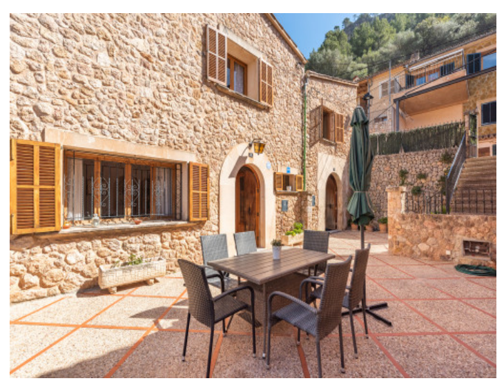
Sunny terrace and dining area