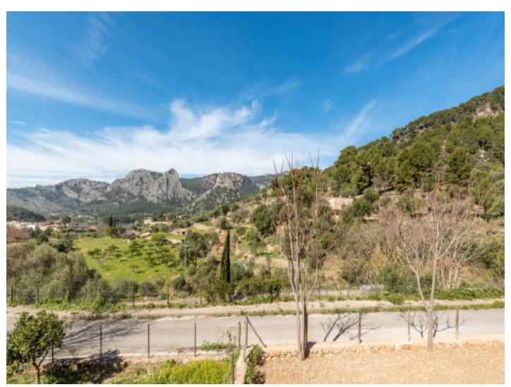
View from the townhouse