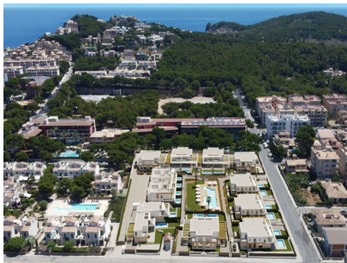
Surroundings of the residential complex

All information is correct to the best of our knowledge. Errors and prior sale excepted. This prospectus is purely for information purposes. Only the notarized deed of sale is legally binding.