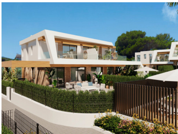
Semi-detached house with private pool in Cala Ratjada