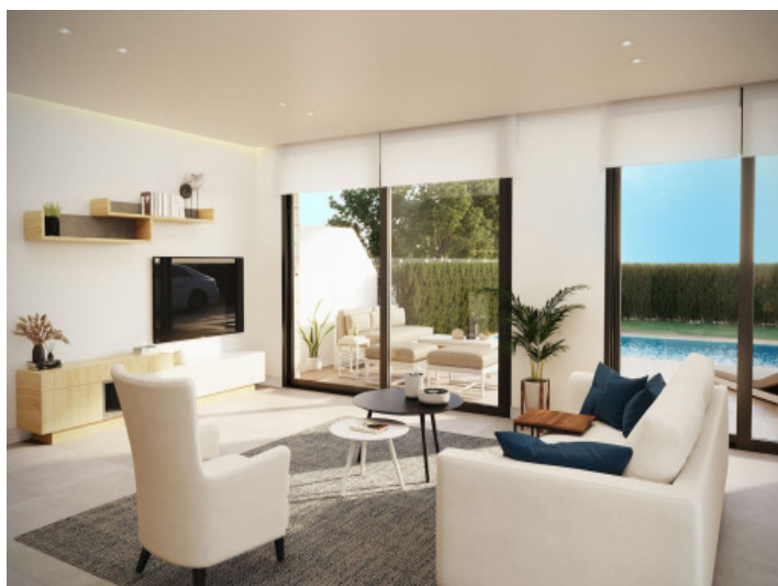
Light flooded living area