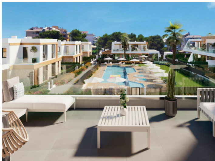
Balcony with chill-out area