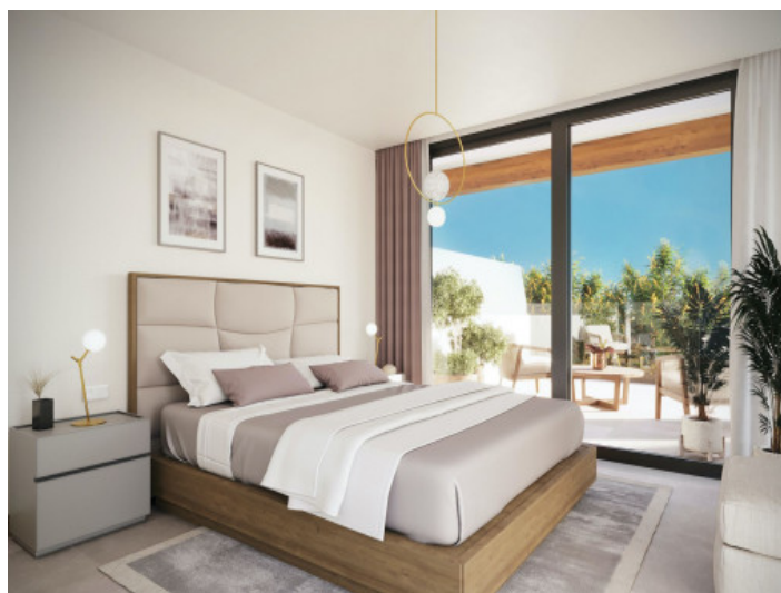
Spacious bedroom with terrace