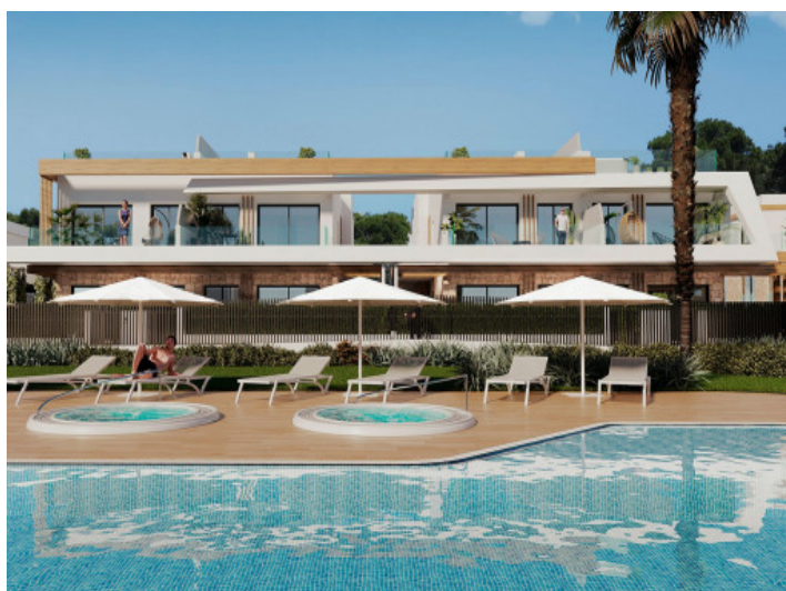
Community pool area with sun loungers