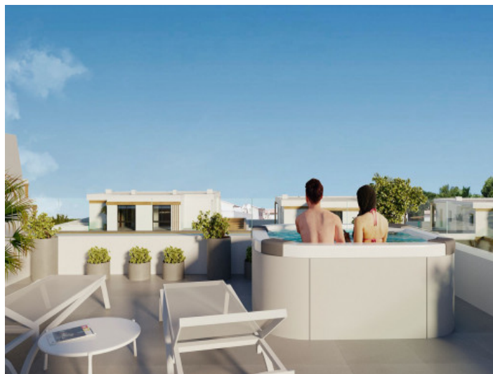
Roof terrace with jacuzzi