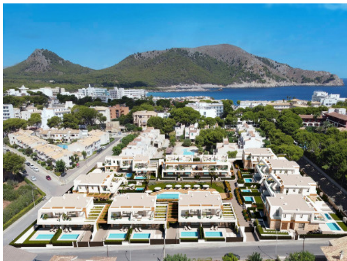
Surroundings of the residential complex