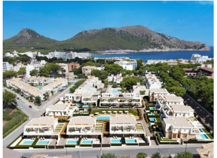
Surroundings of the residential complex