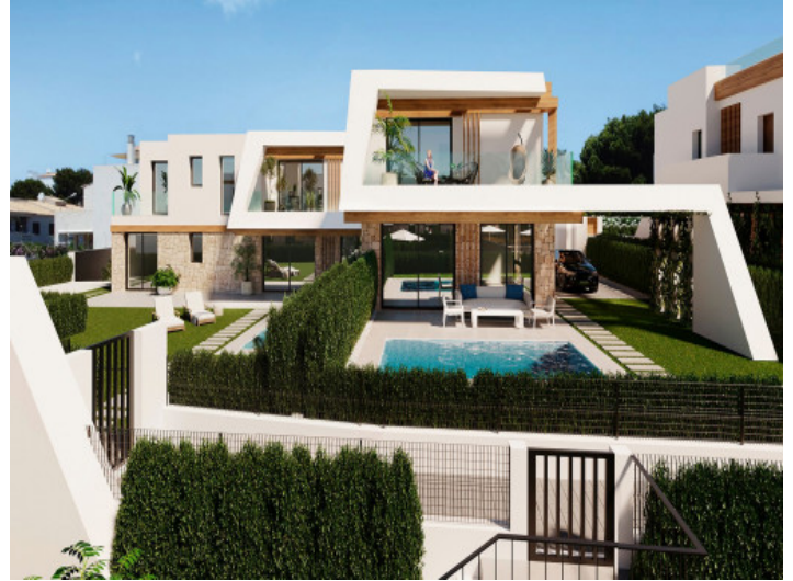
Villa with pool