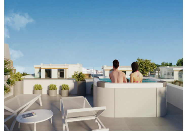
Roof terrace with jacuzzi