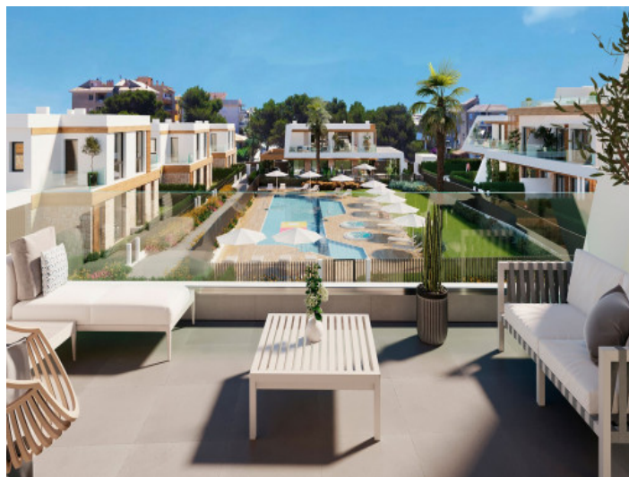
Roof terrace and communal pool