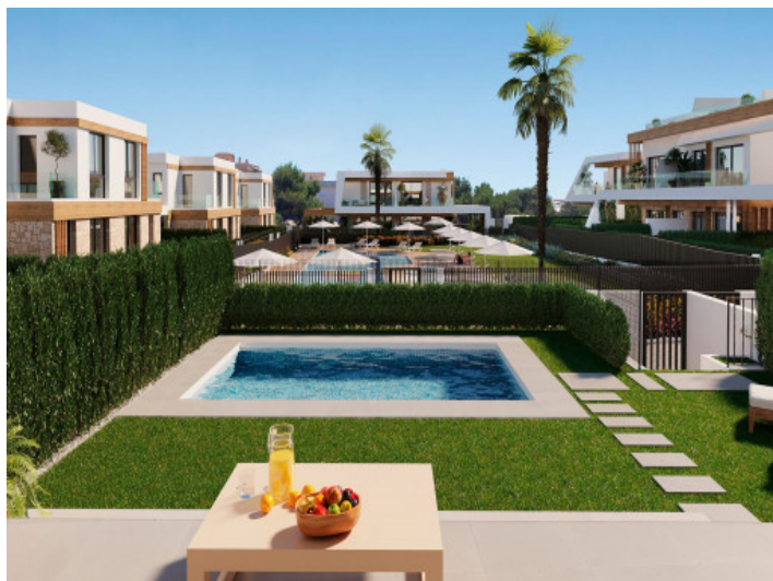
Newly-built semi-detached house in Cala Ratjada