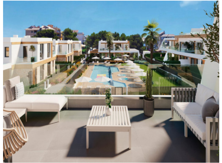
Roof terrace and communal pool