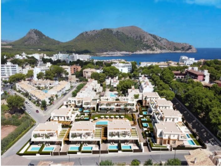
Complex close to the sea