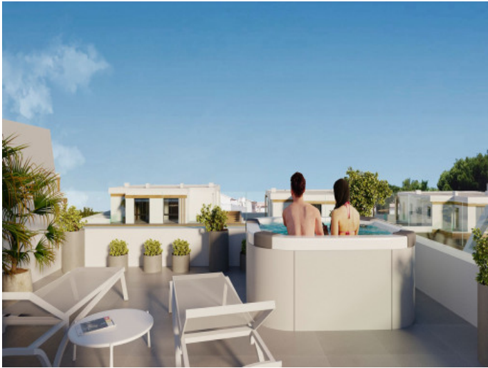
Roof terrace with jacuzzi