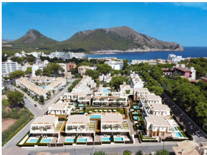
View of the complex