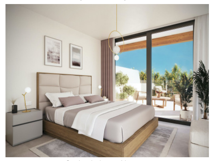
Spacious bedroom with terrace

All information is correct to the best of our knowledge. Errors and prior sale excepted. This prospectus is purely for information purposes. Only the notarized deed of sale is legally binding.