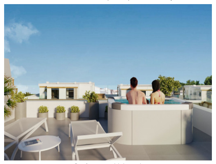
Roof terrace with jacuzzi