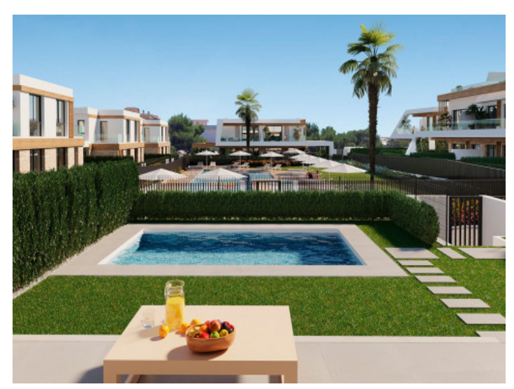
Semi-detached house with private pool in Cala Ratjada