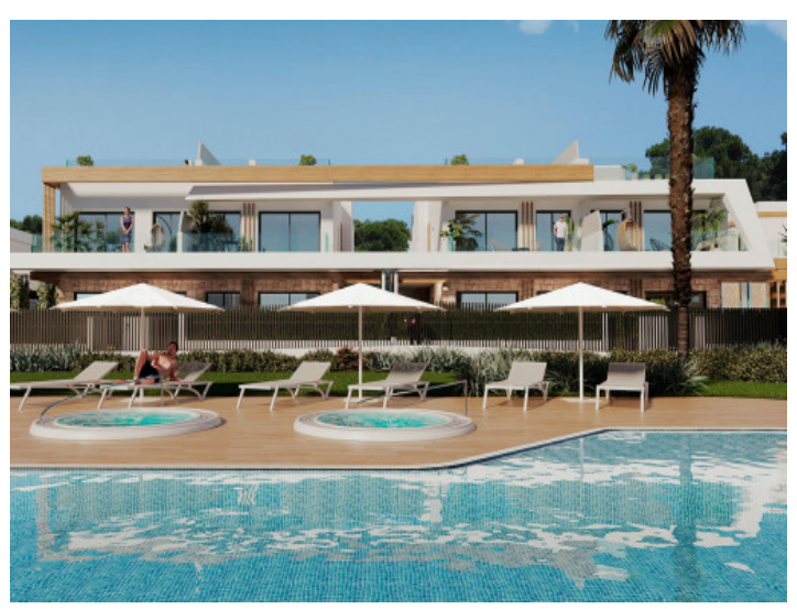
Community pool area with sun loungers