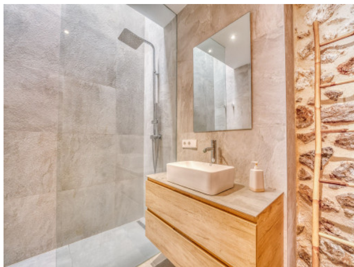
Modern bathroom with walk-in shower

All information is correct to the best of our knowledge. Errors and prior sale excepted. This prospectus is purely for information purposes. Only the notarized deed of sale is legally binding.