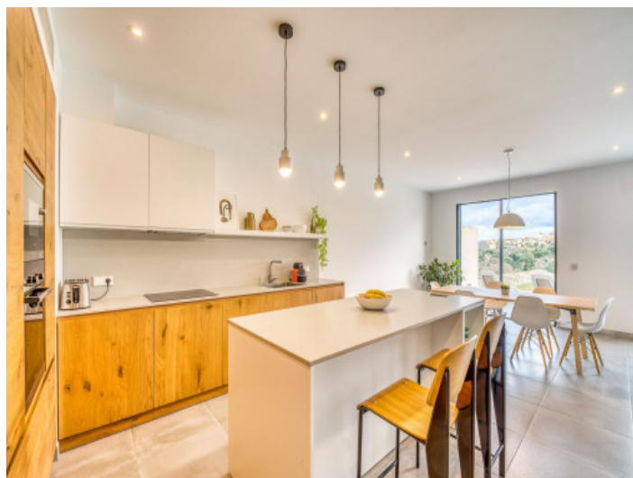
Kitchen with cooking island

All information is correct to the best of our knowledge. Errors and prior sale excepted. This prospectus is purely for information purposes. Only the notarized deed of sale is legally binding.