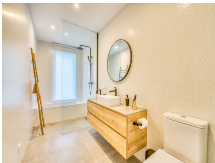
Bathroom en suite