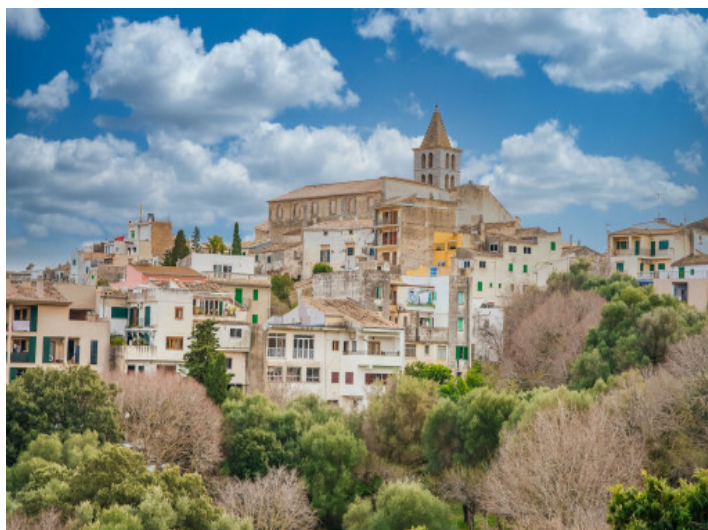
View of Campanet

All information is correct to the best of our knowledge. Errors and prior sale excepted. This prospectus is purely for information purposes. Only the notarized deed of sale is legally binding.