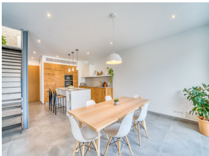
Dining area and kitchen