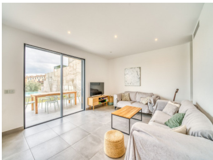
Cozy living area