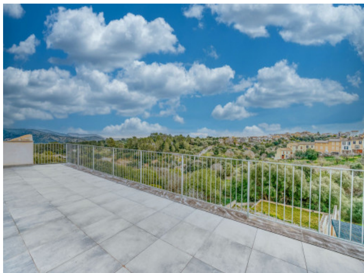
Balcony with a view