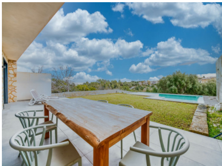
Terrace with a view