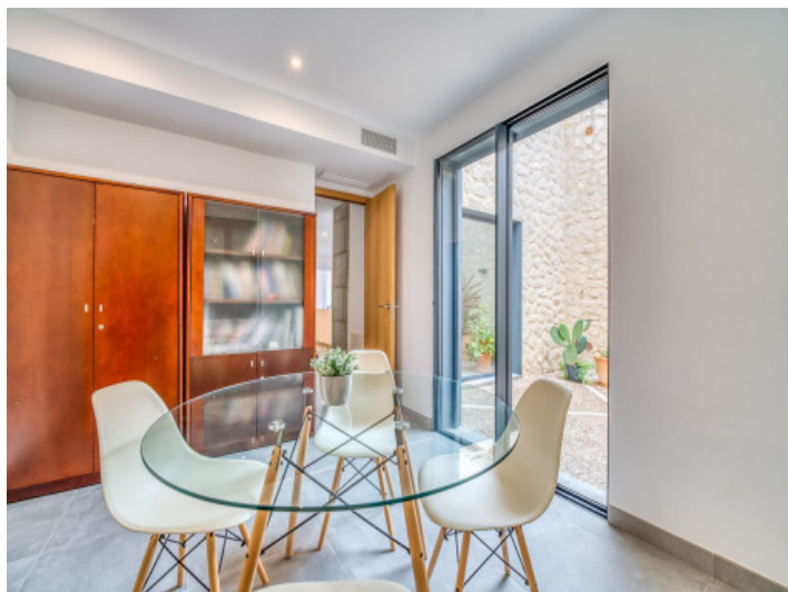
Separate dining area