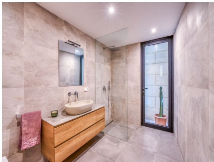
One of 3 bathrooms