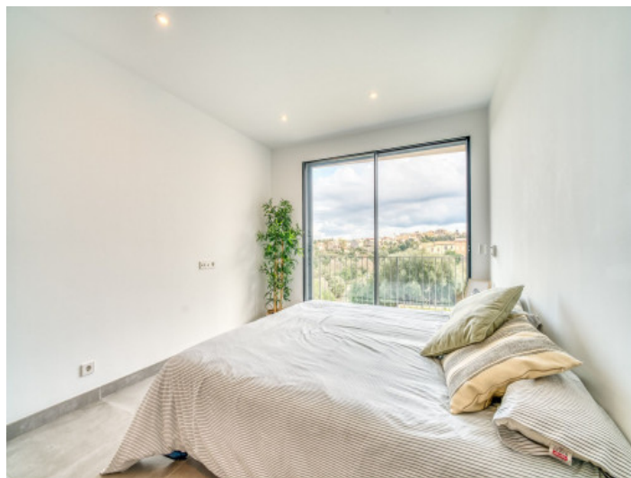
Master bedroom with bathroom en suite