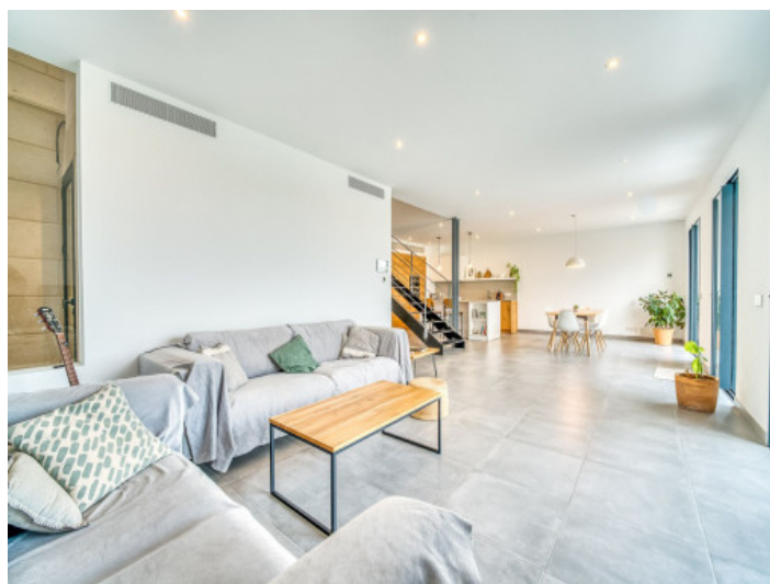
Open living area and kitchen