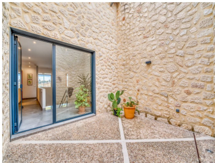
Patio with natural stone wall