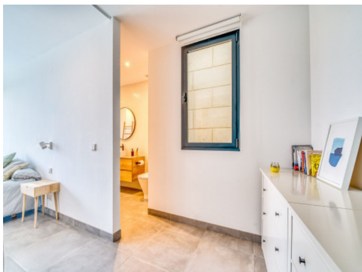
Access to the bathroom