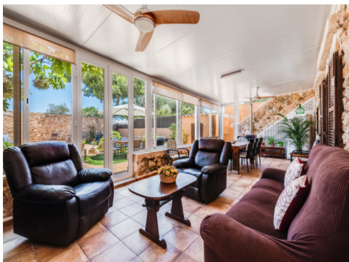
Wintergarden with dining area