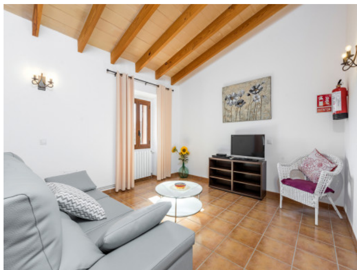
Light-flooded living area on the upper floor

All information is correct to the best of our knowledge. Errors and prior sale excepted. This prospectus is purely for information purposes. Only the notarized deed of sale is legally binding.