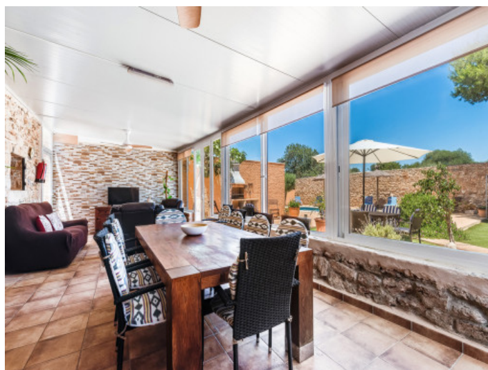
Wintergarden with dining area