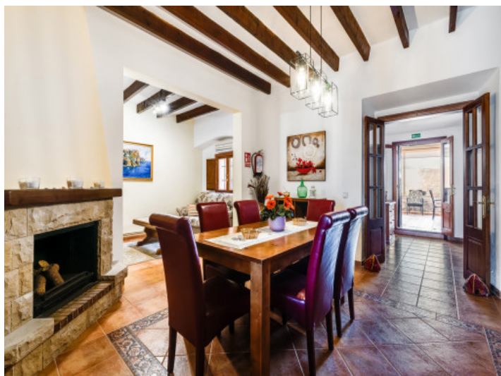
Living area on the ground floor