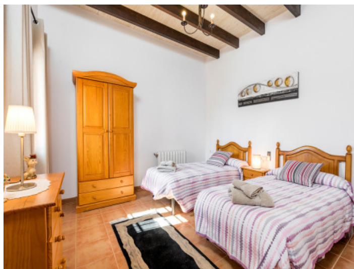
Bedroom with 2 single beds