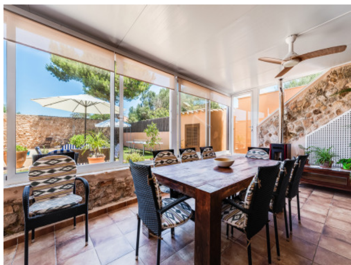
Wintergarden with dining area