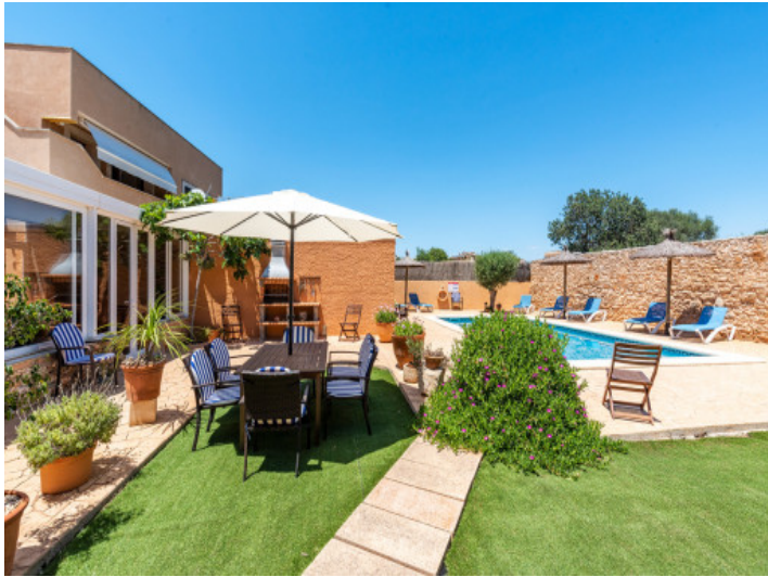
Garden and pool area