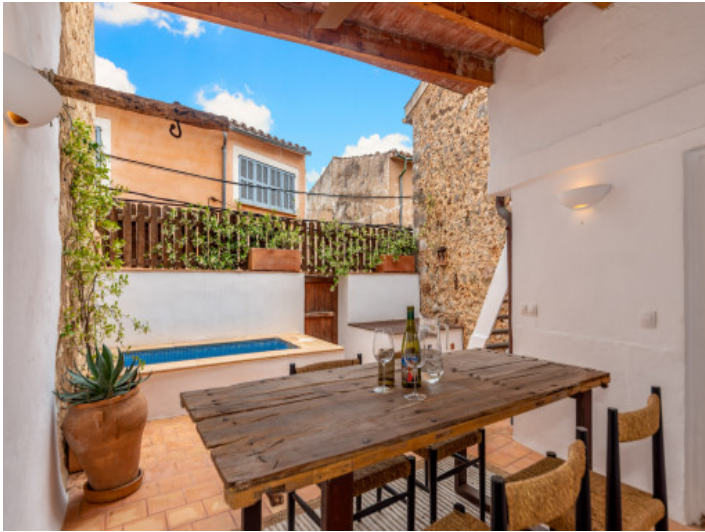
Patio and pool area