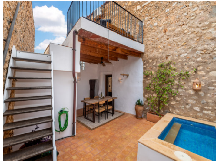
Patio and pool area