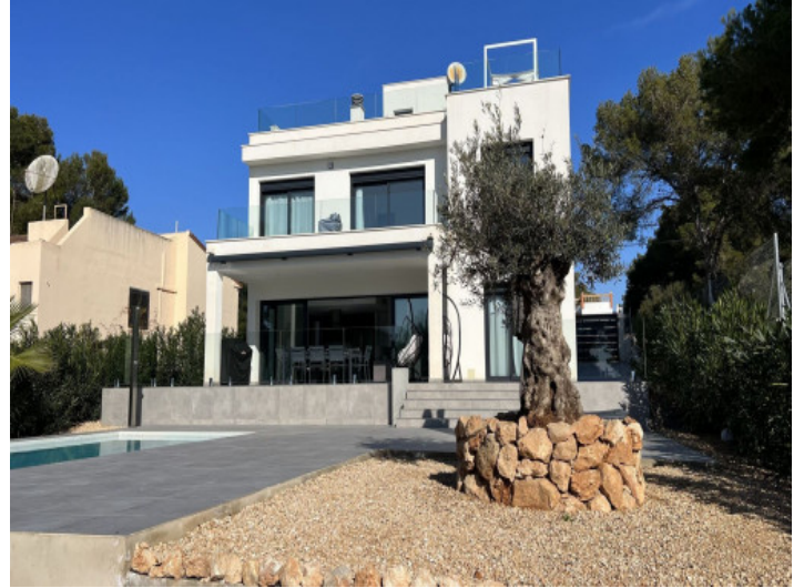
Villa and garden