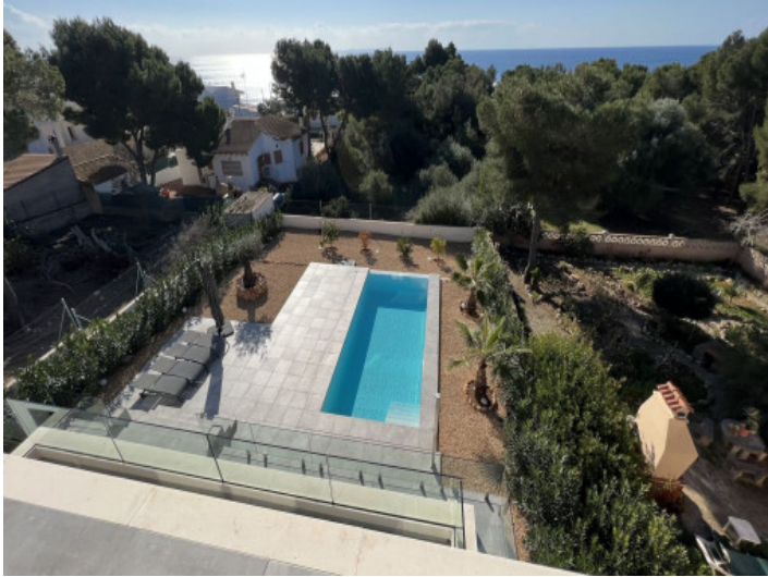
Pool and sea views