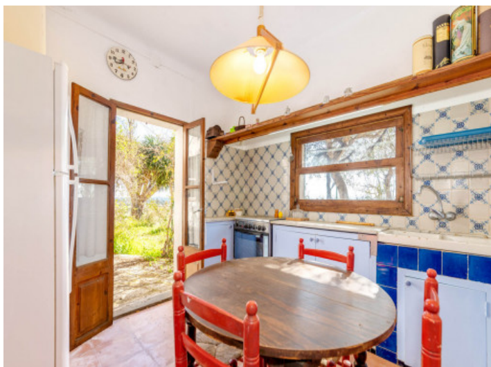
Dining area in the kitchen