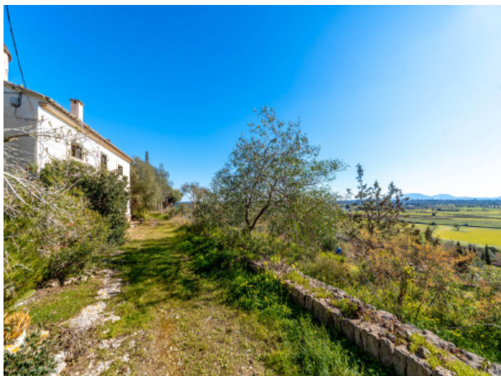
Garden with a view