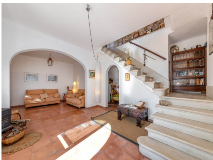
Entrance and living area