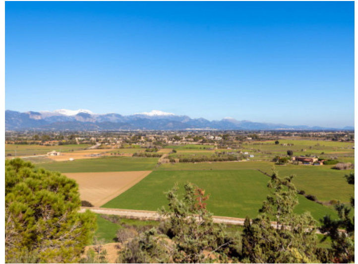
View from the finca