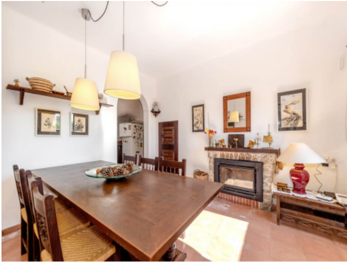
View of the dining area