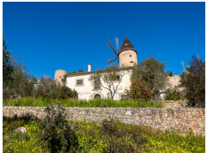
Exterior view and garden view

All information is correct to the best of our knowledge. Errors and prior sale excepted. This prospectus is purely for information purposes. Only the notarized deed of sale is legally binding.