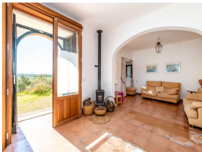
Entrance and living area