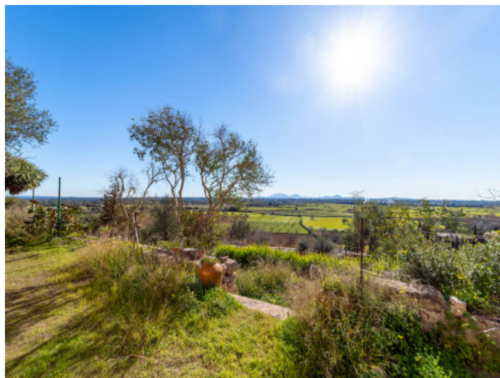
Splendid view of the finca