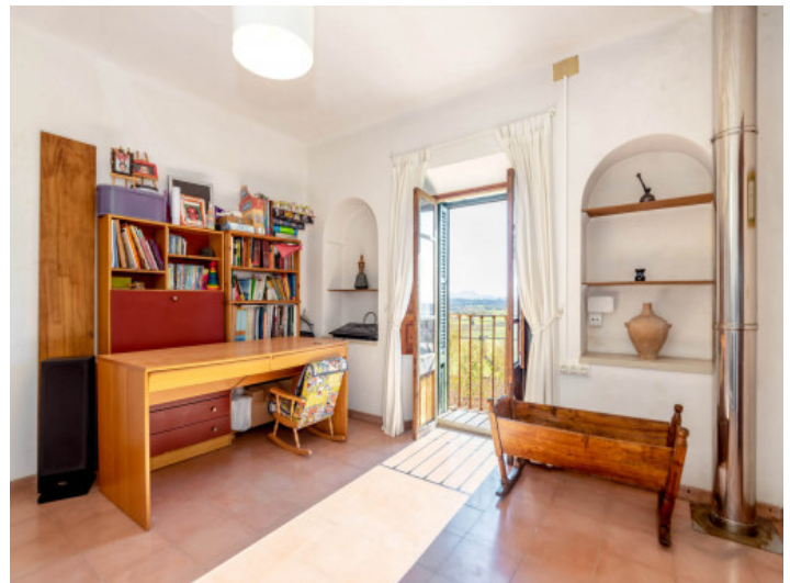
Upper living area