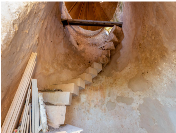
Stairs of the mill / tower