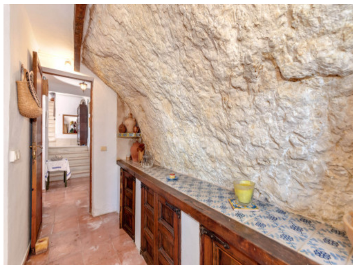
Stone wall as an absolute eye-catcher

All information is correct to the best of our knowledge. Errors and prior sale excepted. This prospectus is purely for information purposes. Only the notarized deed of sale is legally binding.