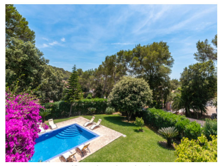
View to the garden and pool