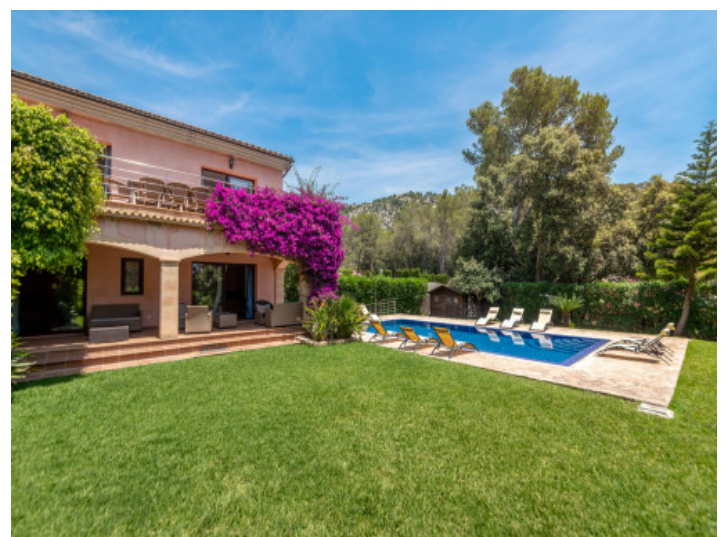
Very well mantained garden