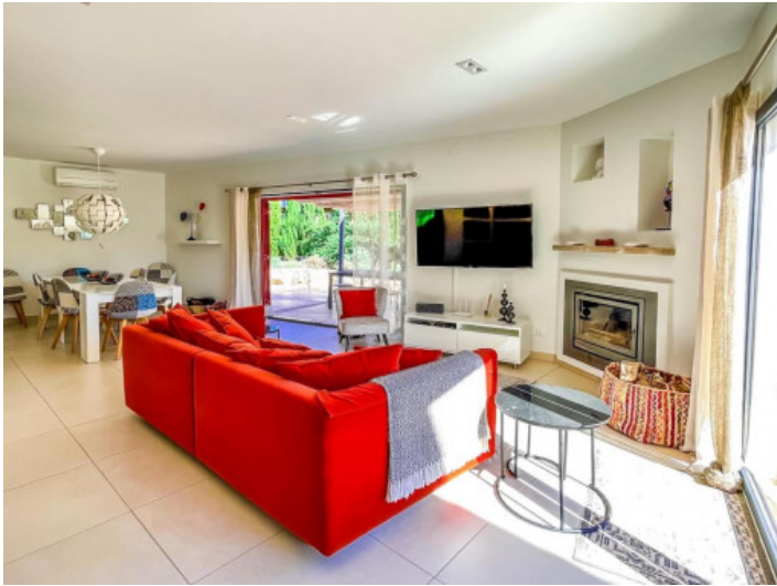
Lightflooded living and dining area