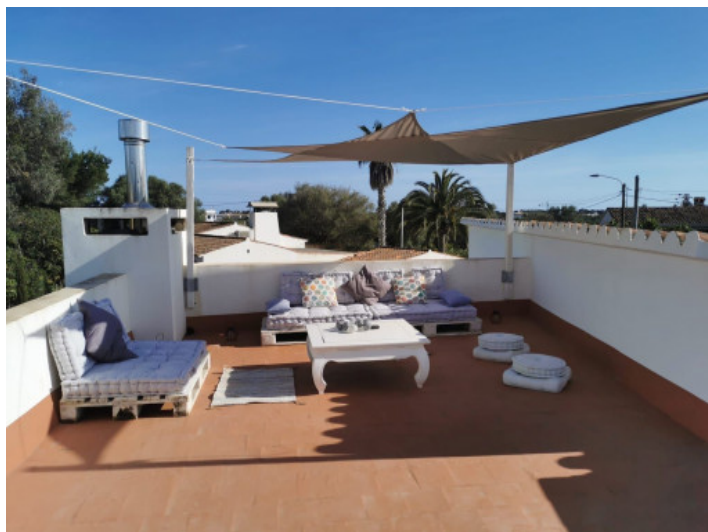
Sunny roof terrace