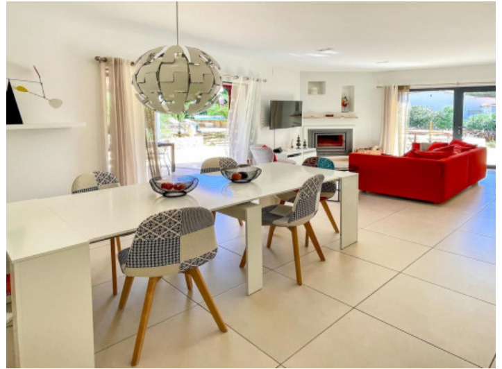
Modern living and dining area