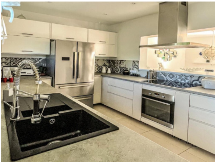
Large modern kitchen