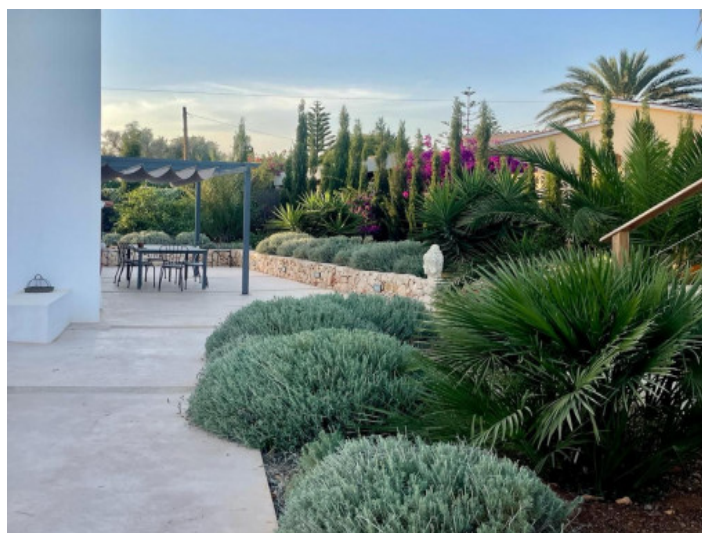
Mediterranean outdoor area