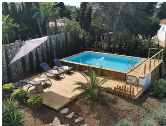
Beautifully laid-out pool area