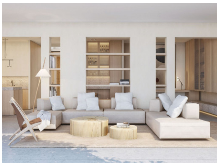
Generous living area