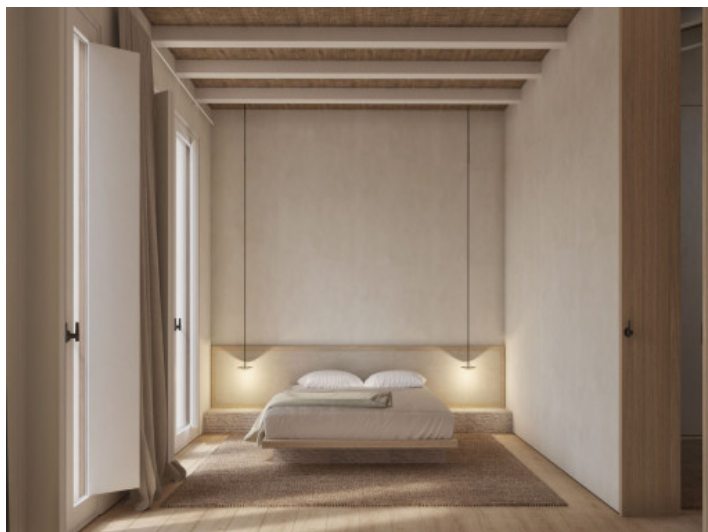
Master bedroom on the upper floor