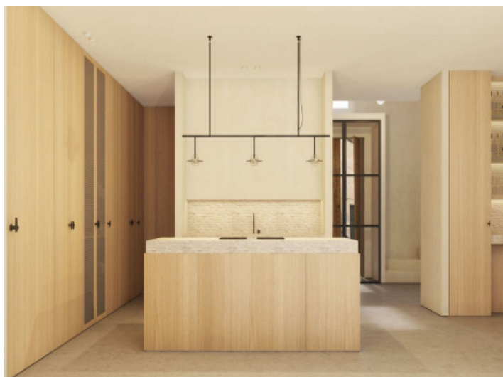
Open kitchen with island