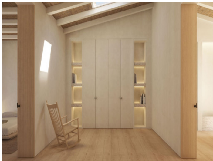
Beautiful dressing area