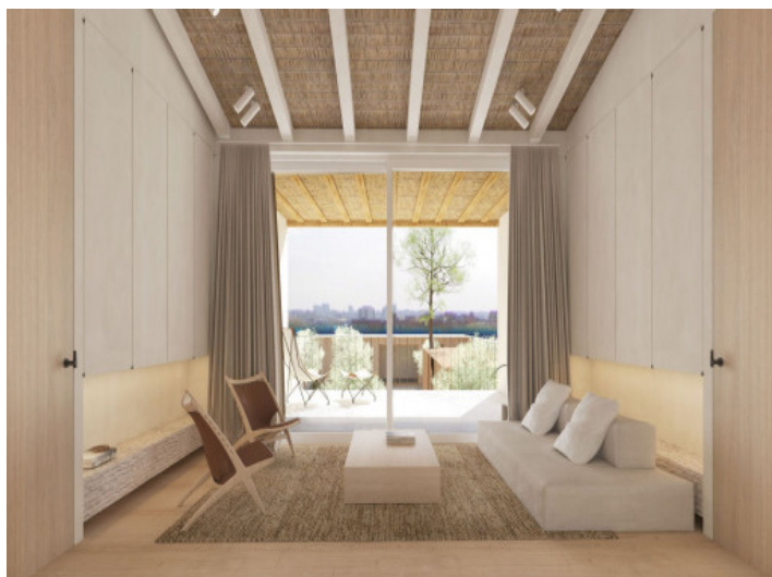
Bedroom with balcony