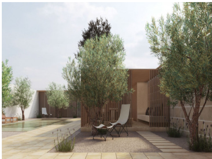
Garden with further building / guest house

All information is correct to the best of our knowledge. Errors and prior sale excepted. This prospectus is purely for information purposes. Only the notarized deed of sale is legally binding.