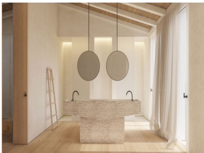
Luxurious master bathroom