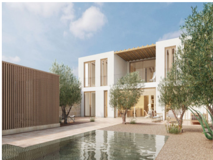
Mediterranean garden with pool