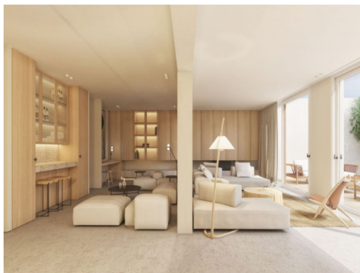
Living area divided into to areas