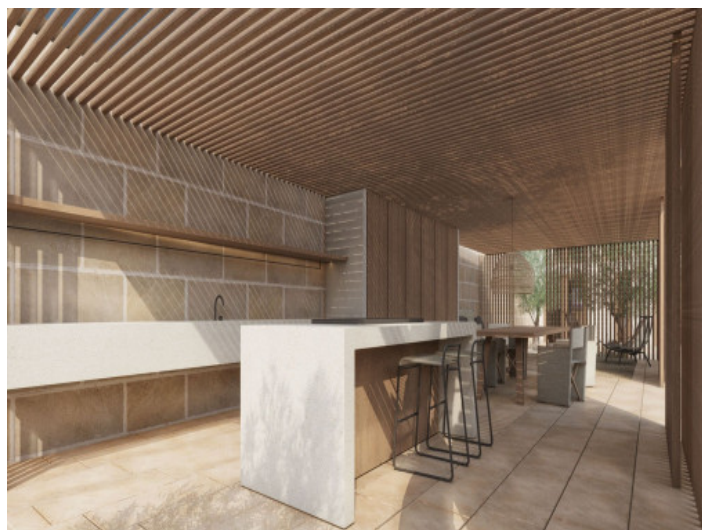
Large outdoor kitchen and dining area

All information is correct to the best of our knowledge. Errors and prior sale excepted. This prospectus is purely for information purposes. Only the notarized deed of sale is legally binding.