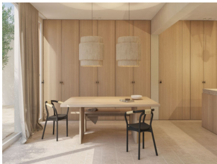
Adjoining dining area

All information is correct to the best of our knowledge. Errors and prior sale excepted. This prospectus is purely for information purposes. Only the notarized deed of sale is legally binding.