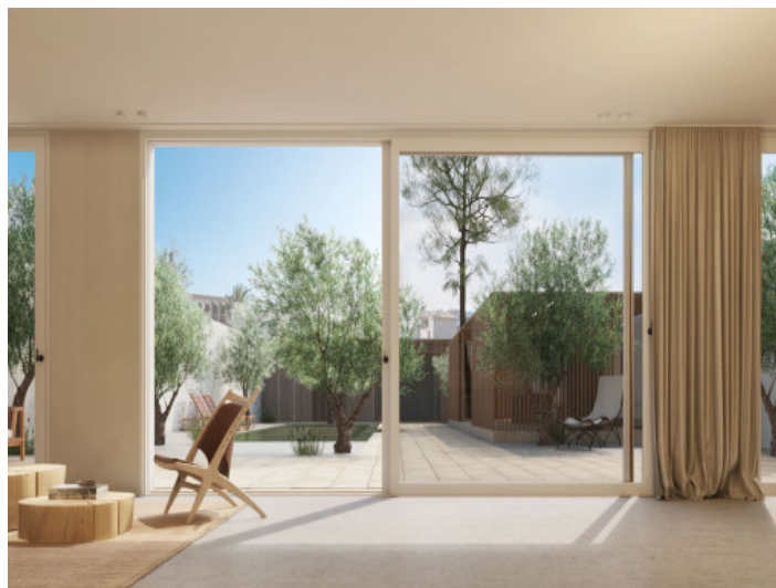
Access to the large outdoor area