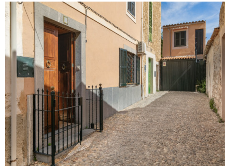
Entrance and garage