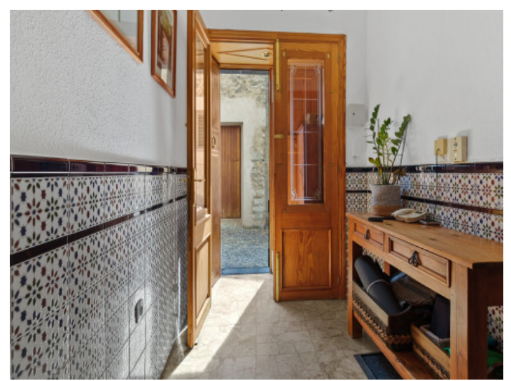
Beautiful entrance to the house