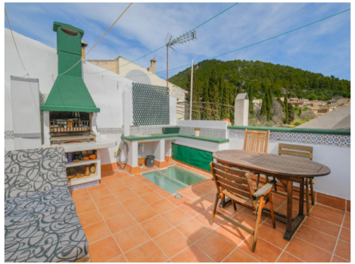
Fantastic roof terrace