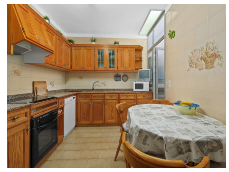
Large kitchen and dining area