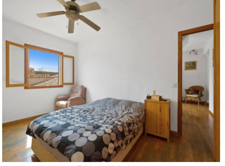
Bright double bedroom

All information is correct to the best of our knowledge. Errors and prior sale excepted. This prospectus is purely for information purposes. Only the notarized deed of sale is legally binding.