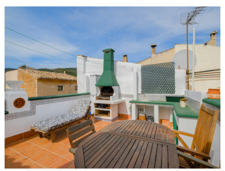
Roof terrace with bbg area