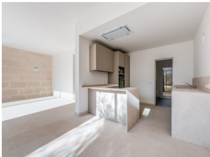
Alternative view of the kitchen