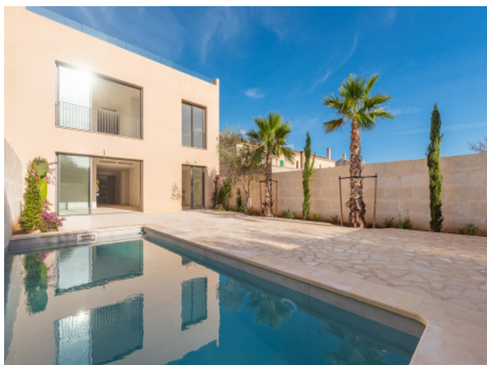
Modern town house with pool in Ses Salines

All information is correct to the best of our knowledge. Errors and prior sale excepted. This prospectus is purely for information purposes. Only the notarized deed of sale is legally binding.