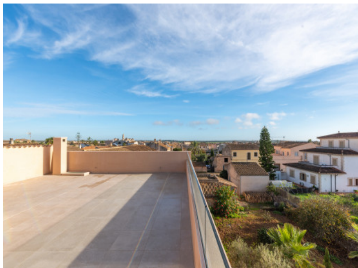
Roof terrace with a view