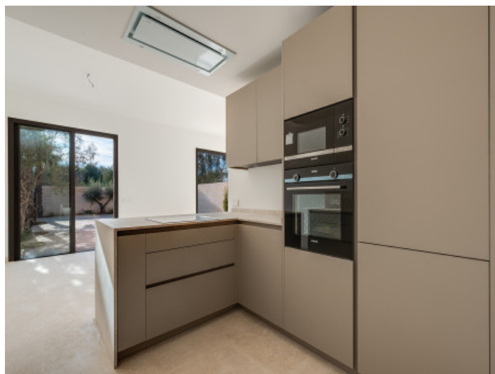
Modern kitchen with cooking island

All information is correct to the best of our knowledge. Errors and prior sale excepted. This prospectus is purely for information purposes. Only the notarized deed of sale is legally binding.