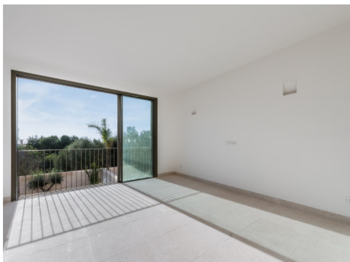
Upper living area with balcony