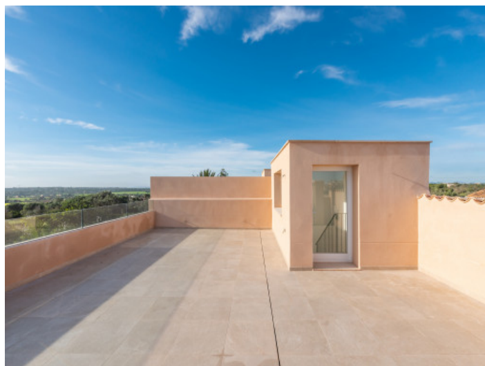
Terrace with a view

All information is correct to the best of our knowledge. Errors and prior sale excepted. This prospectus is purely for information purposes. Only the notarized deed of sale is legally binding.