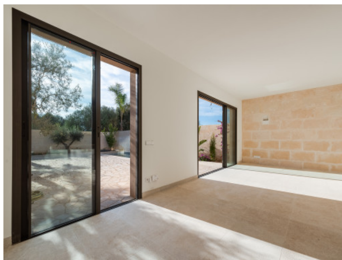
Light flooded living area