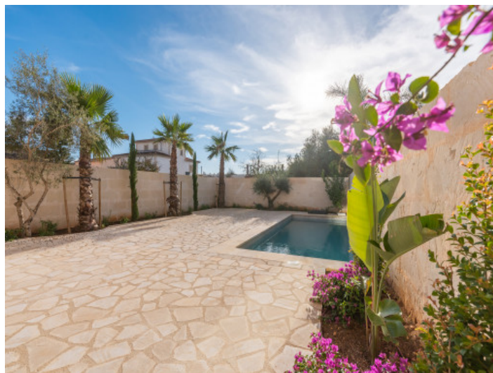
Sunny pool area