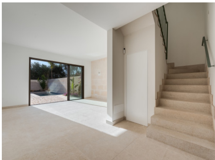
Light flooded living area