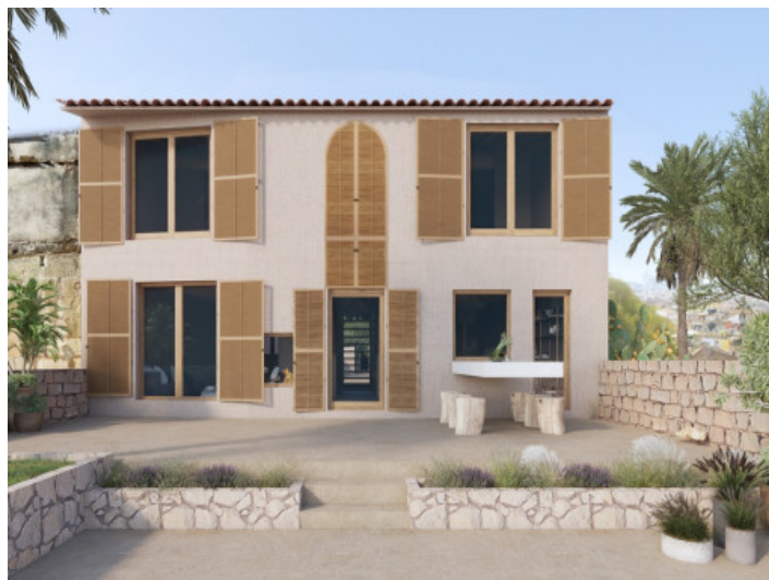
Facade view with outdoor terrace