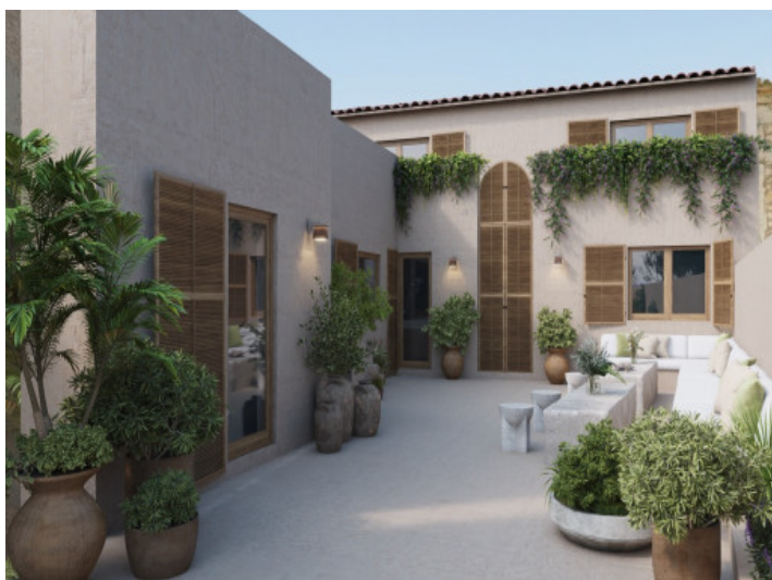
Patio with private lounge area