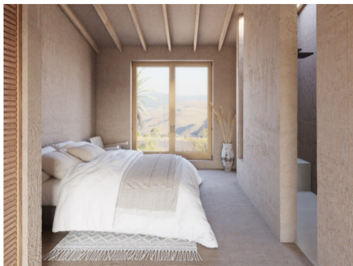
One of the double bedrooms

All information is correct to the best of our knowledge. Errors and prior sale excepted. This prospectus is purely for information purposes. Only the notarized deed of sale is legally binding.