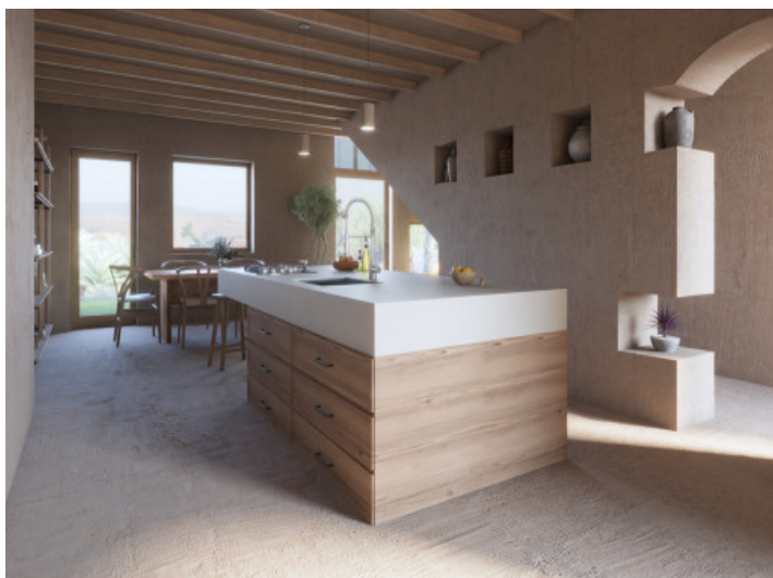
Kitchen and dining area