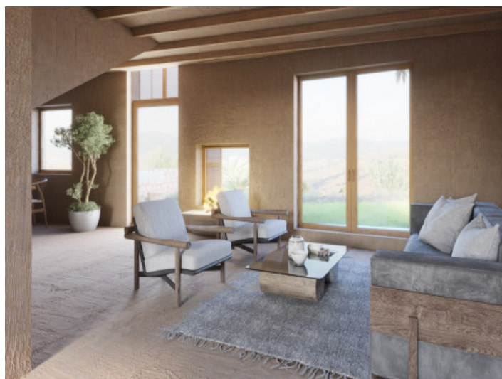
Modern interior design