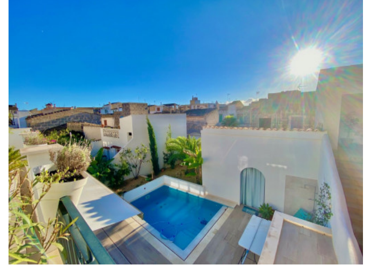
View to the pool

PORTA MALLORQUINA<sup>®</sup> Your home. Our passion.