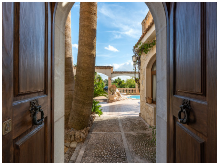
Entrance to the house