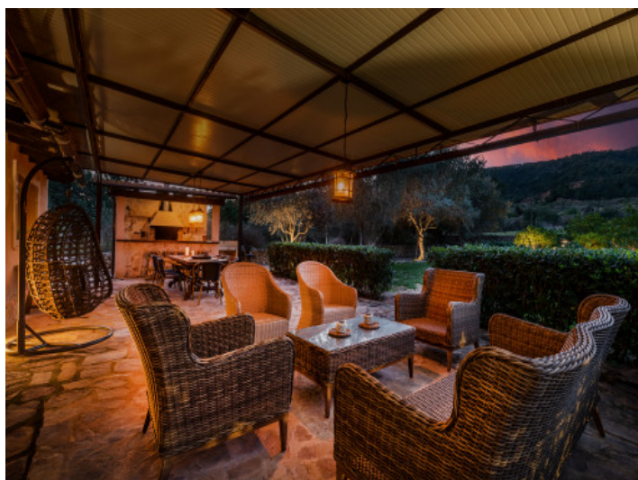
Terrace at night