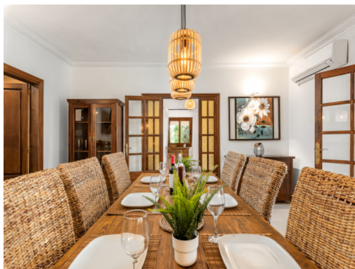
Dining area in the centre of the room