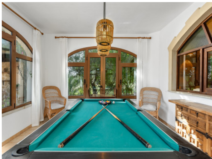
Fantastic billiard area