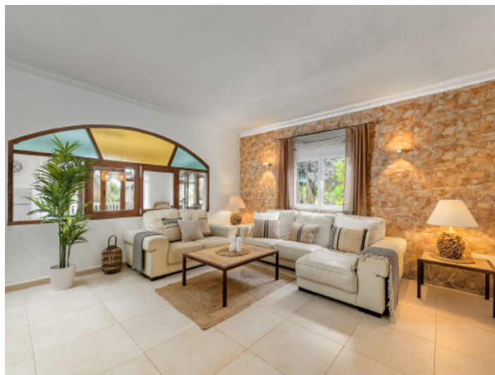
Living area with stone wall