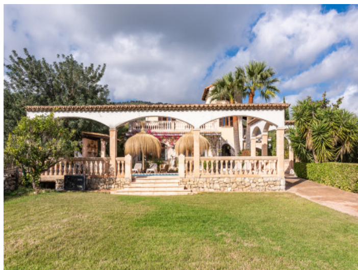
View from the garden

All information is correct to the best of our knowledge. Errors and prior sale excepted. This prospectus is purely for information purposes. Only the notarized deed of sale is legally binding.