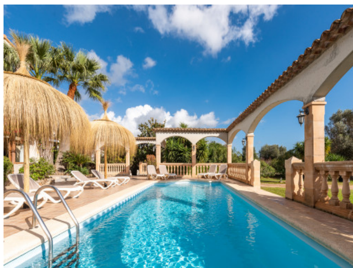
Dreamlike finca with holiday rental license in Biniamar, Selva