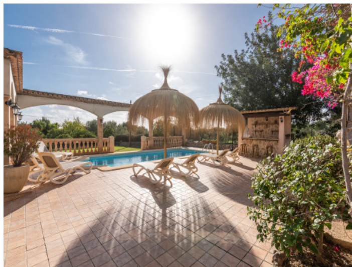
Lovely pool area