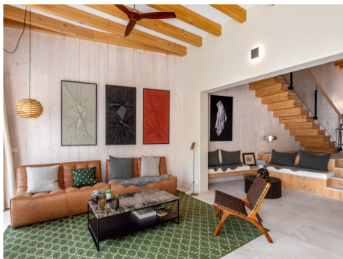
Elegant living area