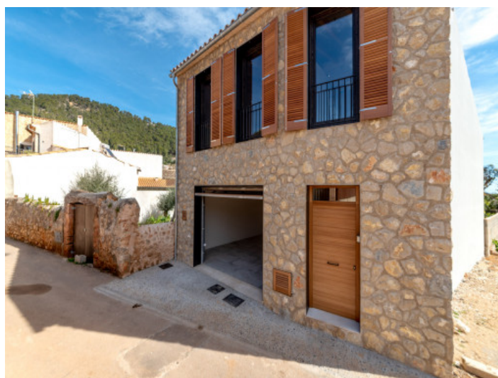
Exterior view and garage of the house

All information is correct to the best of our knowledge. Errors and prior sale excepted. This prospectus is purely for information purposes. Only the notarized deed of sale is legally binding.