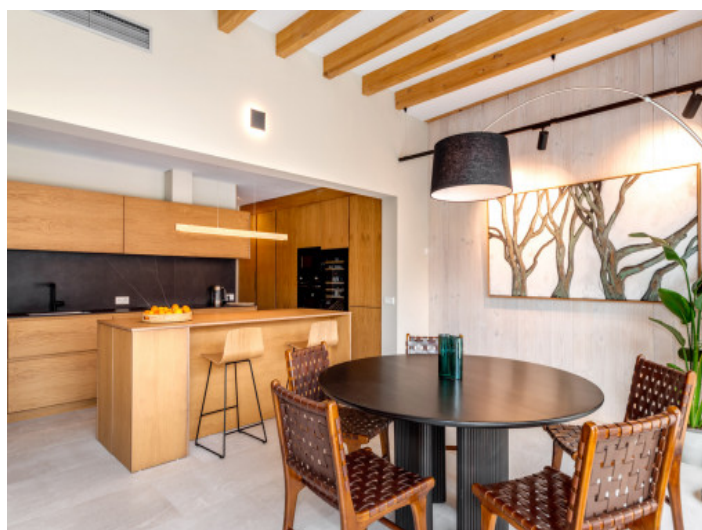
American kitchen and dining area

All information is correct to the best of our knowledge. Errors and prior sale excepted. This prospectus is purely for information purposes. Only the notarized deed of sale is legally binding.