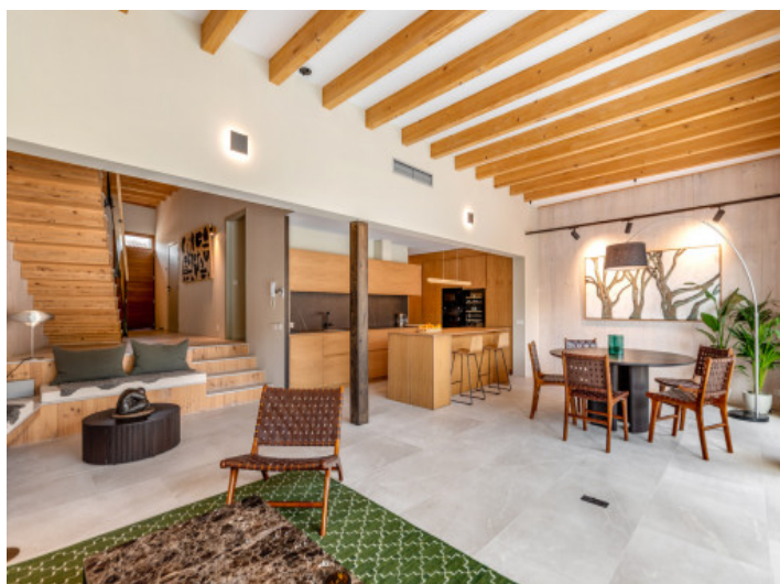
Open plan living area