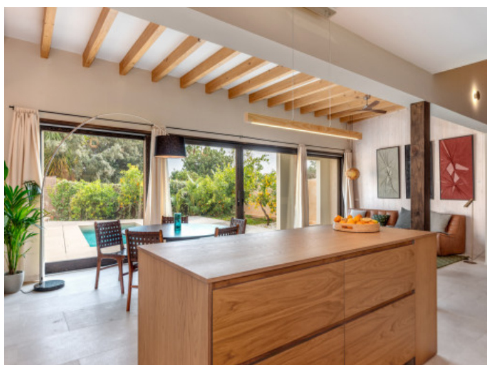
Fully equipped kitchen with island