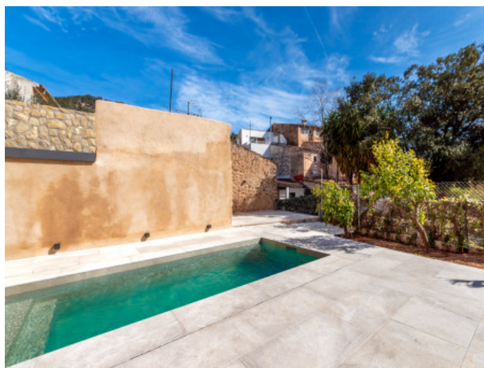
Well-maintained pool area