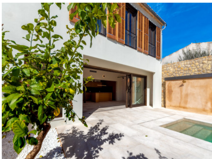
View of the terrace