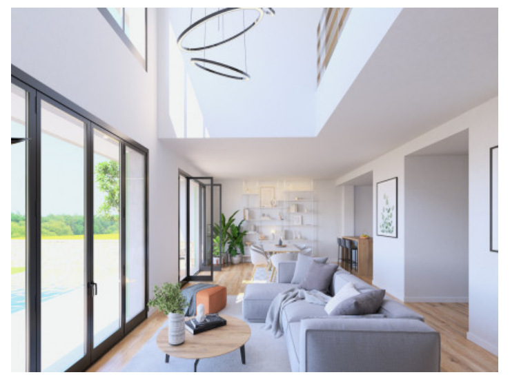
Light flooded living area