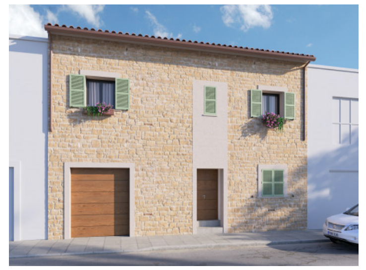
font view of the house

All information is correct to the best of our knowledge. Errors and prior sale excepted. This prospectus is purely for information purposes. Only the notarized deed of sale is legally binding.