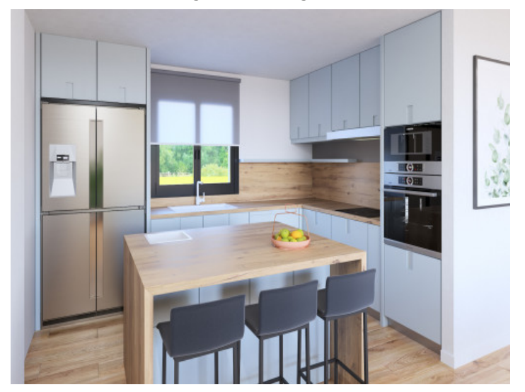
Modern kitchen with cooking island