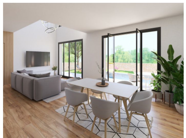
Light flooded living area