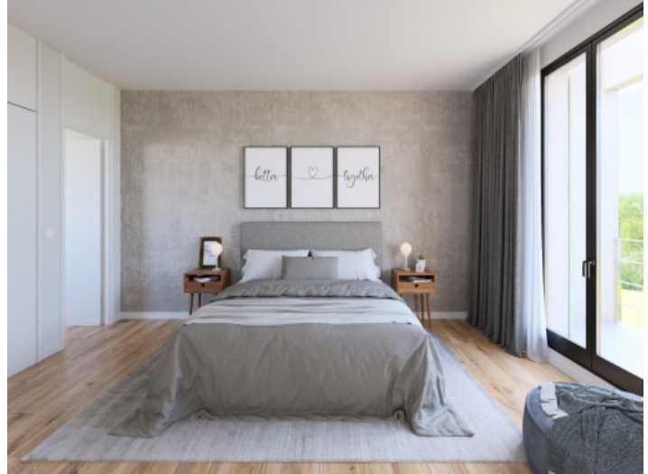
Bright double bedroom