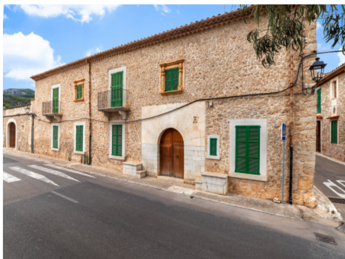
Front view of the house