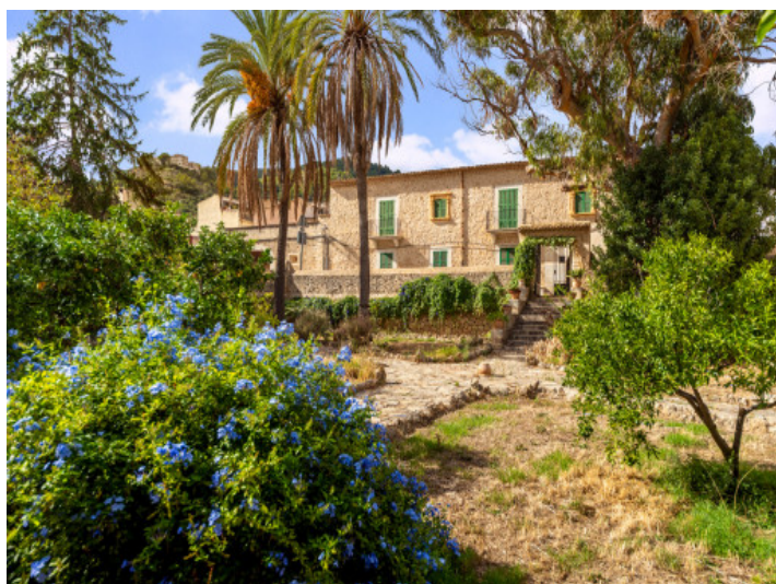
Historic town house with garden in Manacor de la Vall