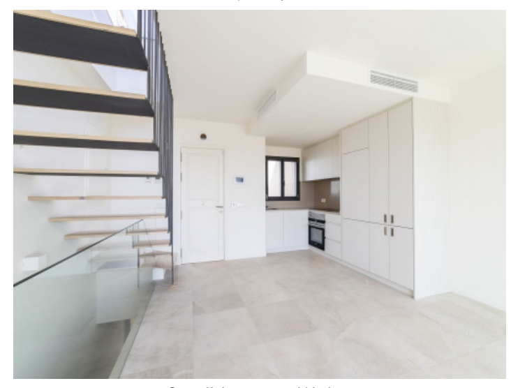
Open living area and kitchen