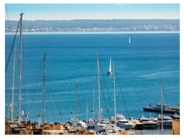
Town house with roof terrace with views to the cathedral of Palma

All information is correct to the best of our knowledge. Errors and prior sale excepted. This prospectus is purely for information purposes. Only the notarized deed of sale is legally binding.