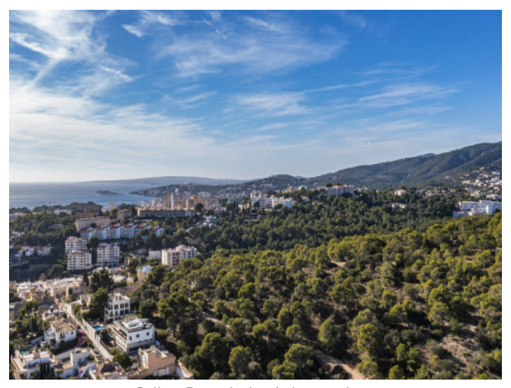
Bellver Forest is the city's green lung