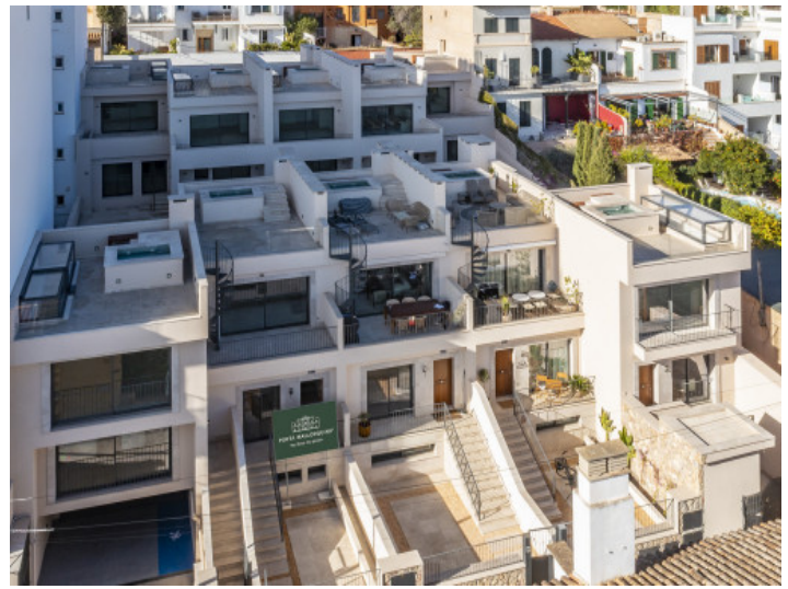
Terraced house with 3 levels