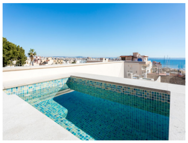
Rooftop with jacuzzi