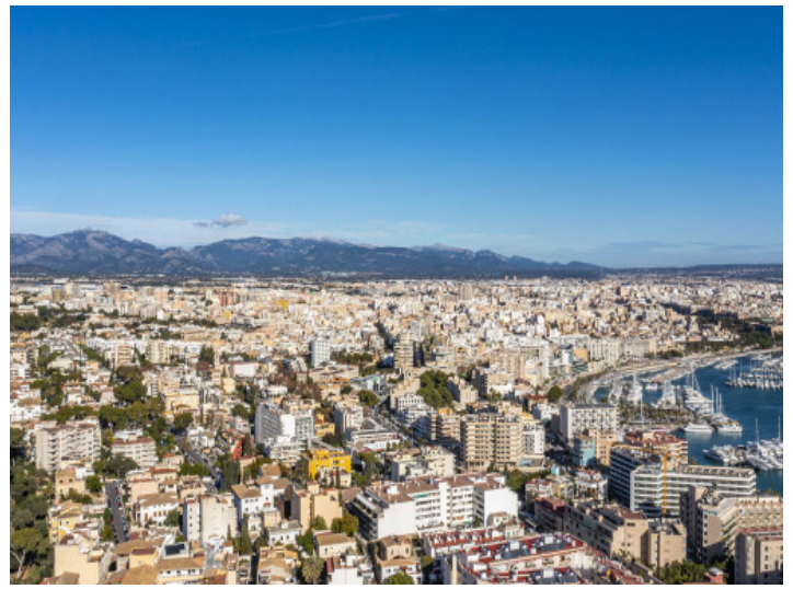
El Terreno district