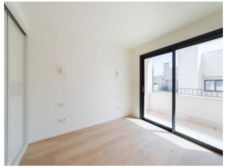
Bedroom with balcony

All information is correct to the best of our knowledge. Errors and prior sale excepted. This prospectus is purely for information purposes. Only the notarized deed of sale is legally binding.