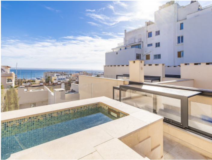
Rooftop with jacuzzi