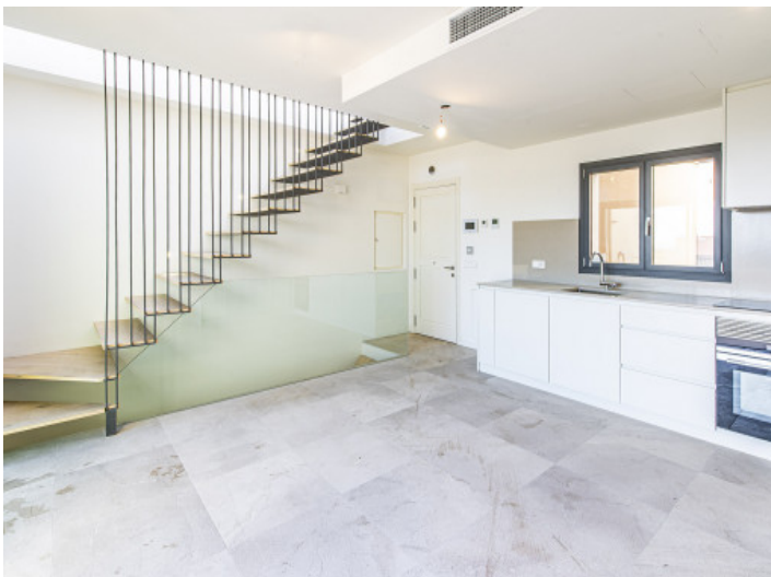
Modern open plan kitchen