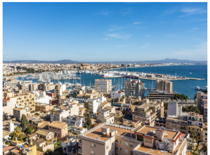
Close to the harbour and city center