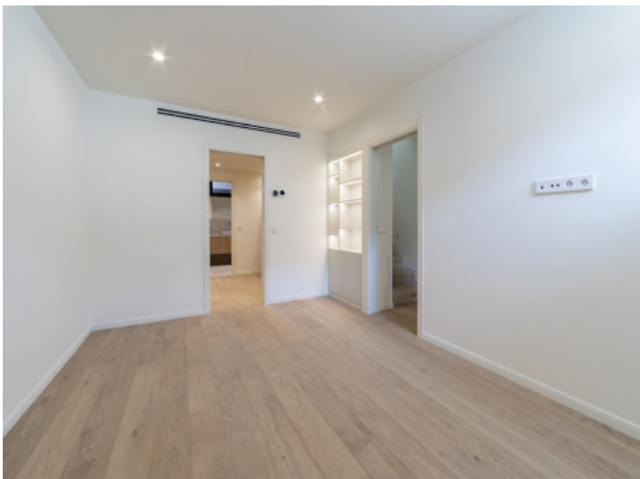
Master bedroom with bathroom en suite