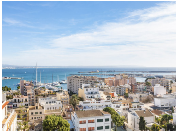
Close to the city center and harbour