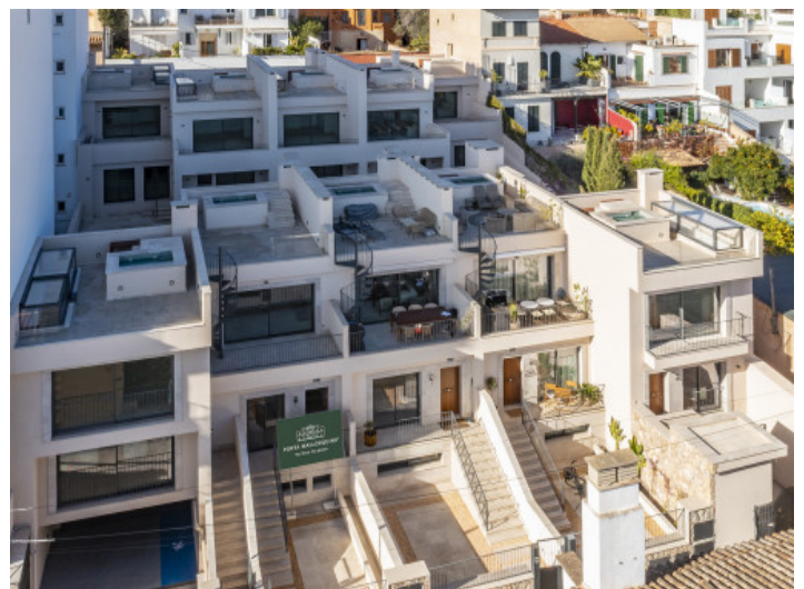
Terraced house with 3 levels and rooftop

All information is correct to the best of our knowledge. Errors and prior sale excepted. This prospectus is purely for information purposes. Only the notarized deed of sale is legally binding.