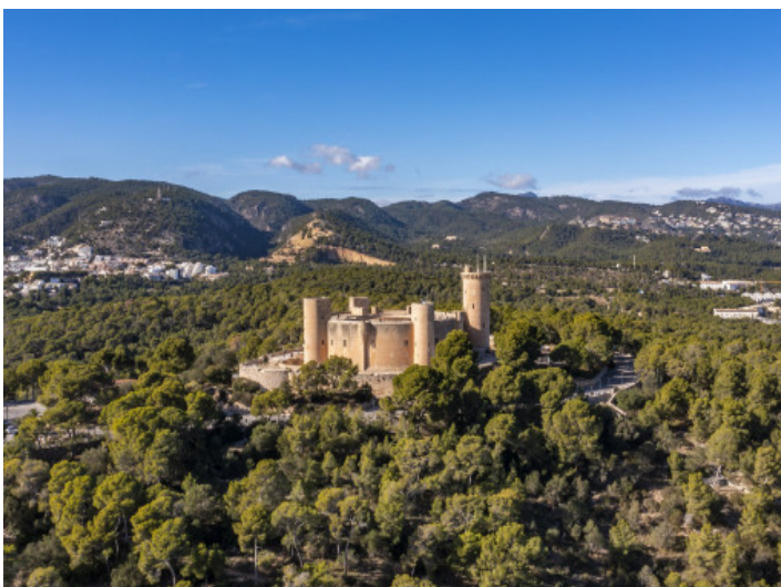
Castle of Bellver in walking distance