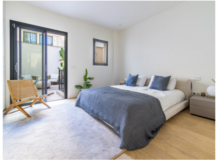
Master bedroom with private patio