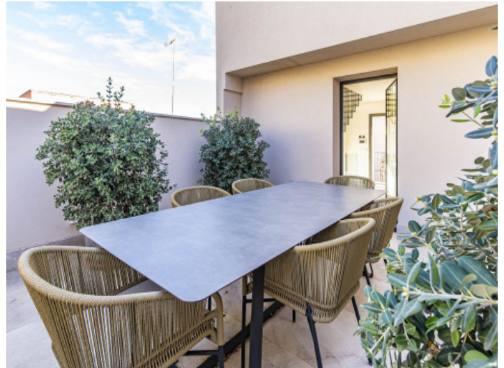
Great outdoor dining area