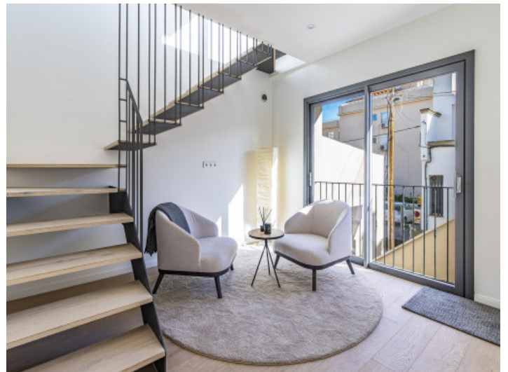
Bright entrance hall