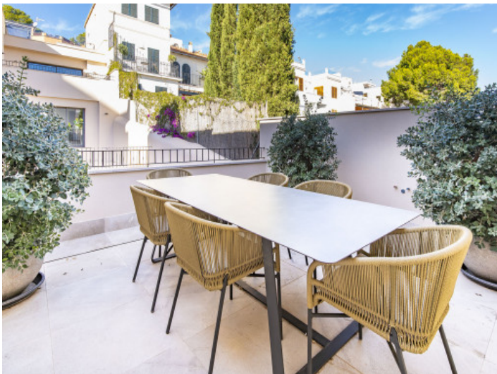
Large outdoor dining area