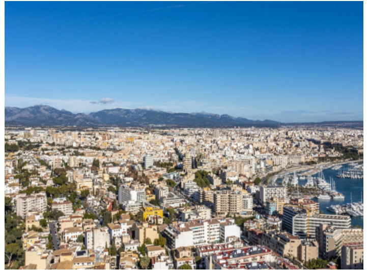
El Terreno district