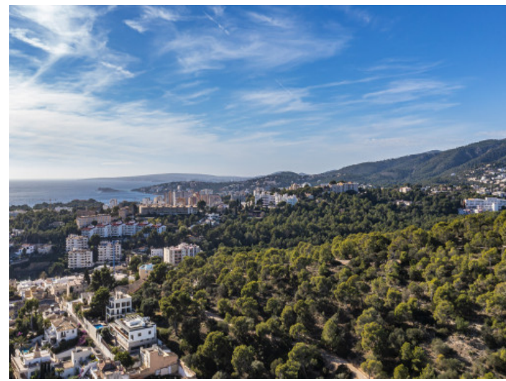
Bellver Forest is the city's green lung