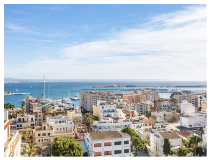
Close to the city center and harbour