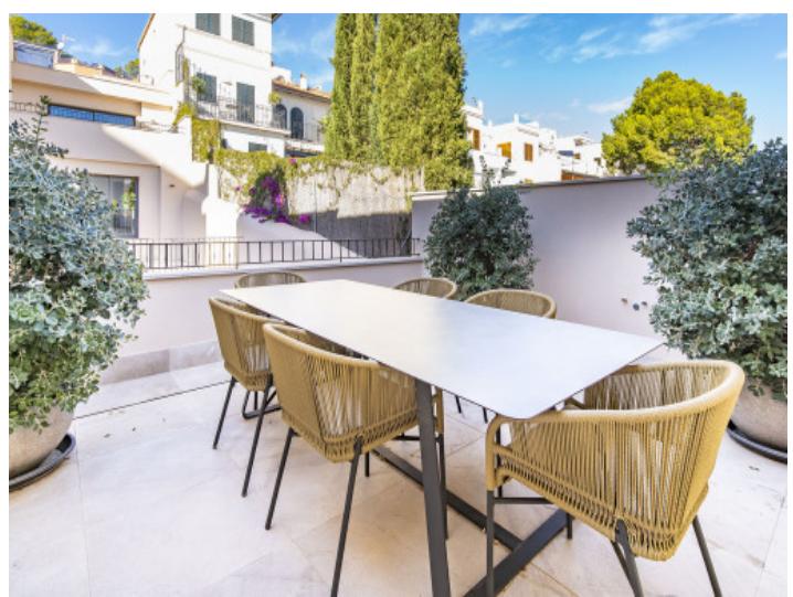
Large outdoor dining area