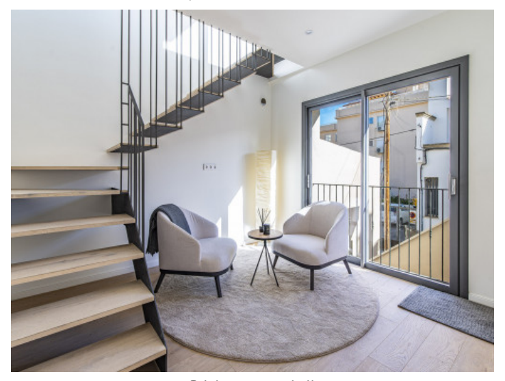
Bright entrance hall