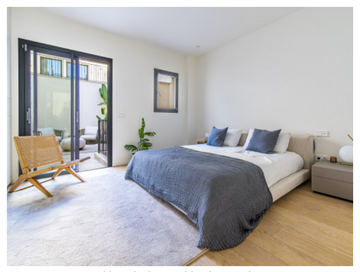
Masterbedroom with private patio