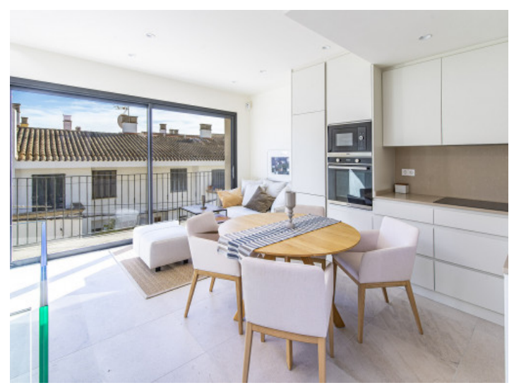
Modern american kitchen