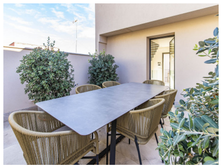
Great outdoor dining area