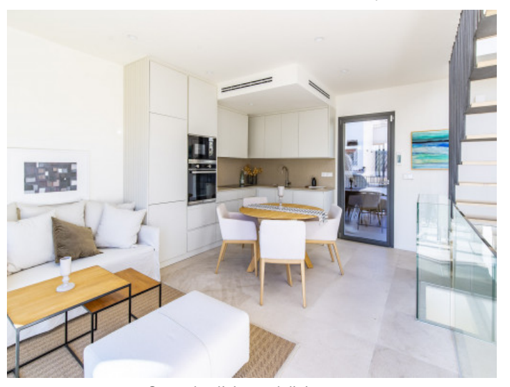
Open plan living and dining area