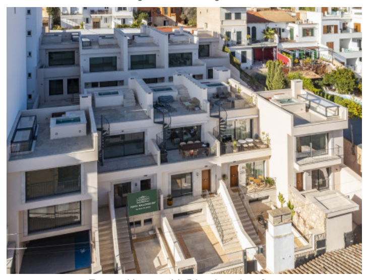
Terraced house with 3 levels and rooftop