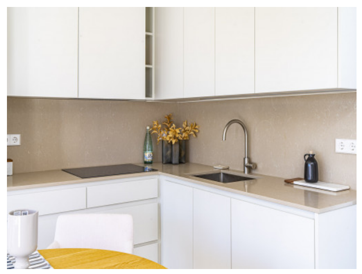
Kitchen with plenty of storage space