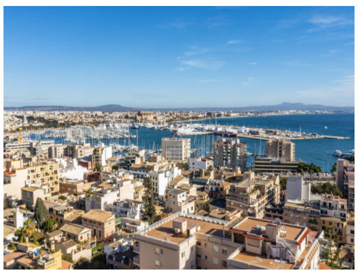
Close to the harbour and city center