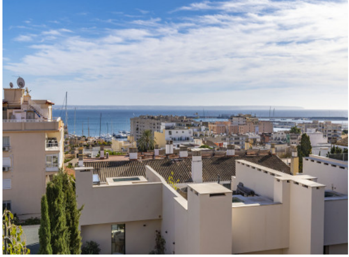
View over the roofs to the sea