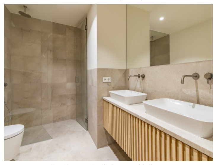
One of two modern bathrooms with shower