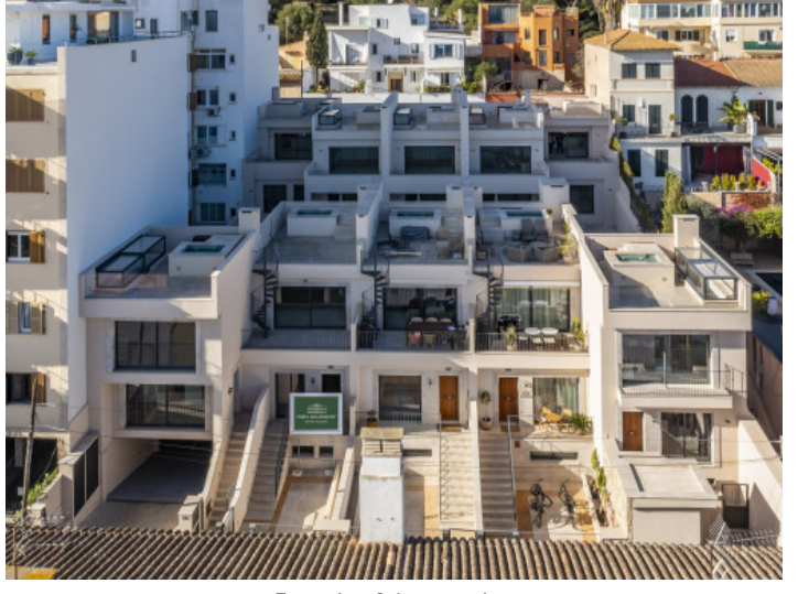
Fassade of the complex