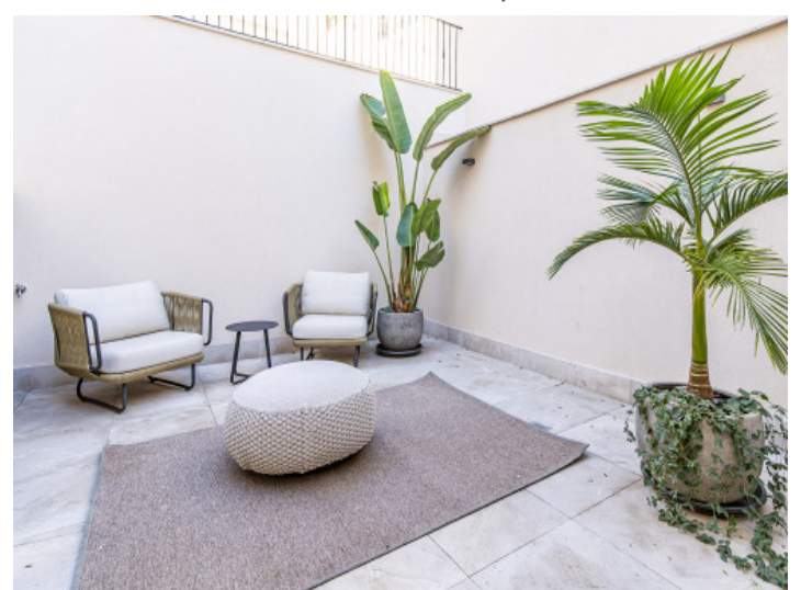
Private patio of the masterbedroom