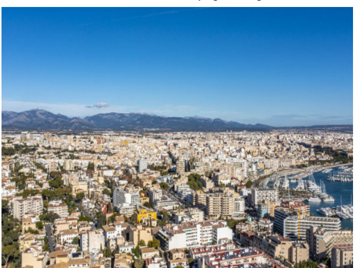
El Terreno district