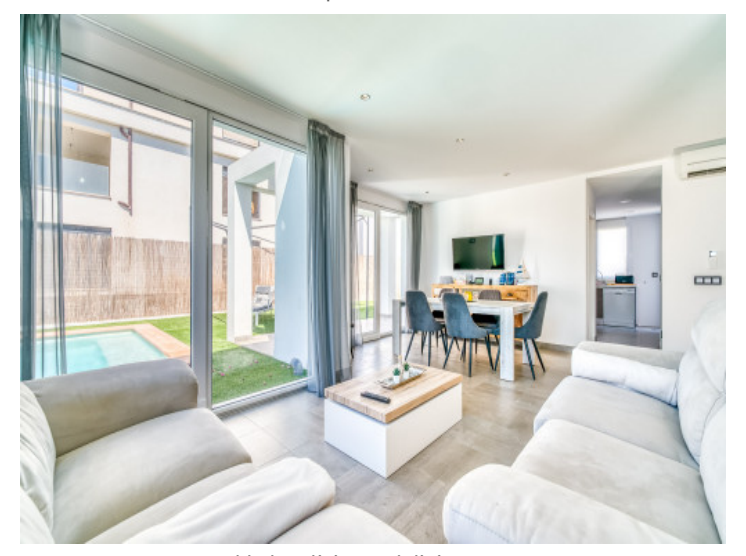
Modern living and dining area