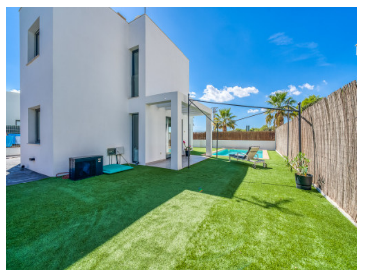
Outdoor area with ample space