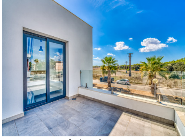
Spacious roof terrace