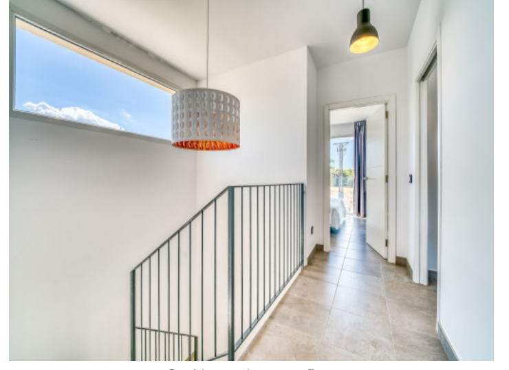
Corridor on the upper floor

All information is correct to the best of our knowledge. Errors and prior sale excepted. This prospectus is purely for information purposes. Only the notarized deed of sale is legally binding.