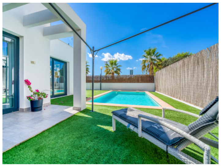
Wonderful pool and terrace area