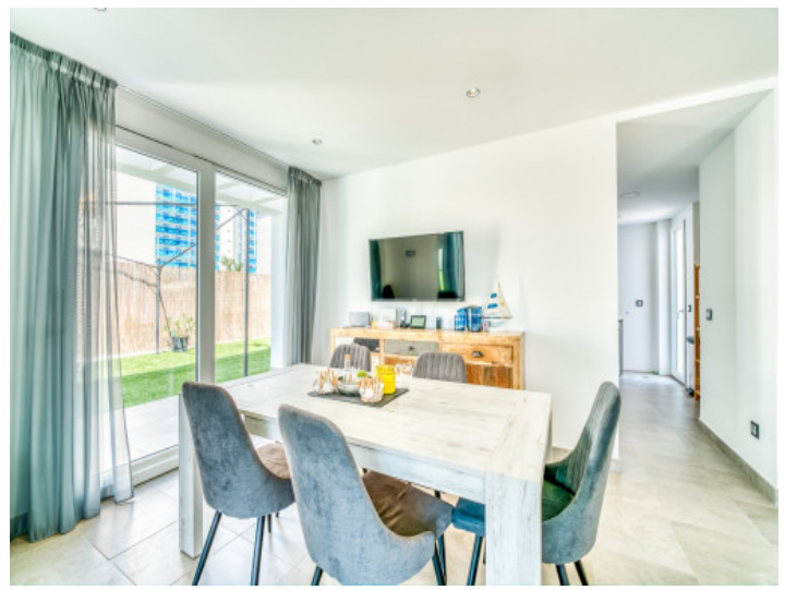
Dining area with terrace access