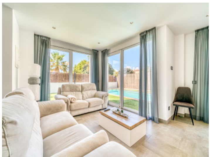
Lightflooded living area