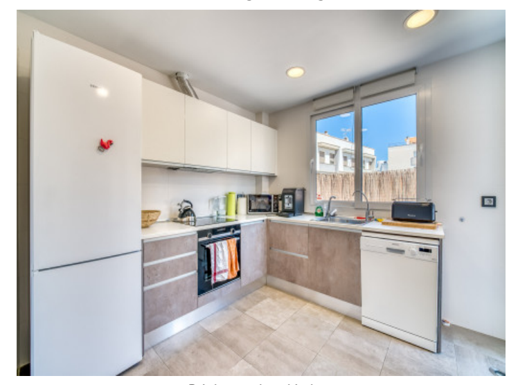
Bright, modern kitchen