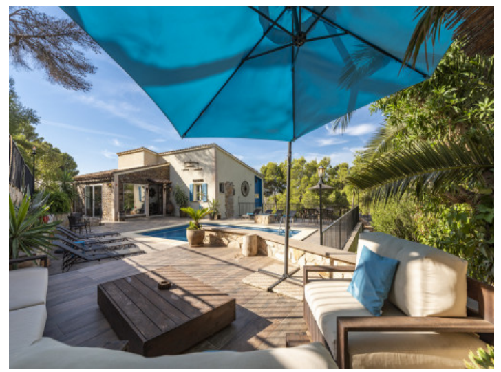
Wonderful pool area