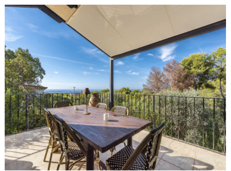
Terrace with a view