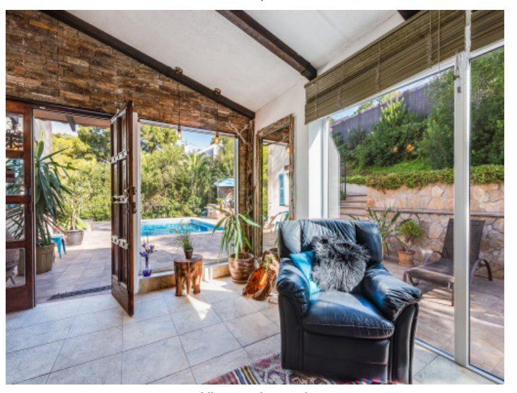
View to the pool