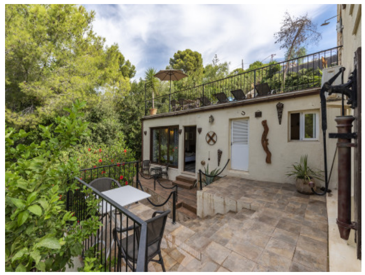
Access to the apartment