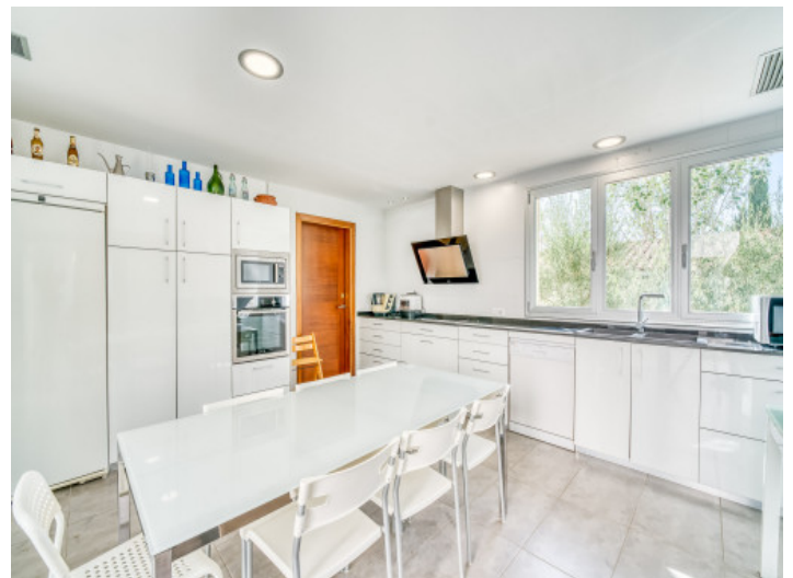
Large, modern kitchen

All information is correct to the best of our knowledge. Errors and prior sale excepted. This prospectus is purely for information purposes. Only the notarized deed of sale is legally binding.