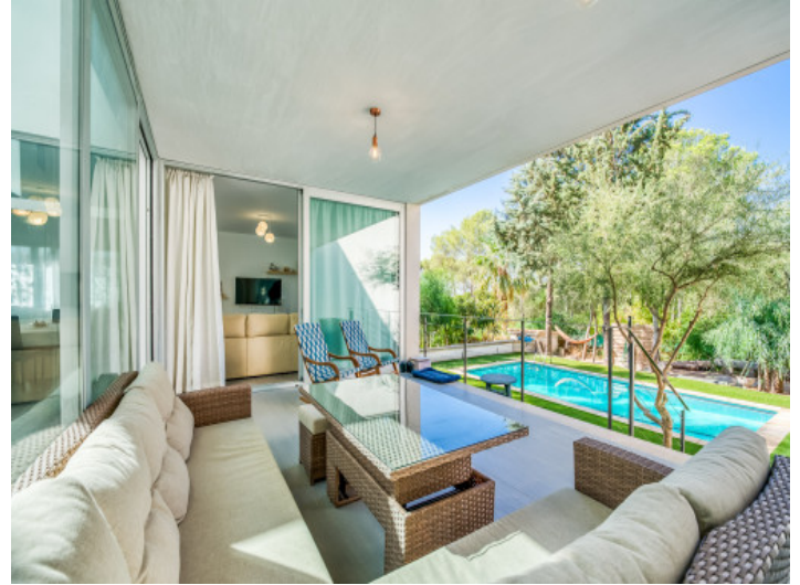
Covered lounge terrace with view to the pool