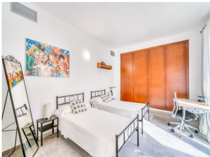
One of 6 bedrooms