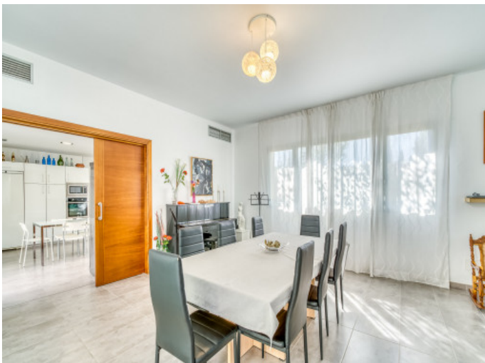
Bright dining area with access to the kitchen