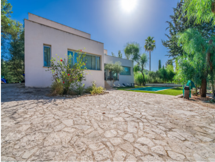
Exterior view and outdoor area

All information is correct to the best of our knowledge. Errors and prior sale excepted. This prospectus is purely for information purposes. Only the notarized deed of sale is legally binding.