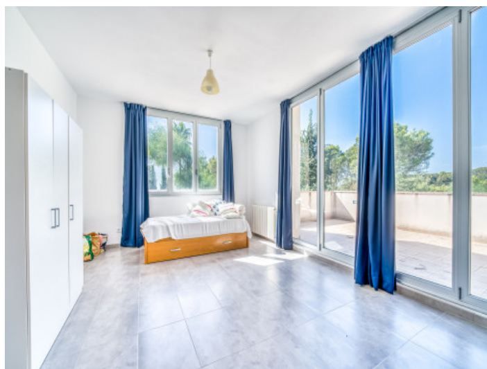
Lighflooded bedroom with roof terrace