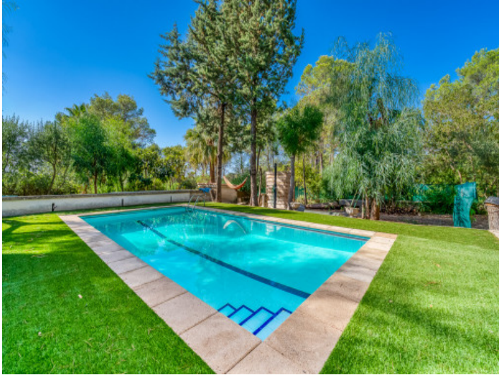
Large, private pool area