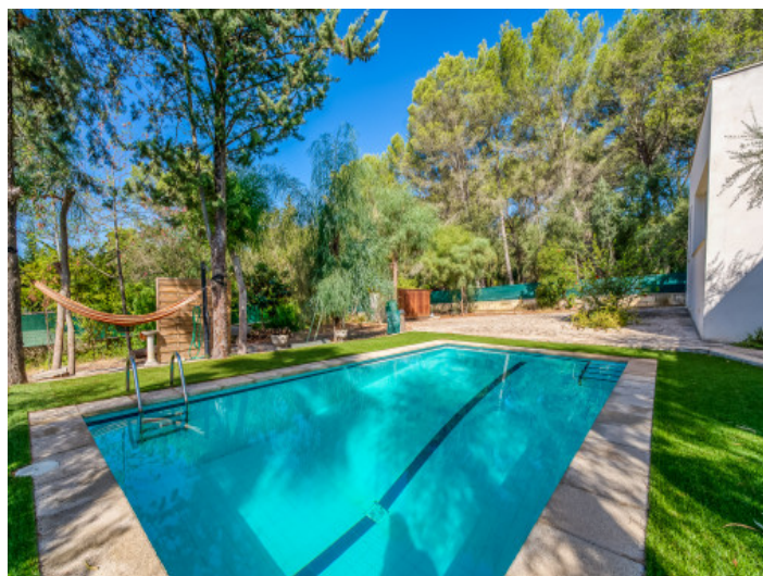
Salt-water pool surrounded by various trees

All information is correct to the best of our knowledge. Errors and prior sale excepted. This prospectus is purely for information purposes. Only the notarized deed of sale is legally binding.