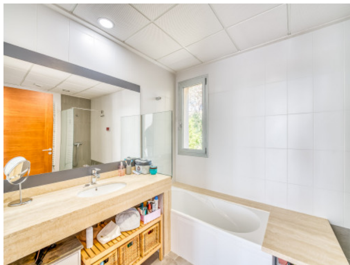
Modern bathroom with bathtub