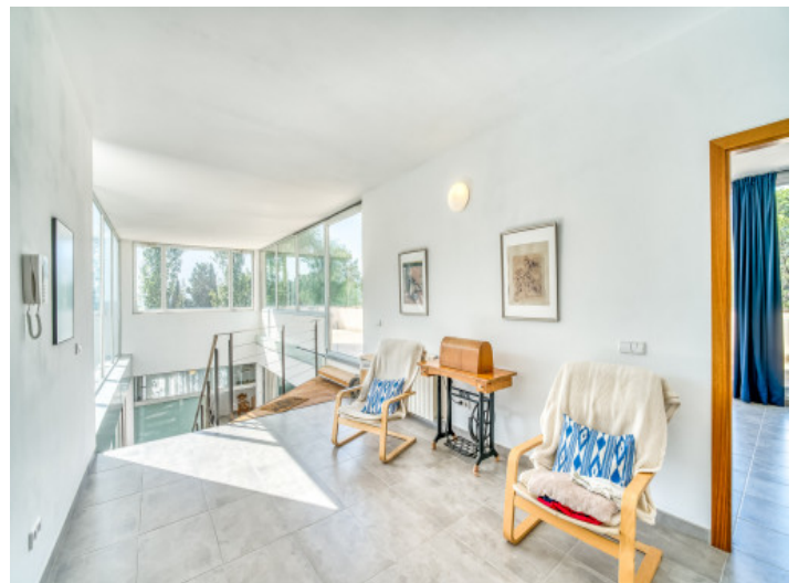
Corridor on the upper floor

All information is correct to the best of our knowledge. Errors and prior sale excepted. This prospectus is purely for information purposes. Only the notarized deed of sale is legally binding.