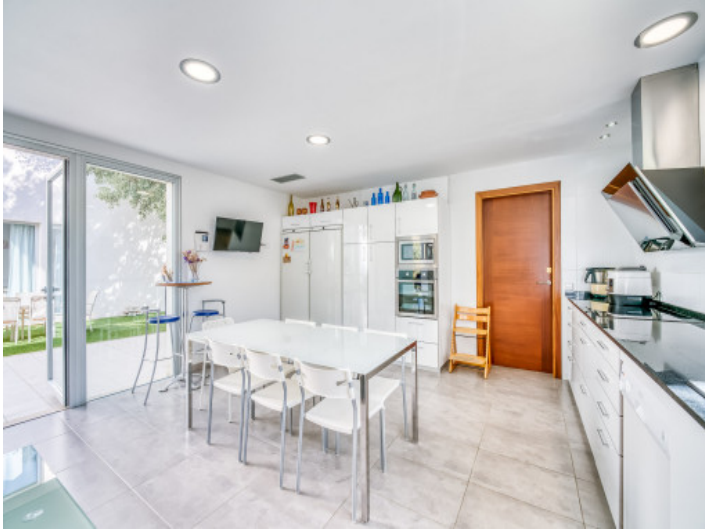
Direct access to a patio-terrace