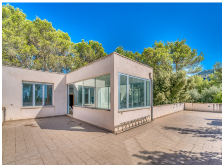
100 sqm roof terrace