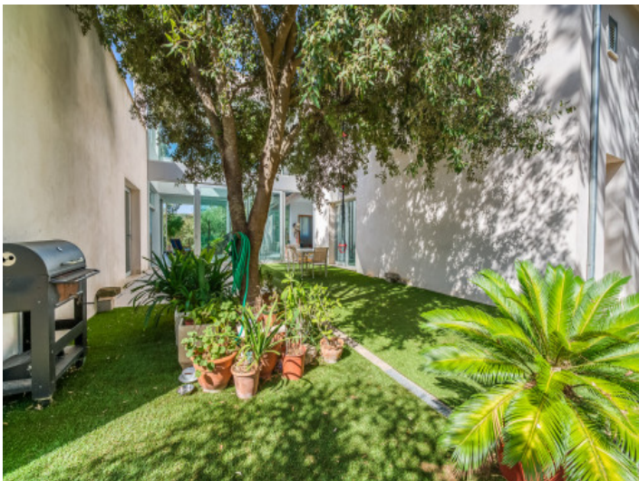
Idyllic patio-like bbq terrace