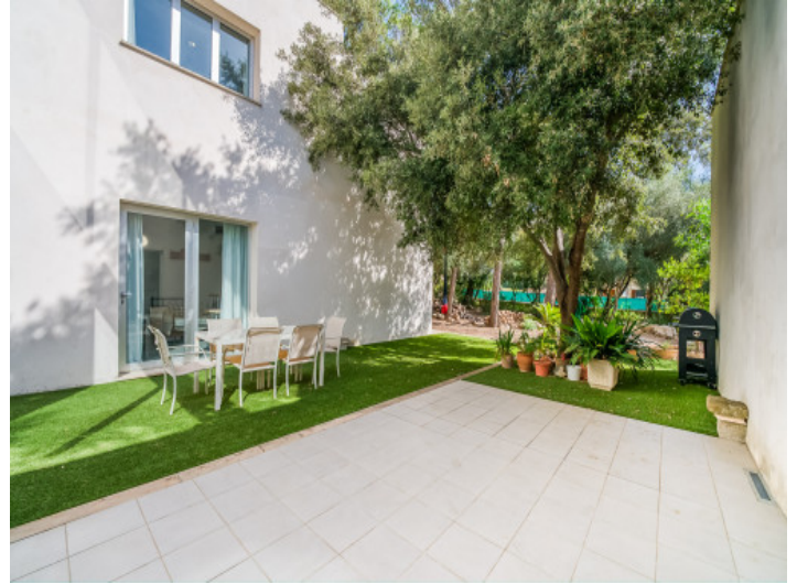
Spacious kitchen terrace