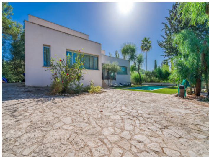
Exterior view and outdoor area

All information is correct to the best of our knowledge. Errors and prior sale excepted. This prospectus is purely for information purposes. Only the notarized deed of sale is legally binding.