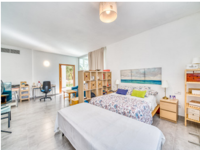
Large bedroom on the ground floor