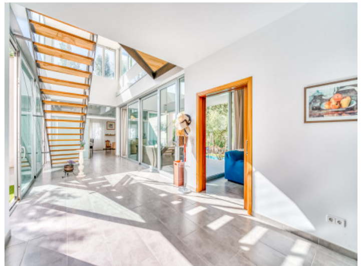
Elegant interior design