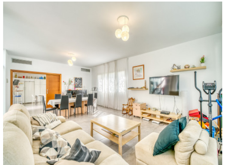
Large living and dining area