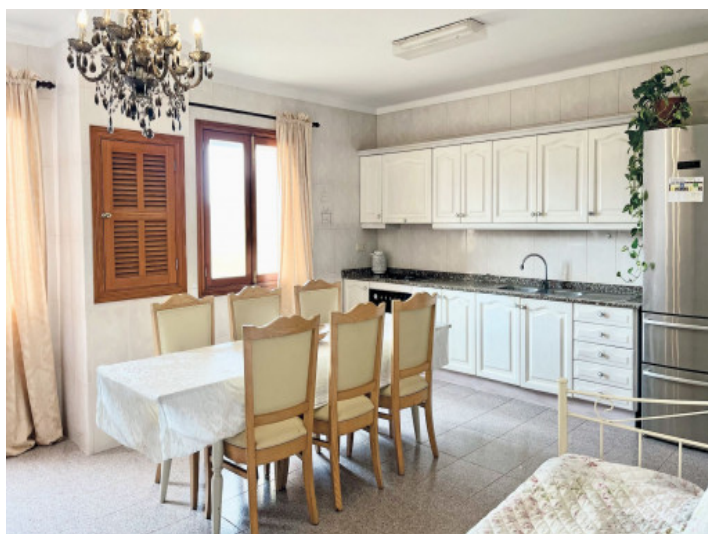
Additional live-in kitchen