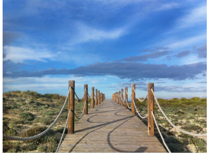
Wooden path leading to the sea