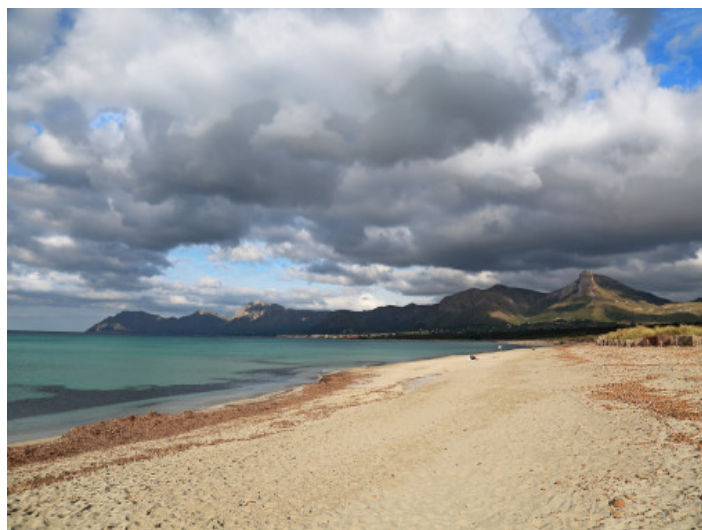
The beach nearby

All information is correct to the best of our knowledge. Errors and prior sale excepted. This prospectus is purely for information purposes. Only the notarized deed of sale is legally binding.