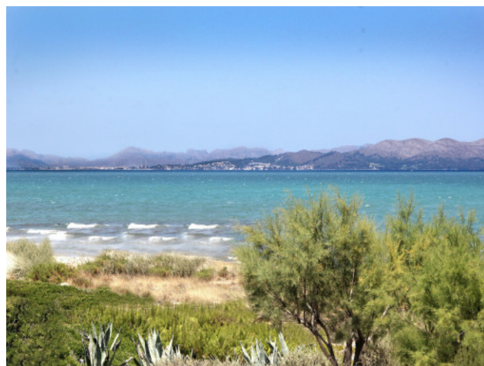
Impressive sea views from the balcony