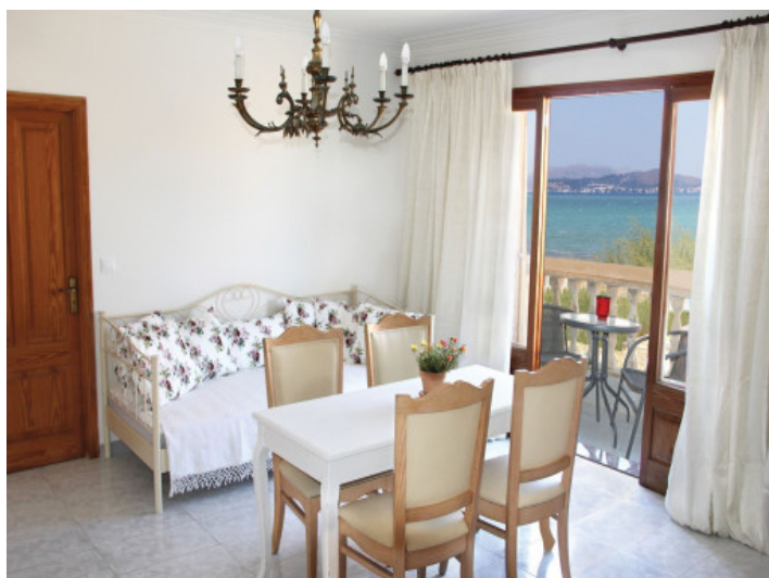
Living and dining area with sea views