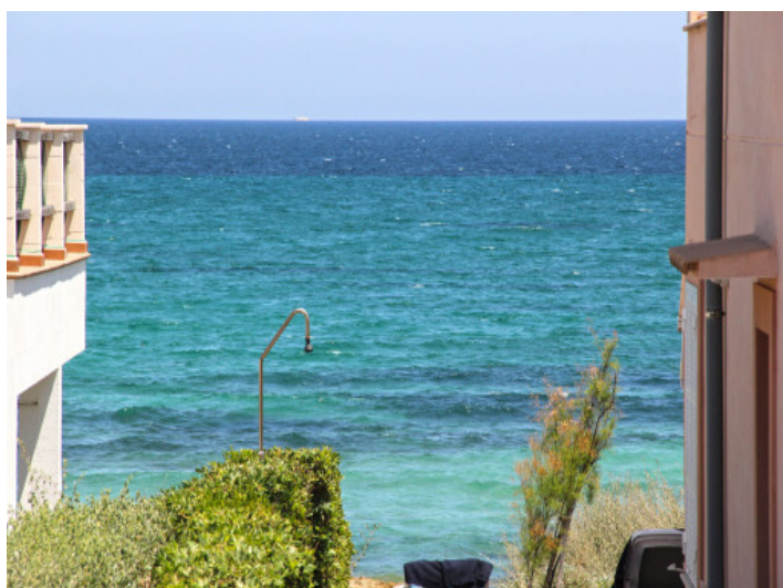
Lovely sea views