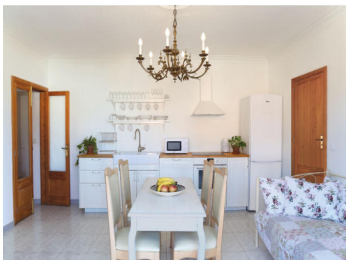
Open plan living area