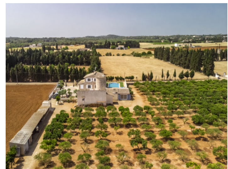
Exterior view with plot