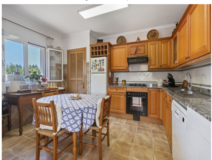
Large kitchen with dining area