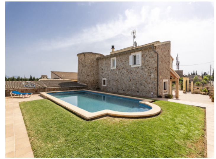
Pool area and view of the finca