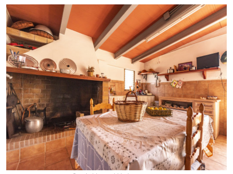
Rustic bbq and kitchen terrace