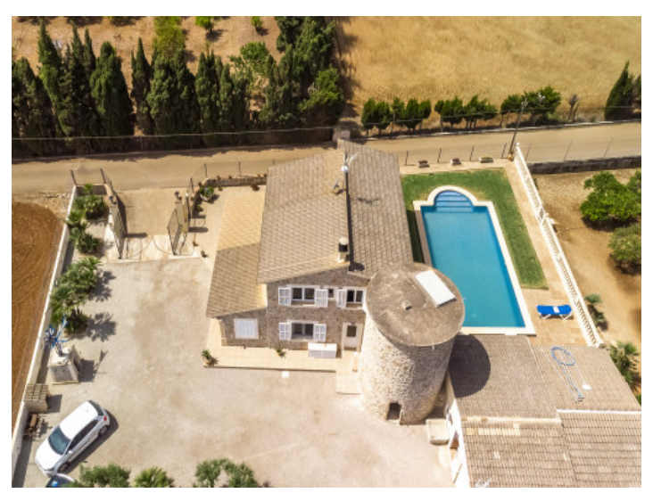
View of the property from above