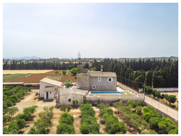
Exterior view with plot