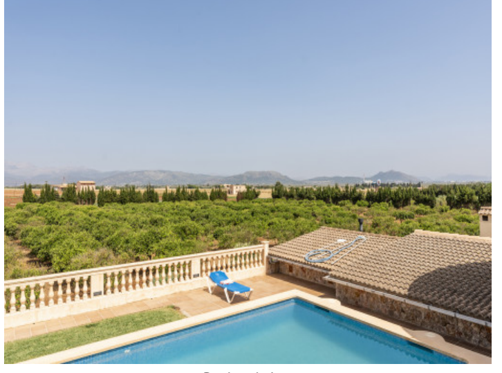
Pool and view