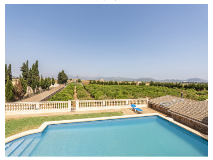
Pool with sweeping views over the landscape