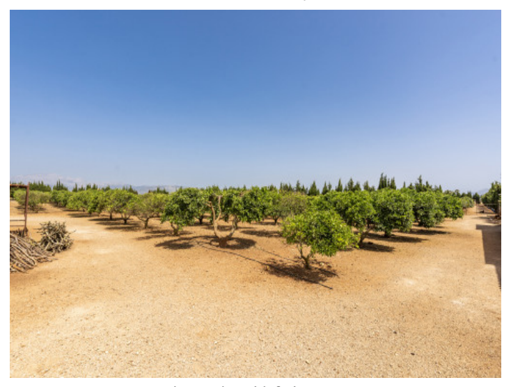
Large plot with fruit trees