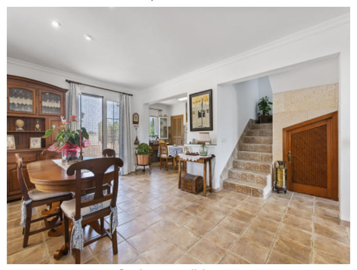
Spacious, open dining area