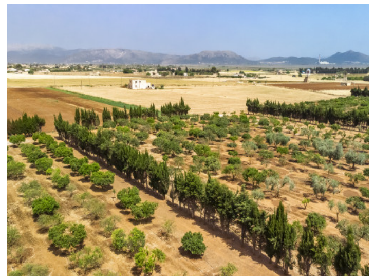
View over the plot