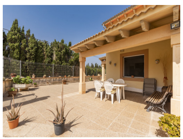
Partly covered terrace