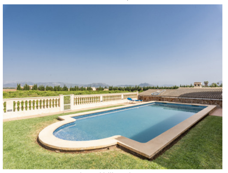
Large, idyllic pool area