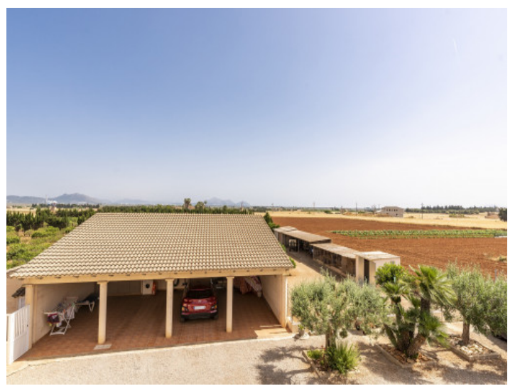
View to the carport