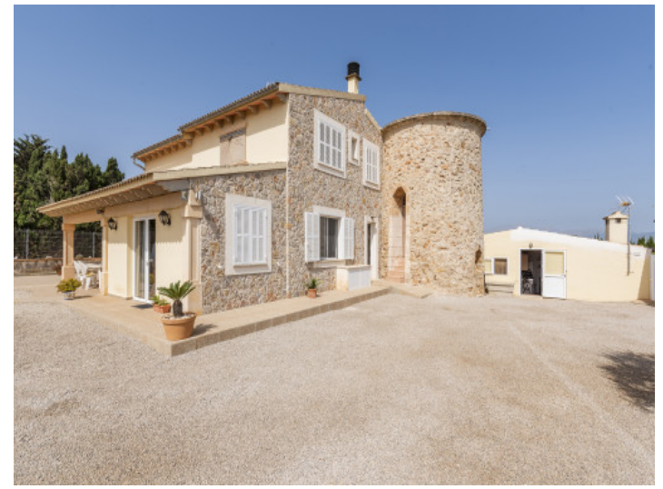
View of the finca with tower