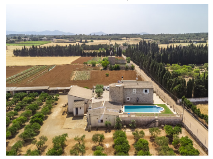
Exterior view with plot