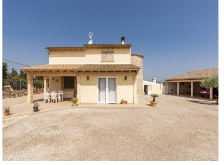
Exterior view, outdoor area and carport