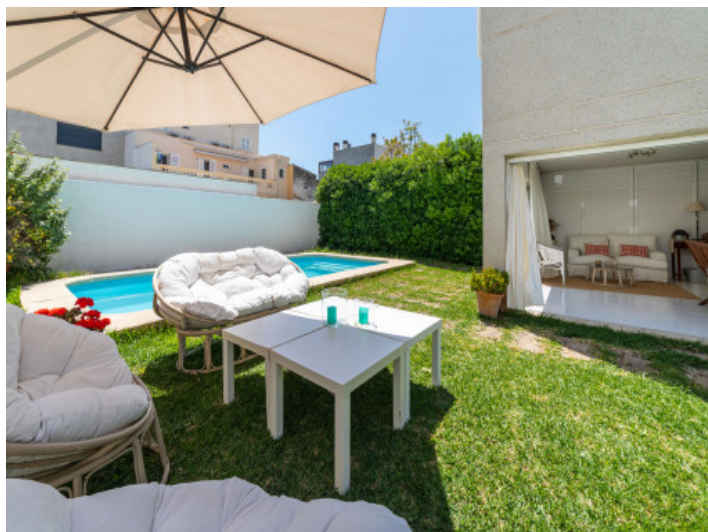
Beautiful private garden with pool