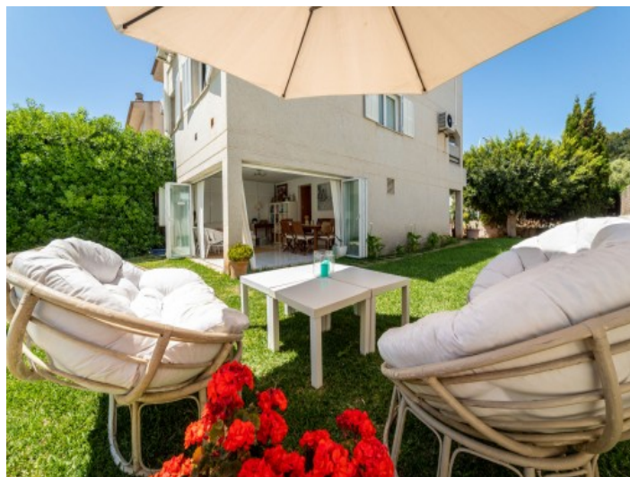
Tranquil garden with lounge area