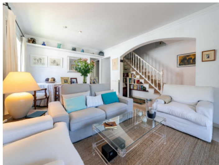
Beautiful living and dining area

All information is correct to the best of our knowledge. Errors and prior sale excepted. This prospectus is purely for information purposes. Only the notarized deed of sale is legally binding.