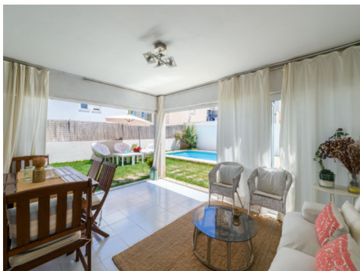
Ground floor with open access to the garden