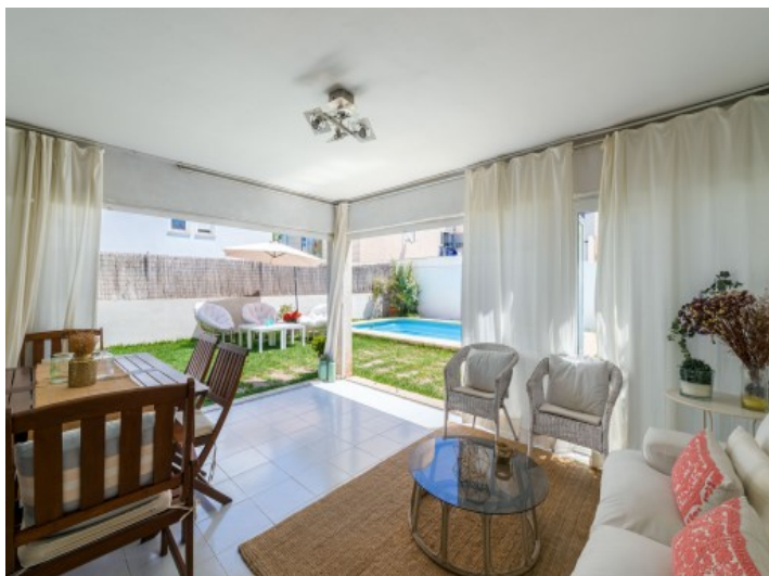
Ground floor with open access to the garden