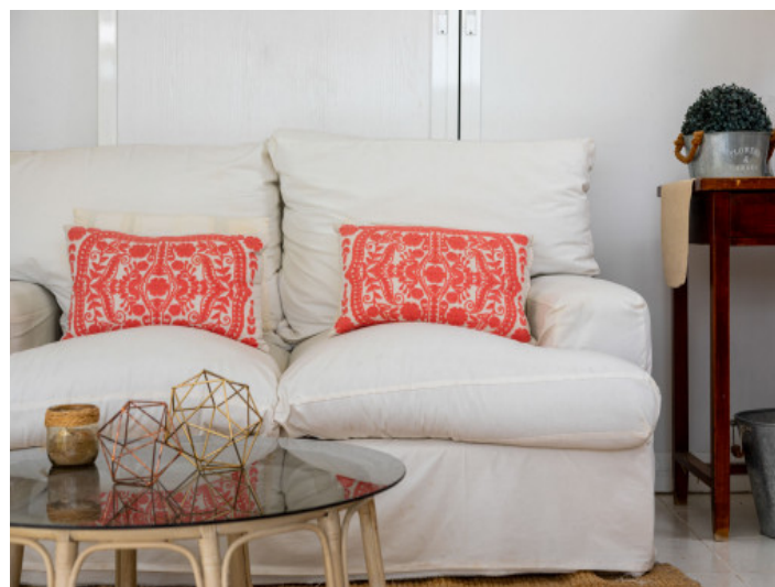
Comfortable lounge area