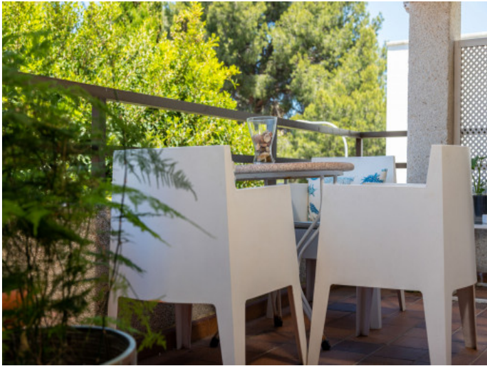
Balcony with seating area