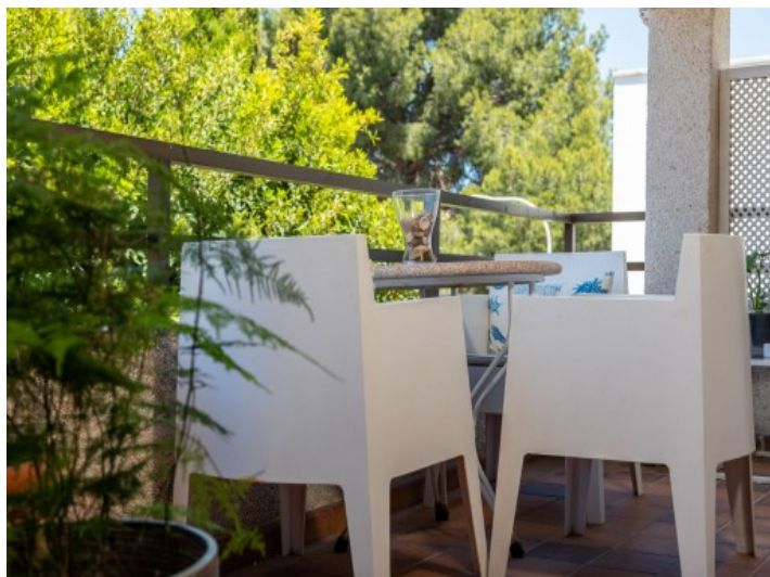
Balcony with seating area