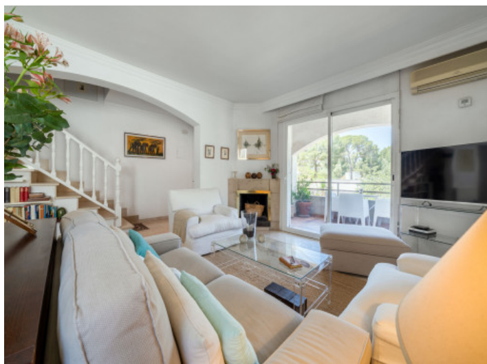
Main living area on the first floor