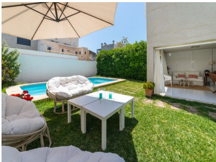
Beautiful private garden with pool