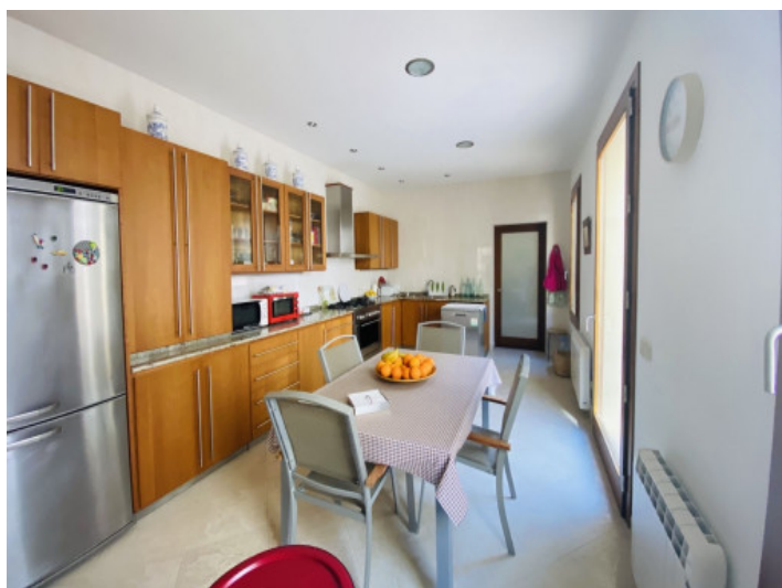
Kitchen with dining area