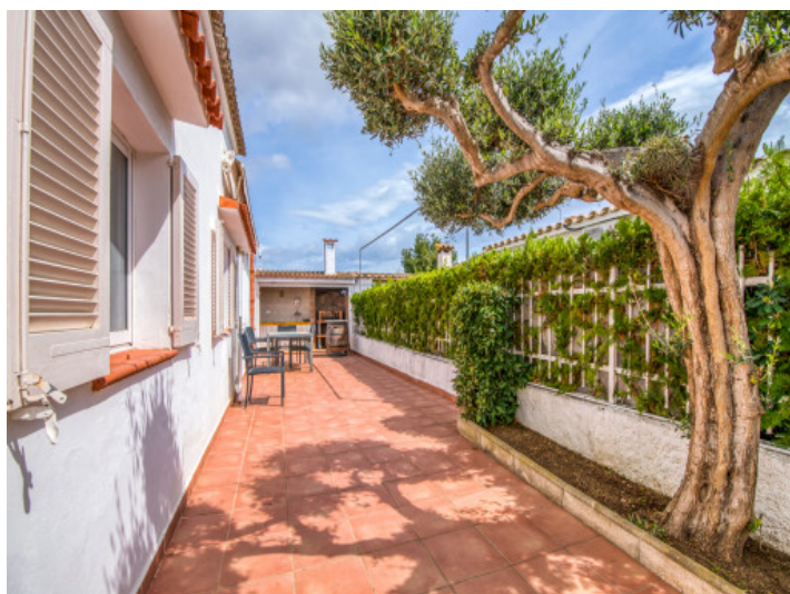
Private terrace on the side