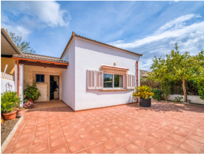
Access to the house with large front terrace