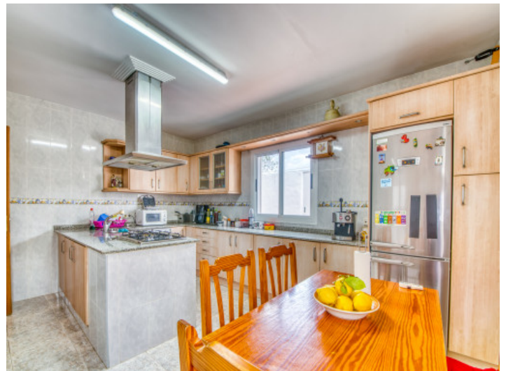
Spacious kitchen with dining area