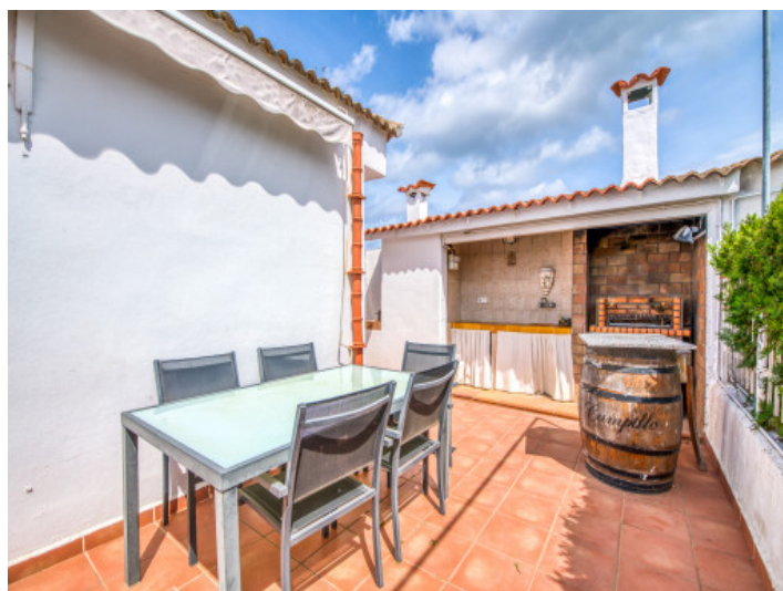
Outdoor dining and bbq area