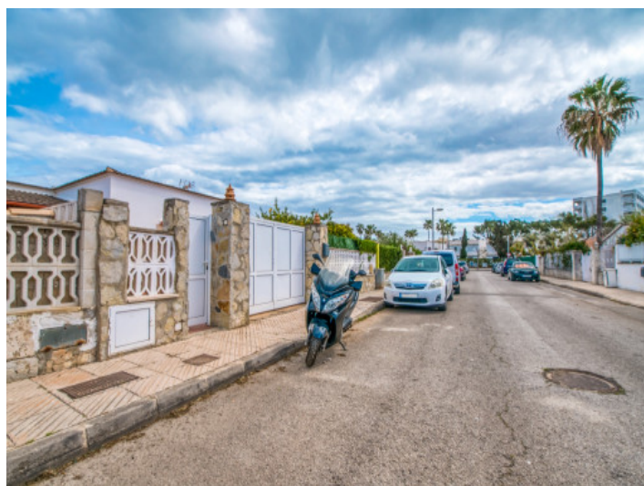
View of the street