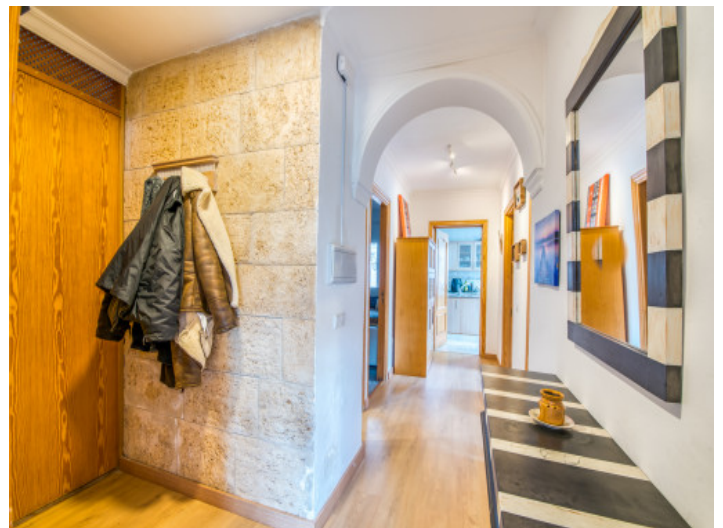
Friendly entrance area

All information is correct to the best of our knowledge. Errors and prior sale excepted. This prospectus is purely for information purposes. Only the notarized deed of sale is legally binding.