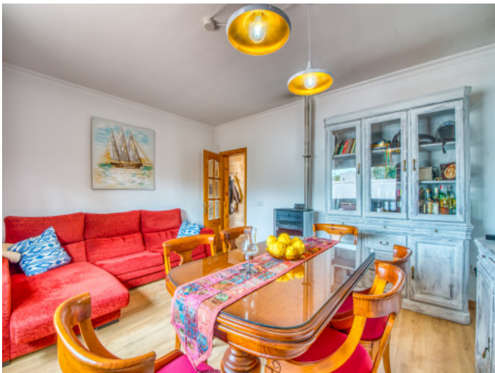
Comfortable living and dining area