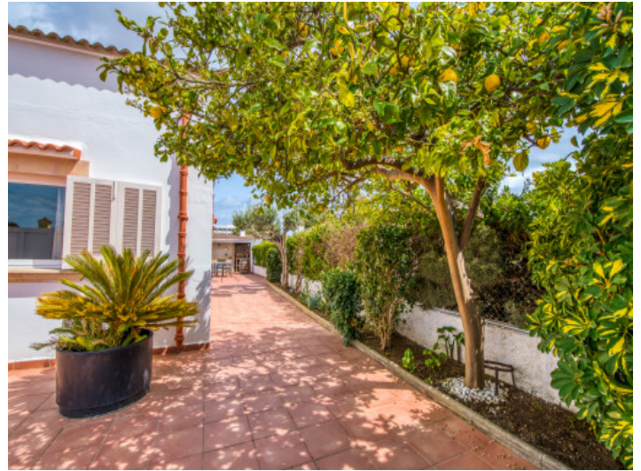
Beautifully planted terrace