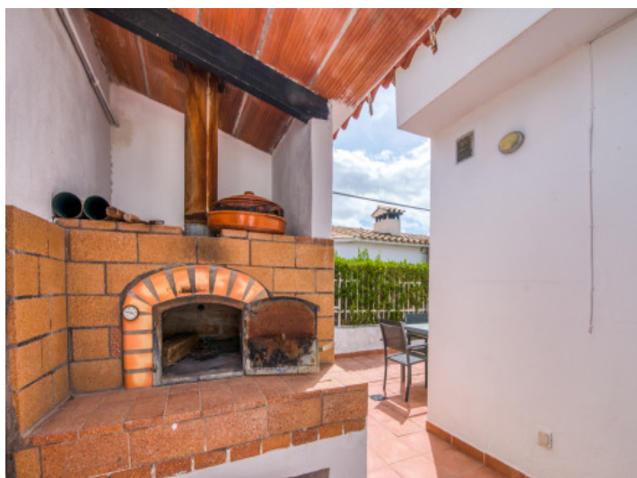
Wood-fired oven on the terrace