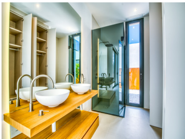
Modern en suite bathroom