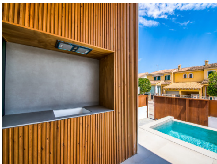
Modern outdoor kitchen