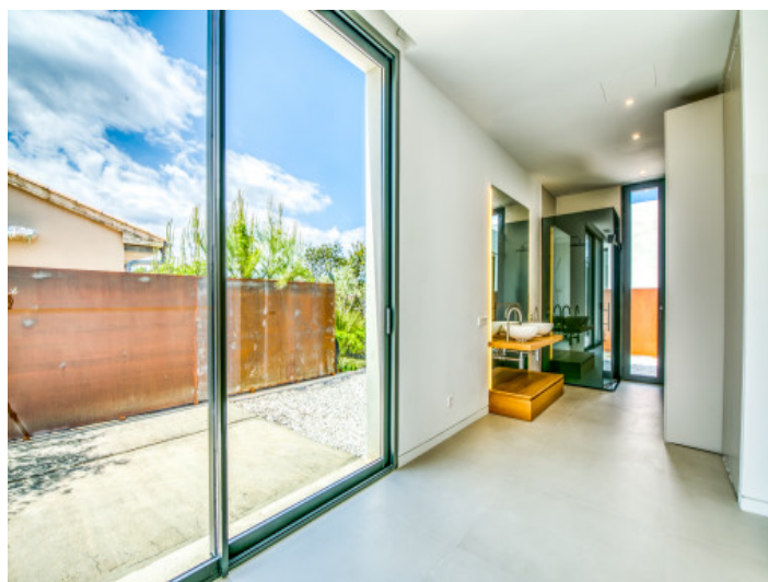
Bedroom with open bathroom