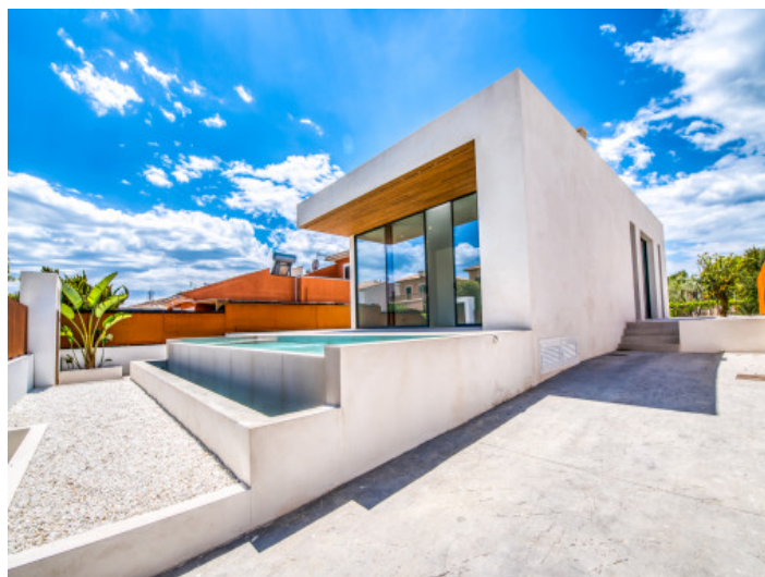
Access to the plot and exterior view

All information is correct to the best of our knowledge. Errors and prior sale excepted. This prospectus is purely for information purposes. Only the notarized deed of sale is legally binding.