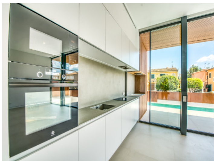
Modern, open kitchen