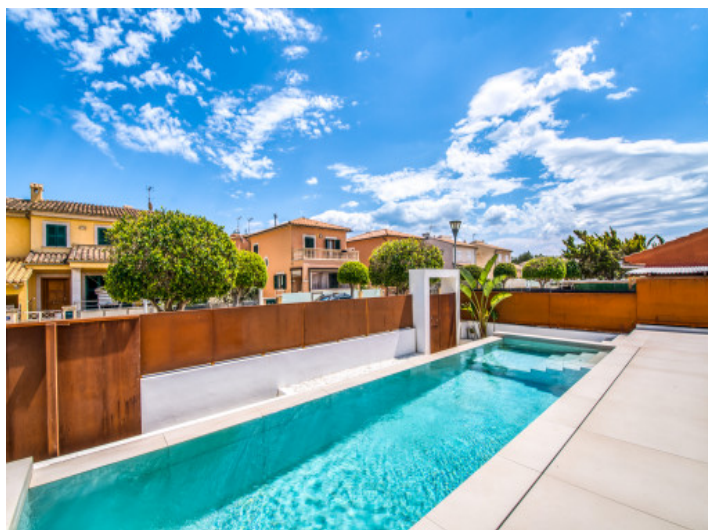
Elegant, sunny pool