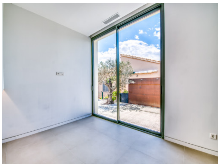
One of 3 bedrooms