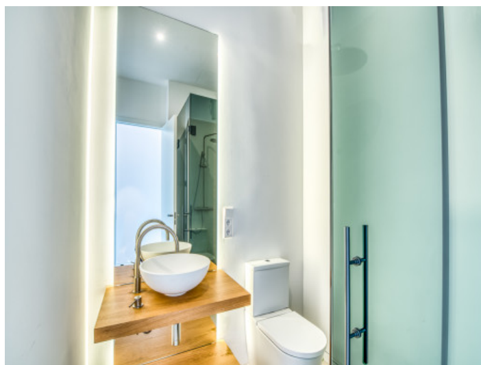
One of 2 bathrooms