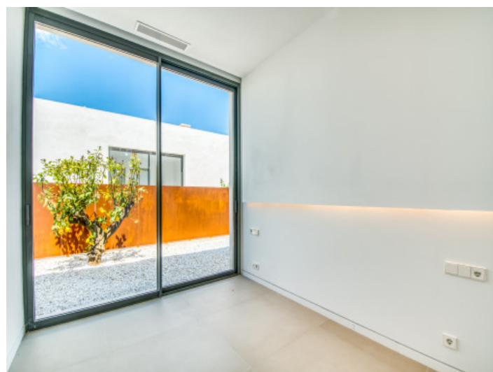
Bright bedroom with access to the outside

All information is correct to the best of our knowledge. Errors and prior sale excepted. This prospectus is purely for information purposes. Only the notarized deed of sale is legally binding.