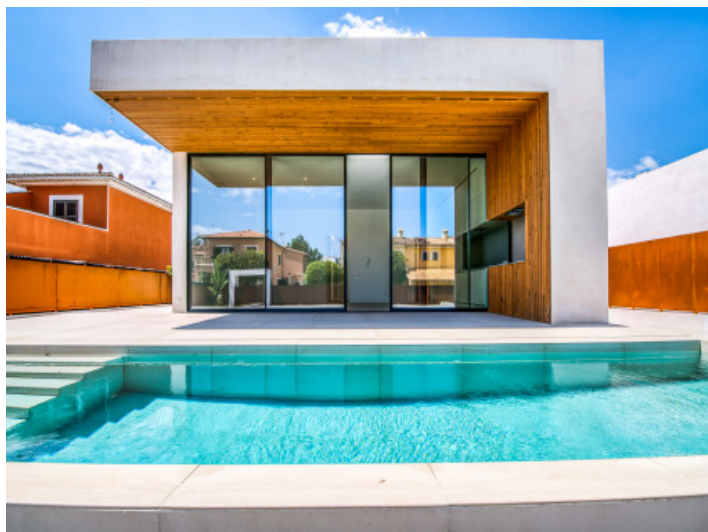
Modern pool and terrace area