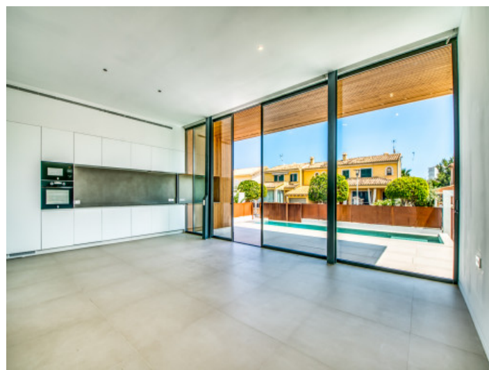
Living area with panorama windows