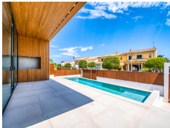
Elegant terrace with pool views