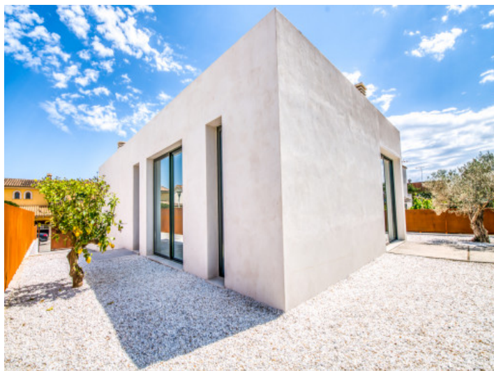
Rear view and outdoor area

All information is correct to the best of our knowledge. Errors and prior sale excepted. This prospectus is purely for information purposes. Only the notarized deed of sale is legally binding.