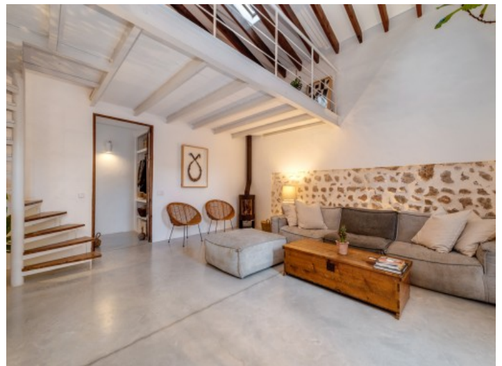
Living area with sandstone-wall

All information is correct to the best of our knowledge. Errors and prior sale excepted. This prospectus is purely for information purposes. Only the notarized deed of sale is legally binding.