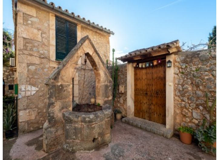
Authentic entrance to the house

All information is correct to the best of our knowledge. Errors and prior sale excepted. This prospectus is purely for information purposes. Only the notarized deed of sale is legally binding.