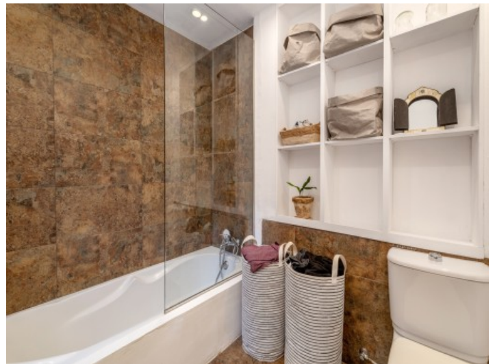
Main bathroom with bath tub