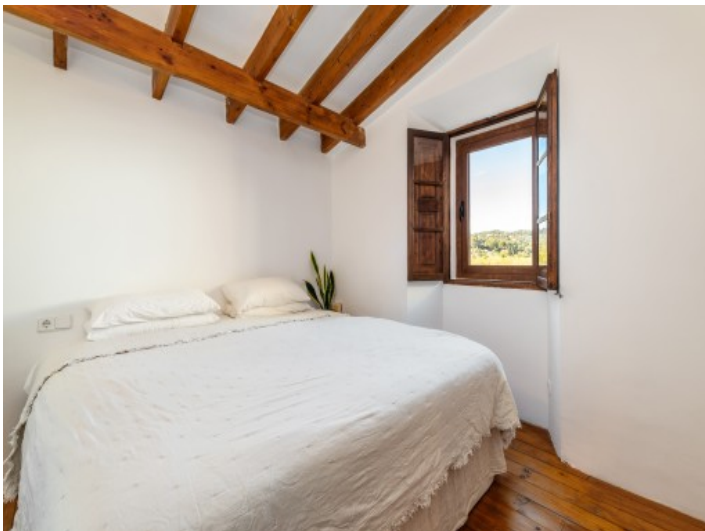
Cozy double bedroom