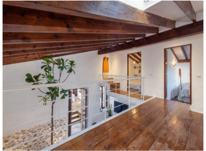
Open gallery with wooden ceiling beams