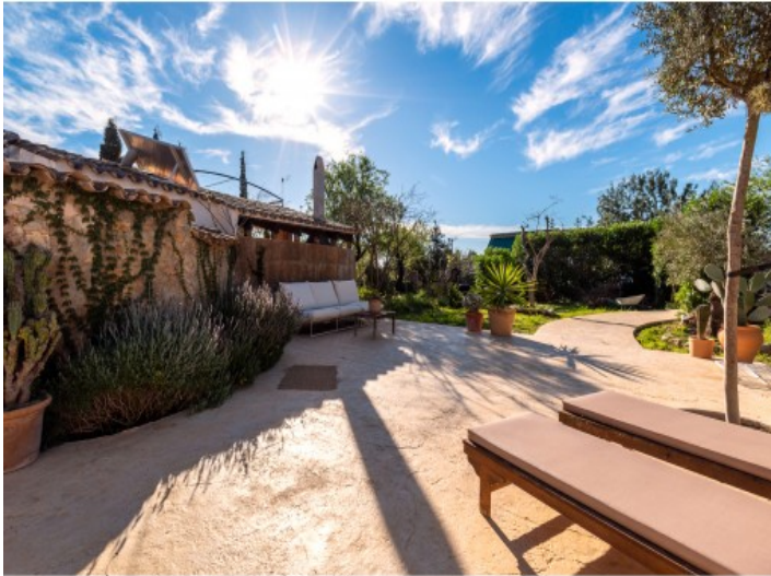
Sun terrace and garden