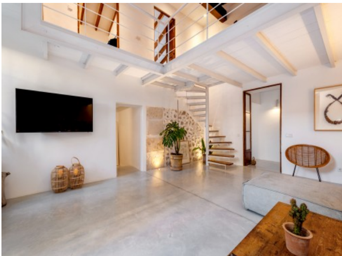
Tastefully designed living area