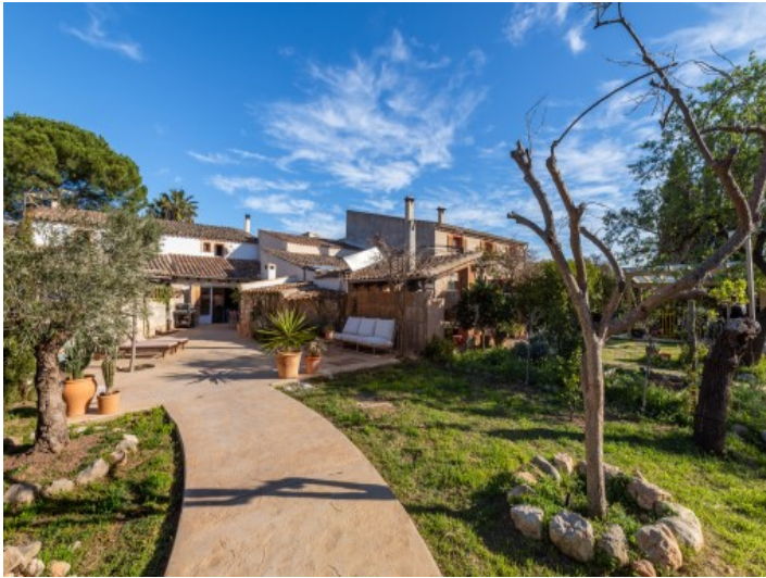
Beautifully laid-out garden