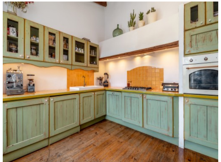
Authentic rustic kitchen