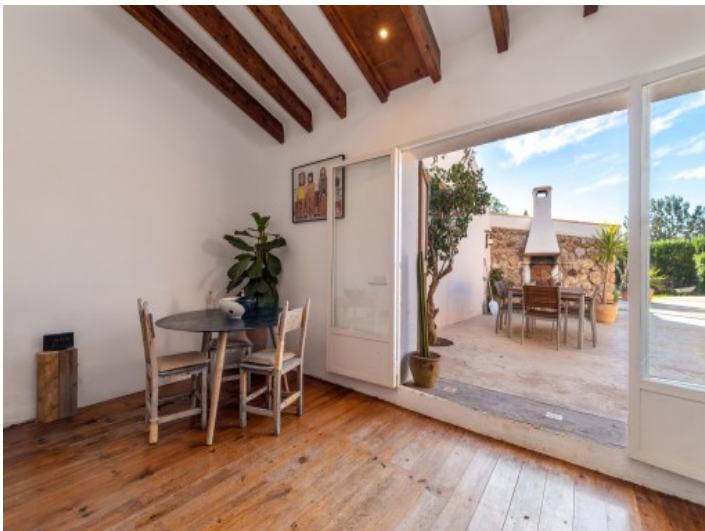
Access to the outdoor area