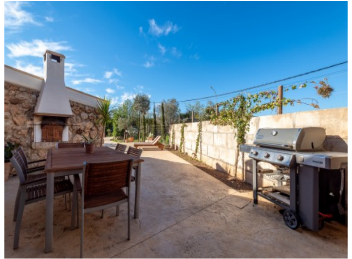
Lovely bbq and dining area