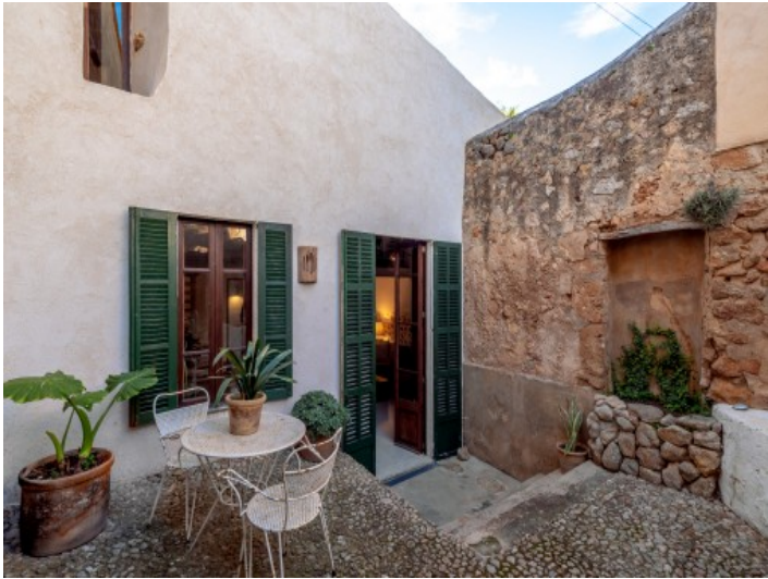
Wonderful patio of the living area