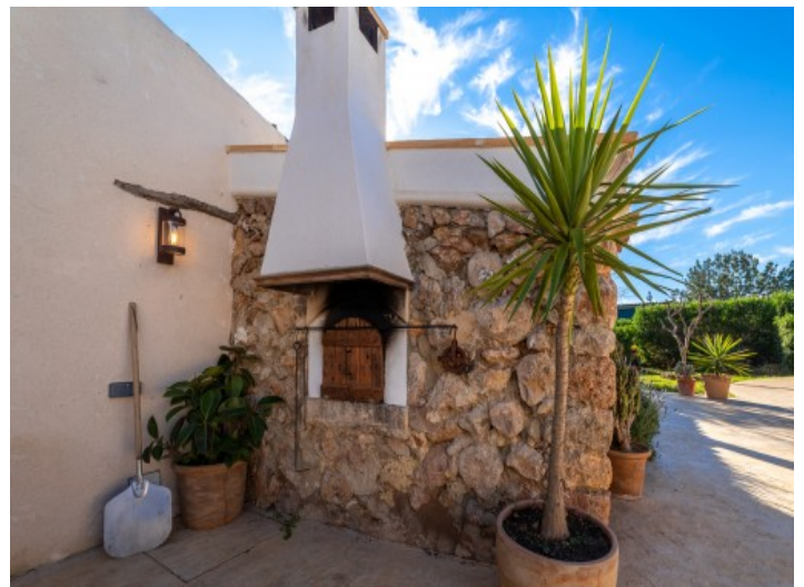
Baking oven in the garden

All information is correct to the best of our knowledge. Errors and prior sale excepted. This prospectus is purely for information purposes. Only the notarized deed of sale is legally binding.