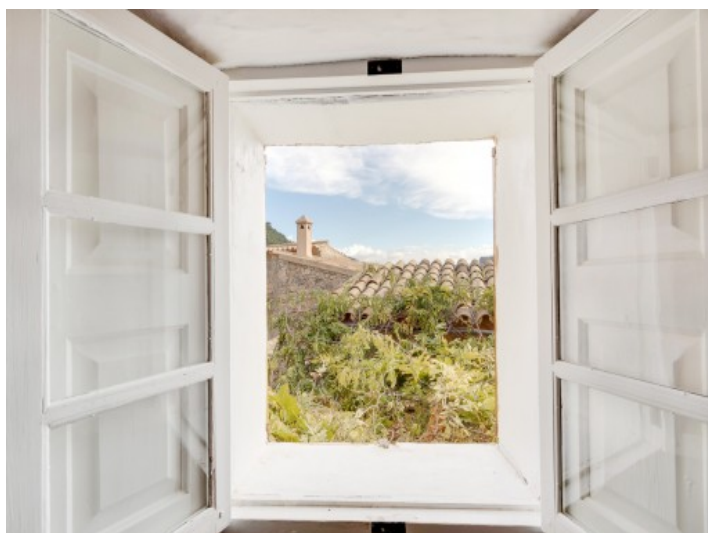
View from the living area