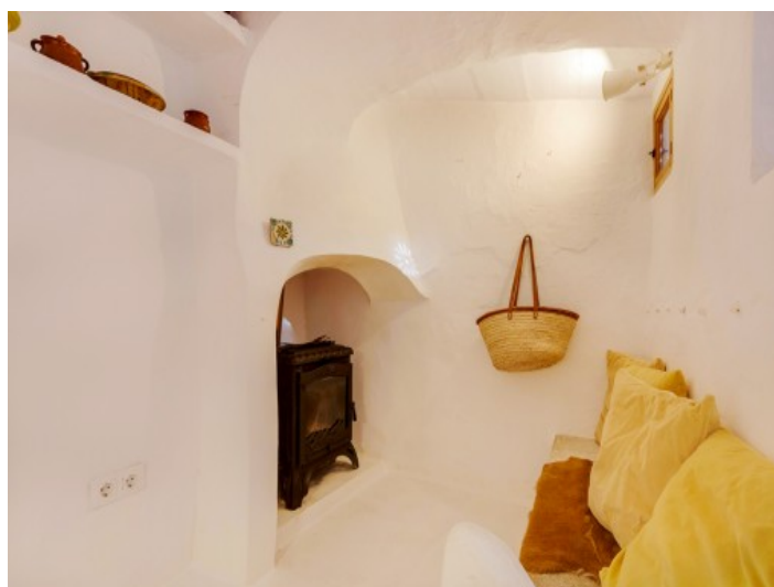
Cosy fireplace corner

All information is correct to the best of our knowledge. Errors and prior sale excepted. This prospectus is purely for information purposes. Only the notarized deed of sale is legally binding.