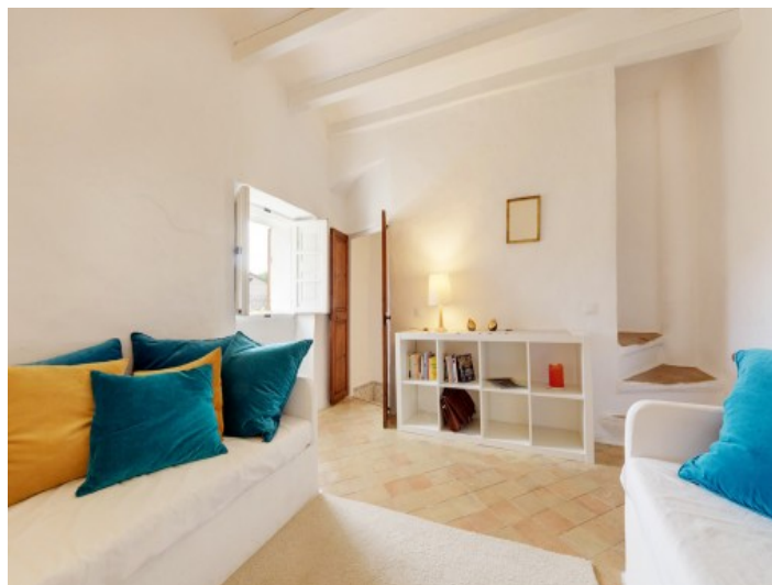
Access to the second floor