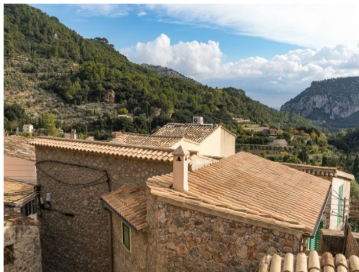
Views over the town

All information is correct to the best of our knowledge. Errors and prior sale excepted. This prospectus is purely for information purposes. Only the notarized deed of sale is legally binding.