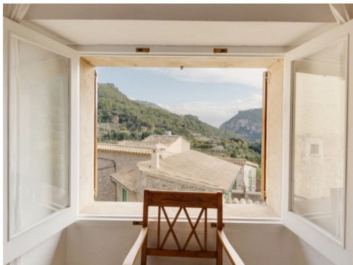
Dreamlike mountains views