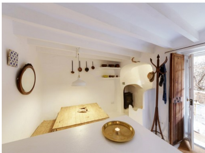
Authentic dining and kitchen area