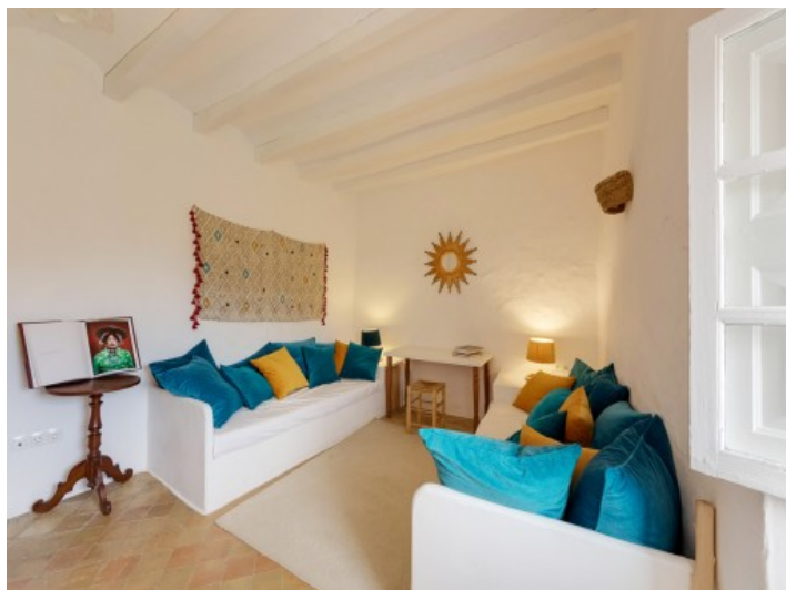
Comfortable living area on the first floor