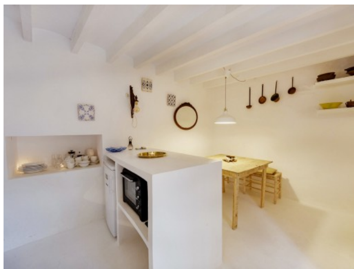
Simple, open kitchen