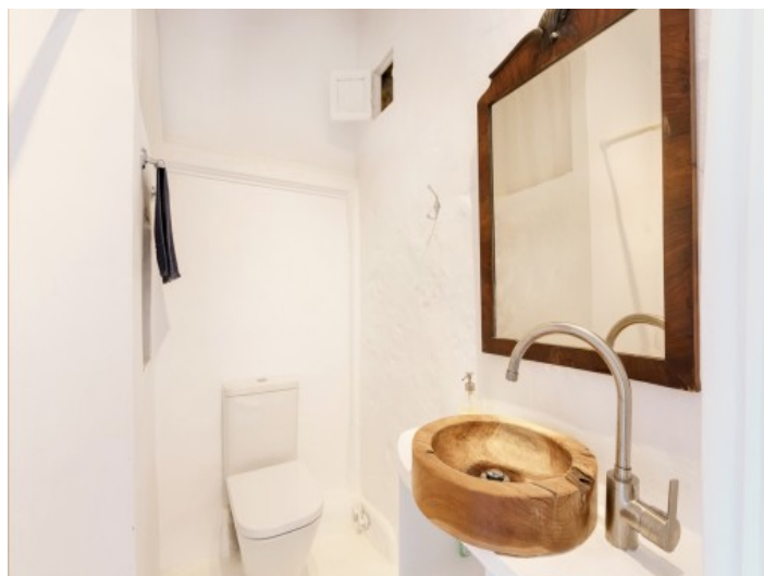
Small en suite bathroom

All information is correct to the best of our knowledge. Errors and prior sale excepted. This prospectus is purely for information purposes. Only the notarized deed of sale is legally binding.