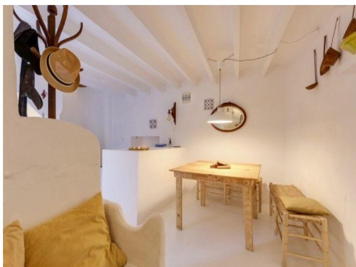
Dining area with character