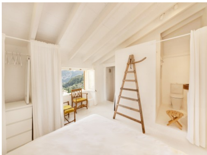
Tastefully designed bedroom