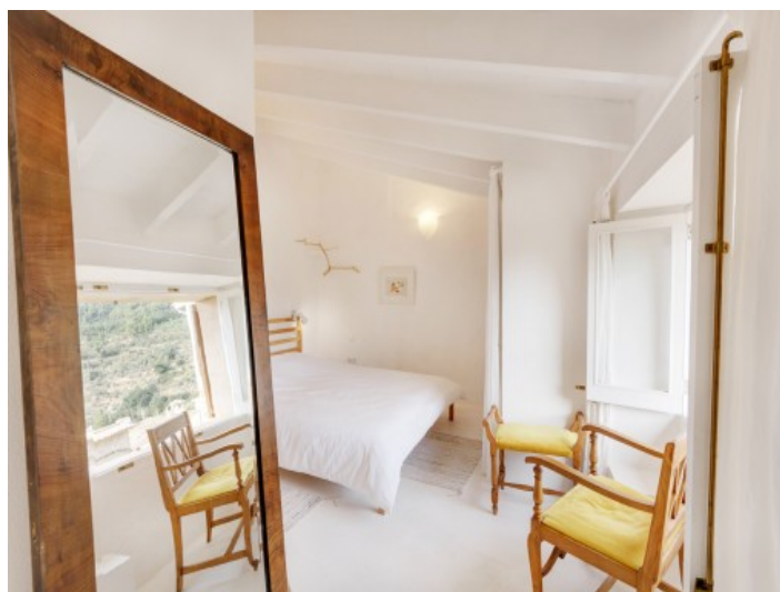
Wonderful bedroom on the upper floor