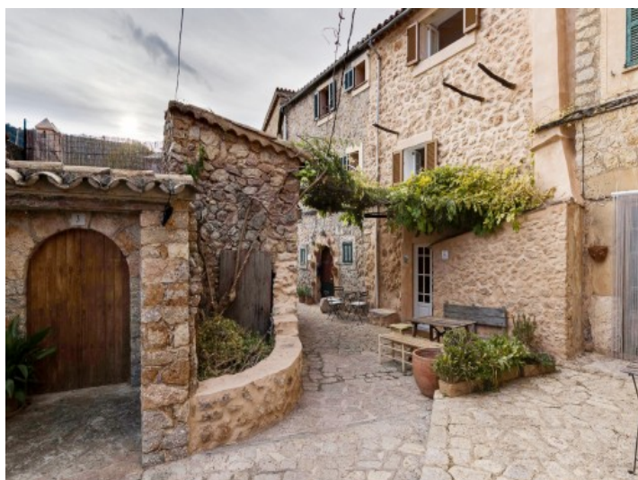
Exterior view of the stoneclad town house