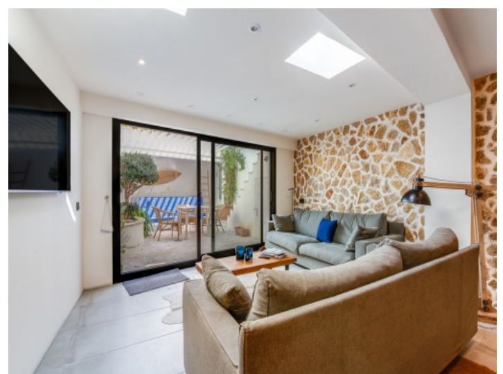
Bright living area with patio access