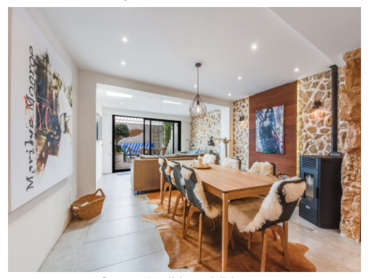
Open, modern living and dining area