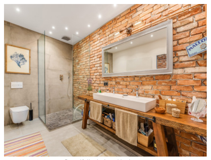
Beautifully designed bathroom