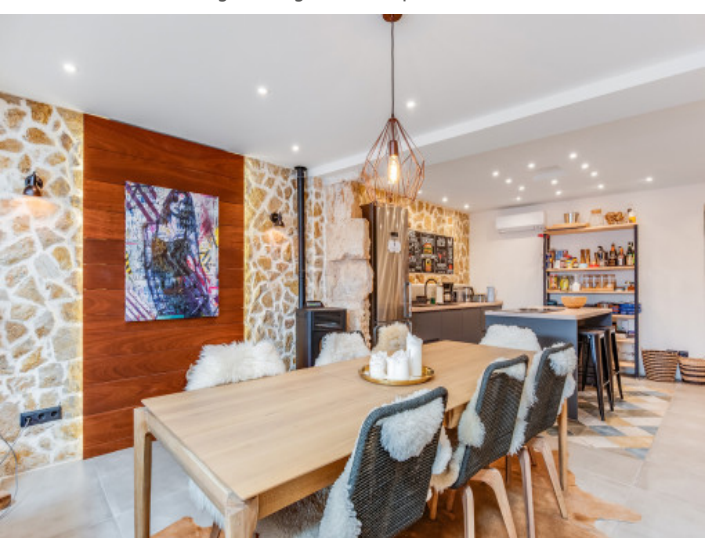
Tastefully designed dining area with stone wall