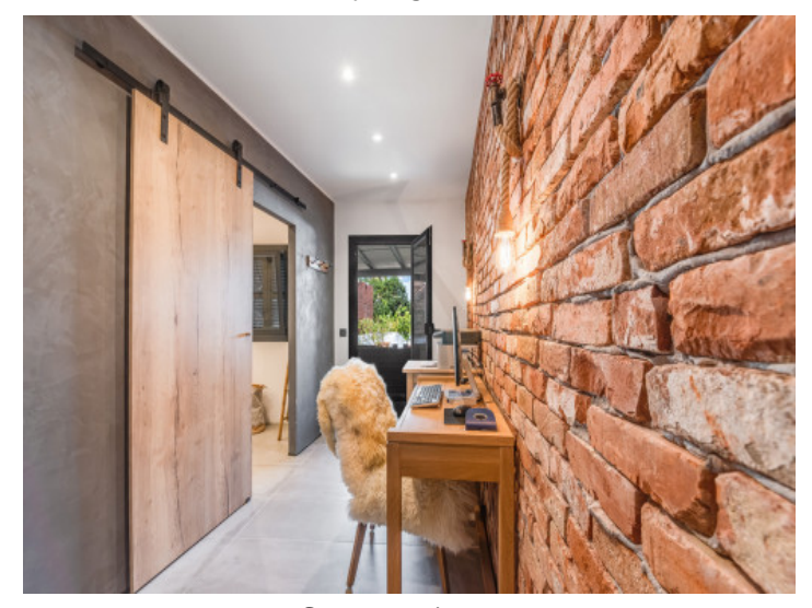
Separate study room