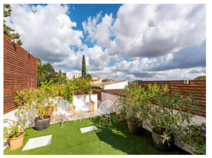
Spacious roof terrace

All information is correct to the best of our knowledge. Errors and prior sale excepted. This prospectus is purely for information purposes. Only the notarized deed of sale is legally binding.