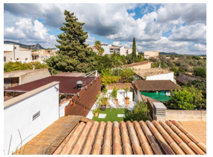
liew over the terrace and the town