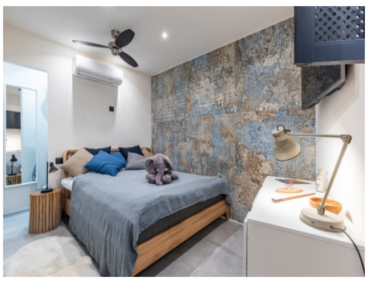
One of 2 double bedrooms