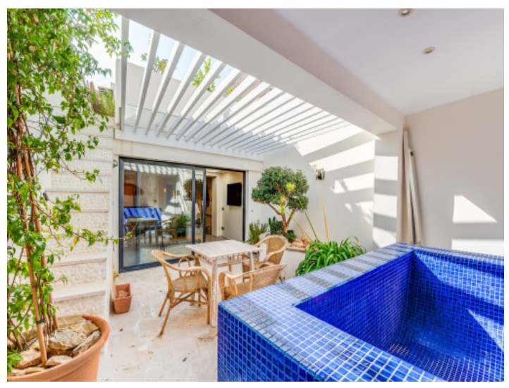
Jacuzzi with absolute privacy