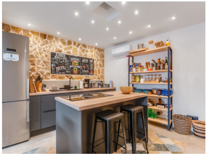
Kitchen in indutry look

All information is correct to the best of our knowledge. Errors and prior sale excepted. This prospectus is purely for information purposes. Only the notarized deed of sale is legally binding.