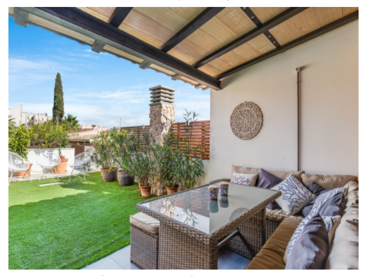
Lounge terrace on the upper terrace