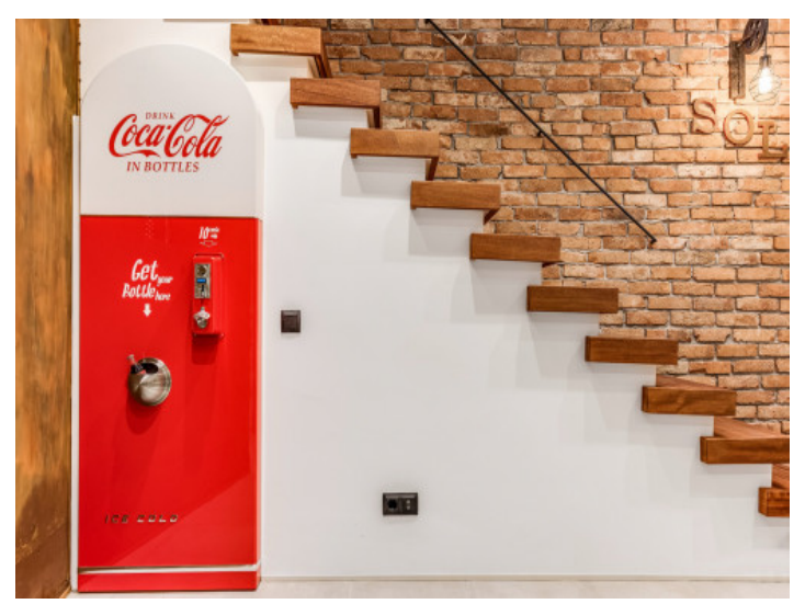
Stairs to the upper floor