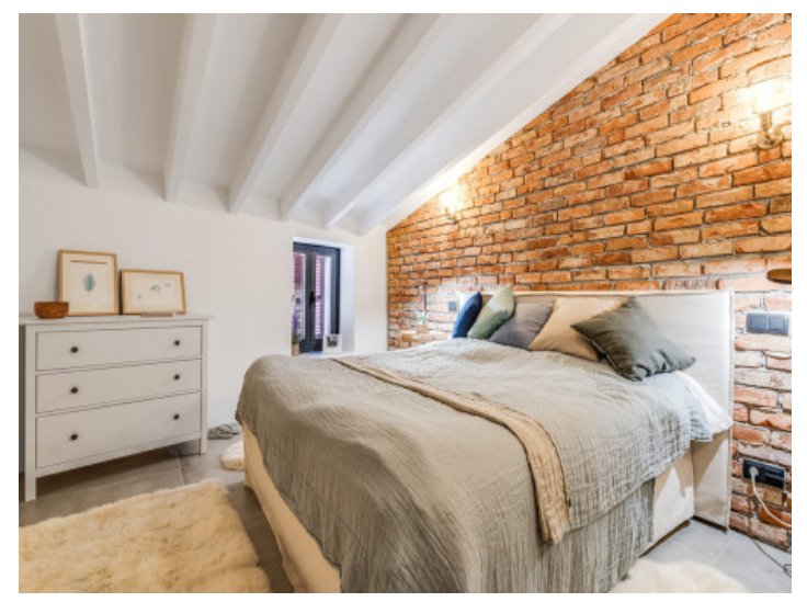
Cosy double bedroom with stone wall