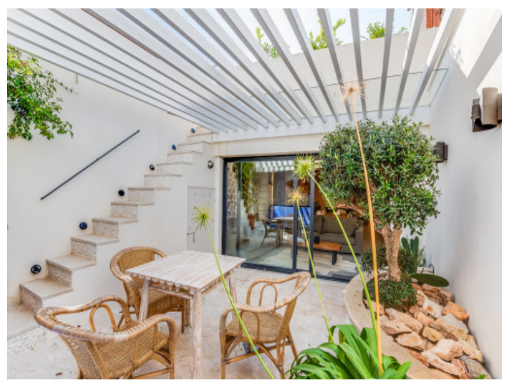
Beautiful patio with access to the roof terrace