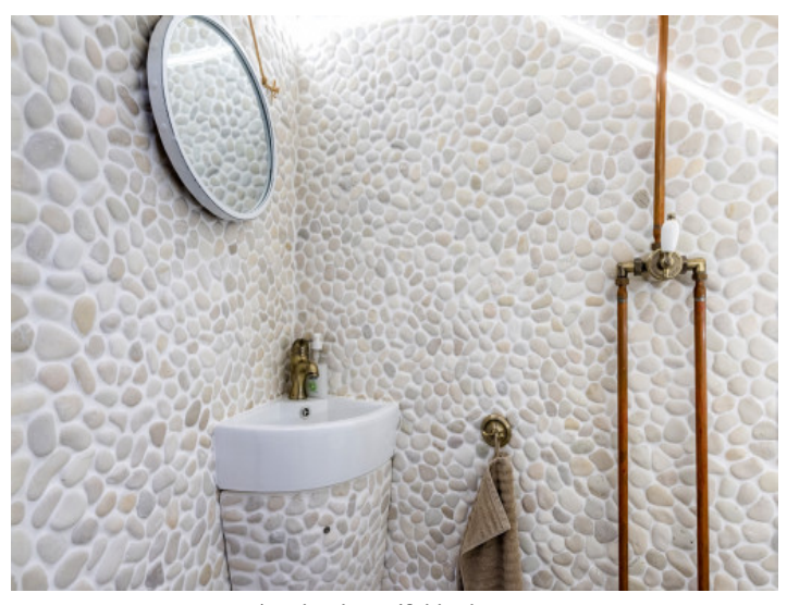
Another beautiful bathroom

All information is correct to the best of our knowledge. Errors and prior sale excepted. This prospectus is purely for information purposes. Only the notarized deed of sale is legally binding.