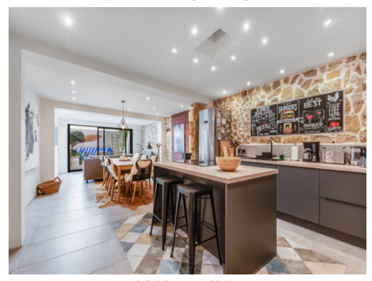
Adjoining, open kitche