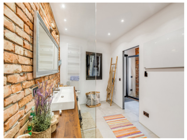
Aletrnative bathroom view