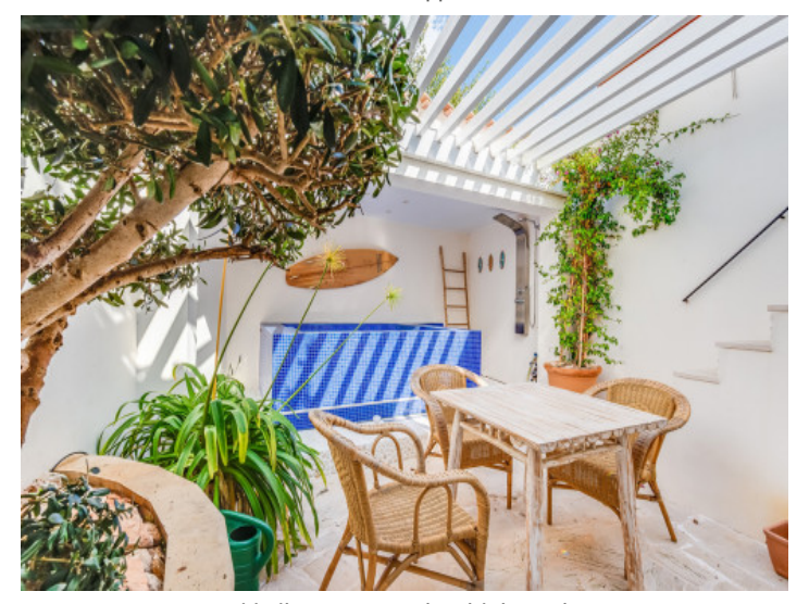
Mediterranean patio with jacuzzi