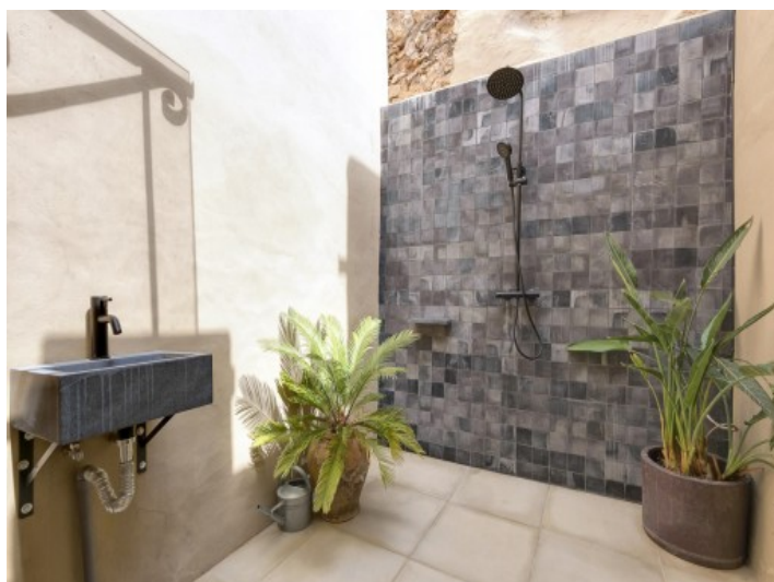
Beautiful outdoor bathroom