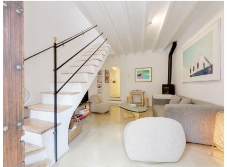
Beautifully renovated living area