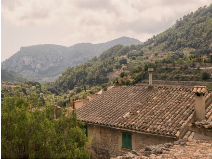
Beautiful mountain views