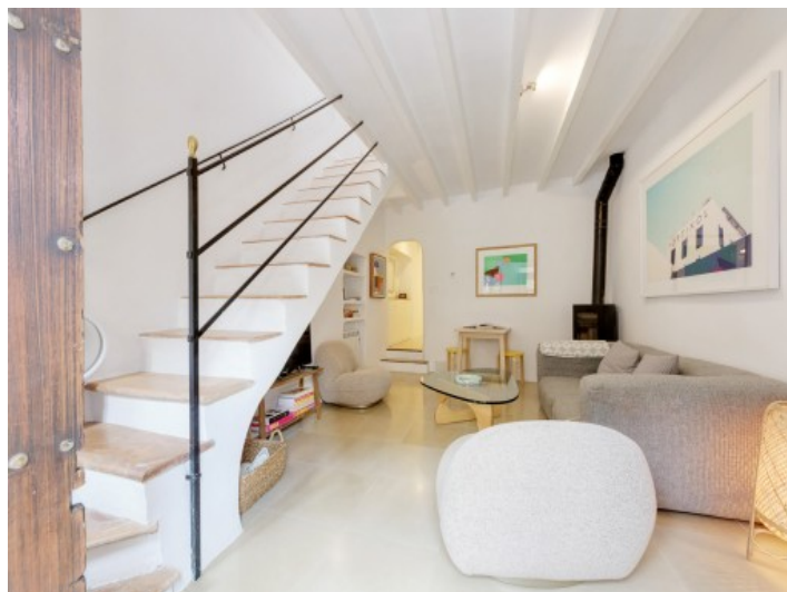
Beautifully renovated living area