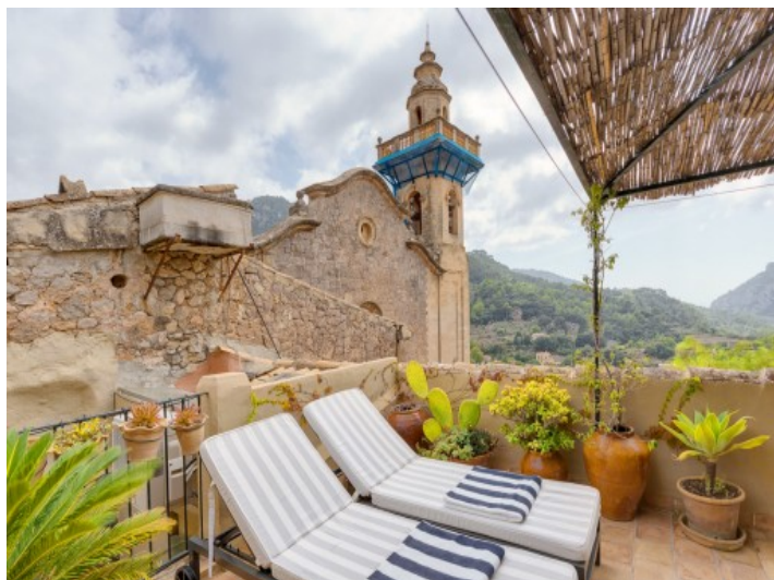
Terrace with views of the church