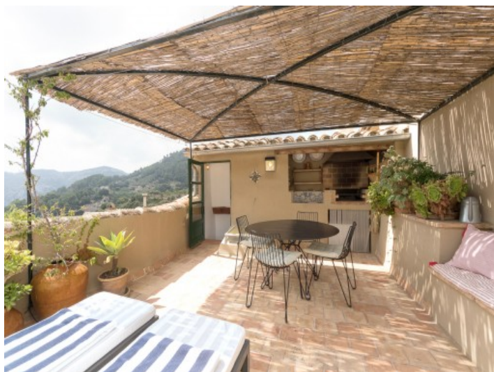
Terrace with bbq area