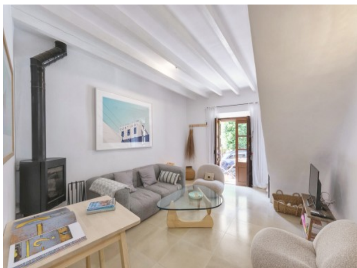
View to the entrance