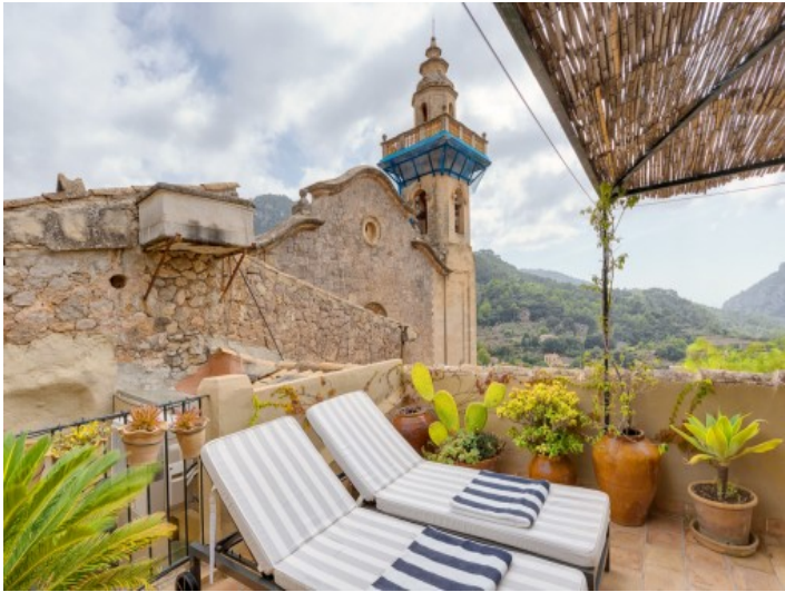
Terrace with views of the church