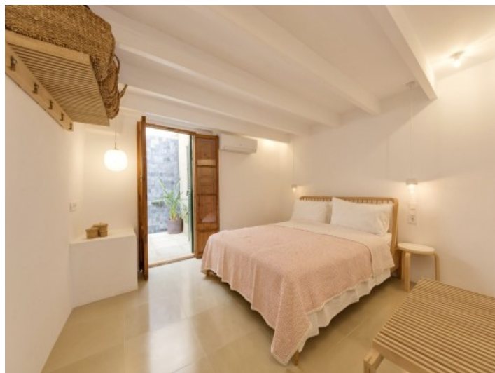
Bedroom with outdoor bathroom