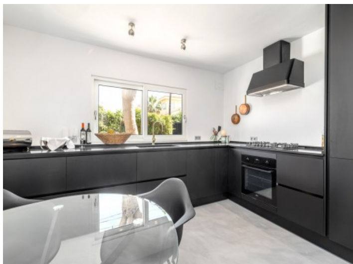
Modern kitchen in black