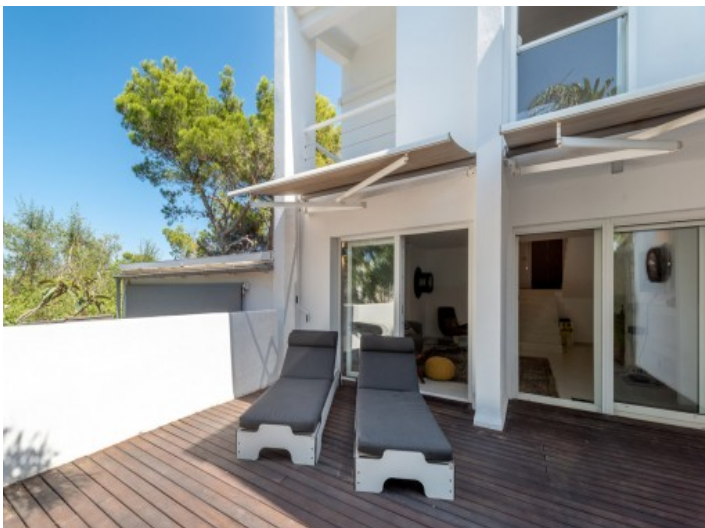
Terrace with sun loungers