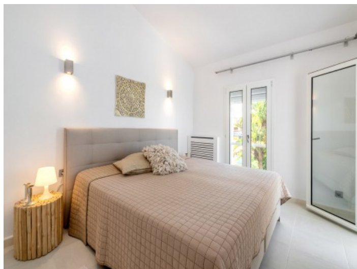
Large double bedroom

All information is correct to the best of our knowledge. Errors and prior sale excepted. This prospectus is purely for information purposes. Only the notarized deed of sale is legally binding.