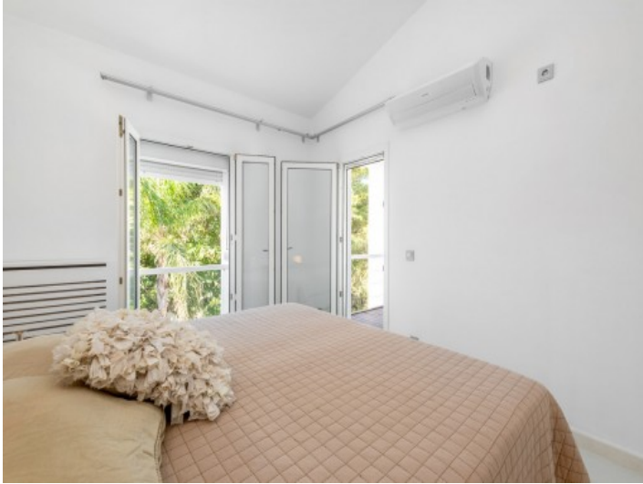
Large double bedroom