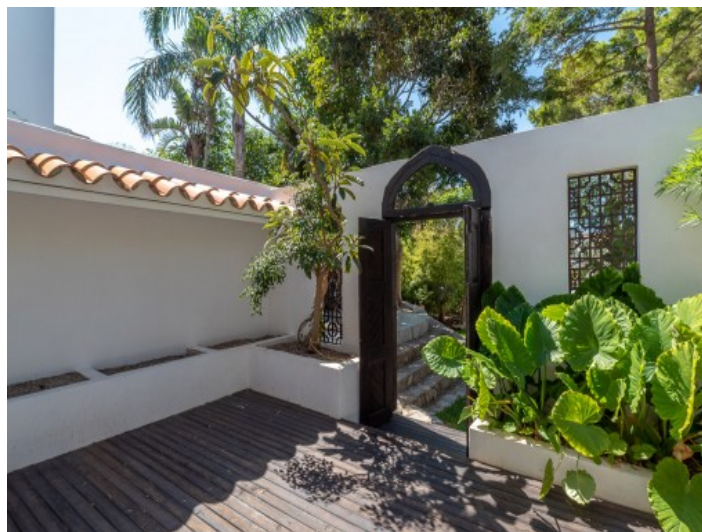
Access to the garden

All information is correct to the best of our knowledge. Errors and prior sale excepted. This prospectus is purely for information purposes. Only the notarized deed of sale is legally binding.