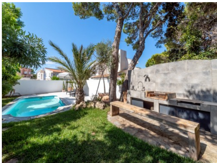
Fantastic outdoor kitchen and pool