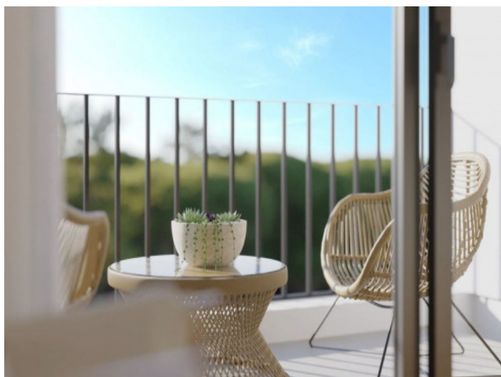
View to the balcony