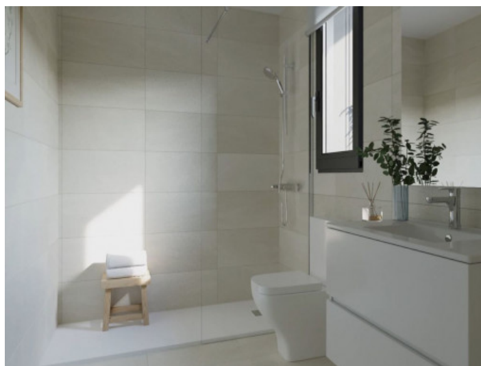
Elegant bathroom with walk-in shower