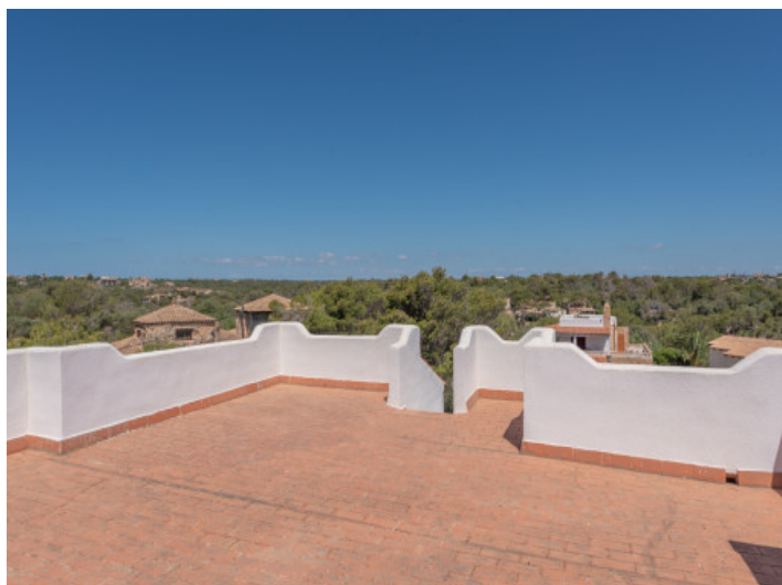
Large roof terrace with sweeping views