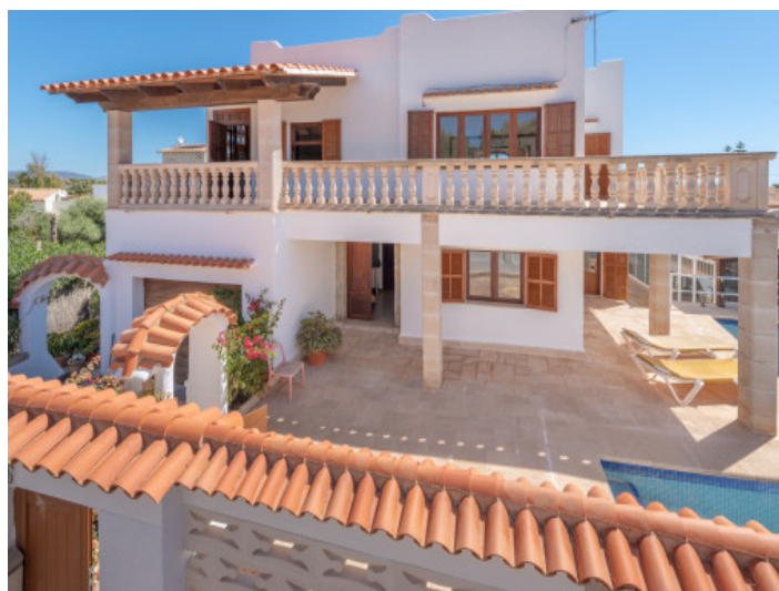
Front view and entrance to the house