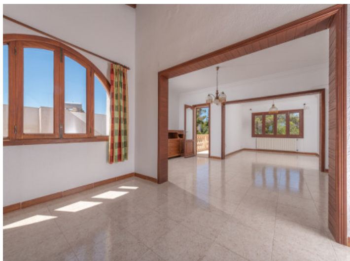
Large living and dining area