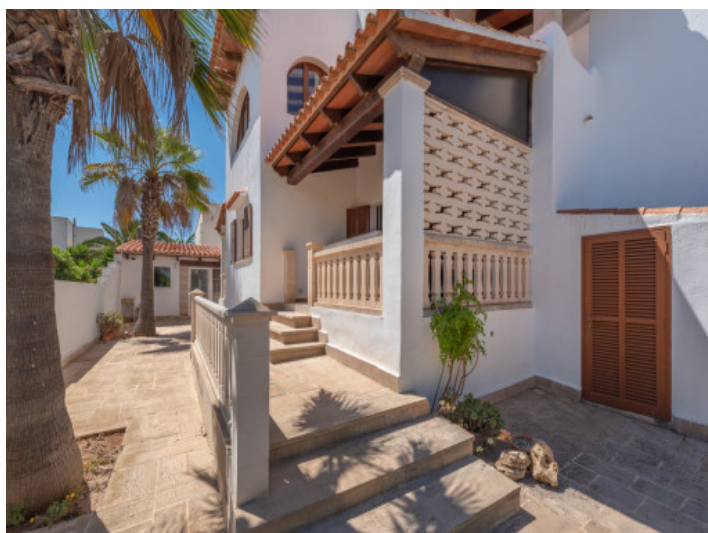
Outdoor area and terraces