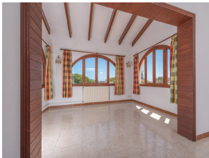
Lightflooded living and dining area

All information is correct to the best of our knowledge. Errors and prior sale excepted. This prospectus is purely for information purposes. Only the notarized deed of sale is legally binding.