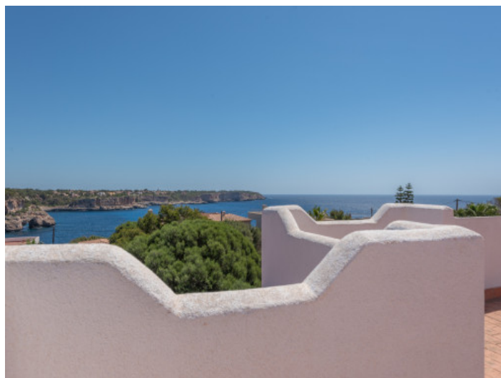
Beautiful sea views

All information is correct to the best of our knowledge. Errors and prior sale excepted. This prospectus is purely for information purposes. Only the notarized deed of sale is legally binding.