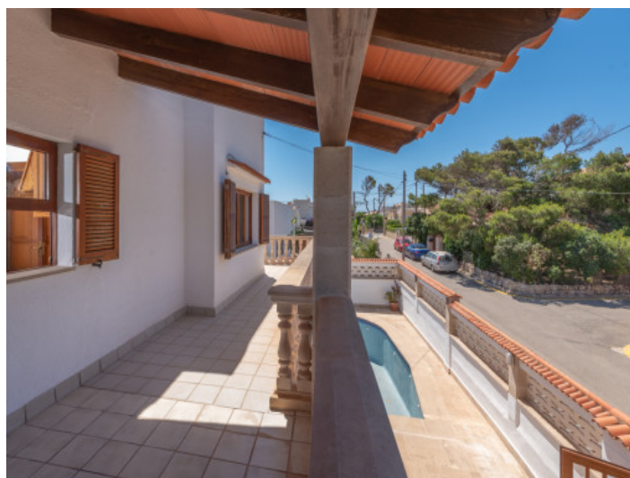
Covered balcony on the upper floor