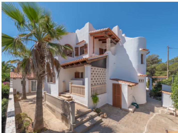
Exterior view of the large chalet