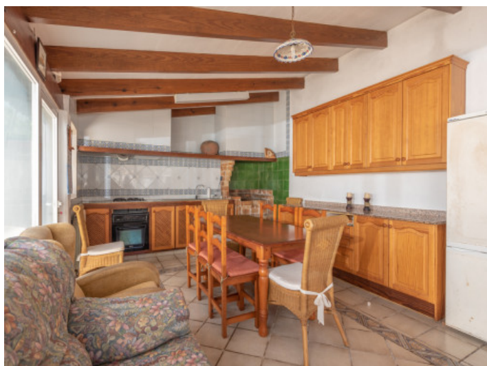
Summer house with kitchen next to the pool