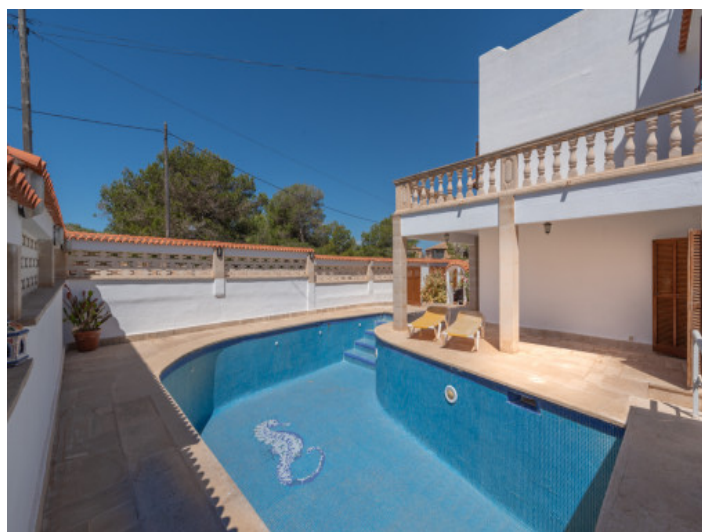
Private pool area