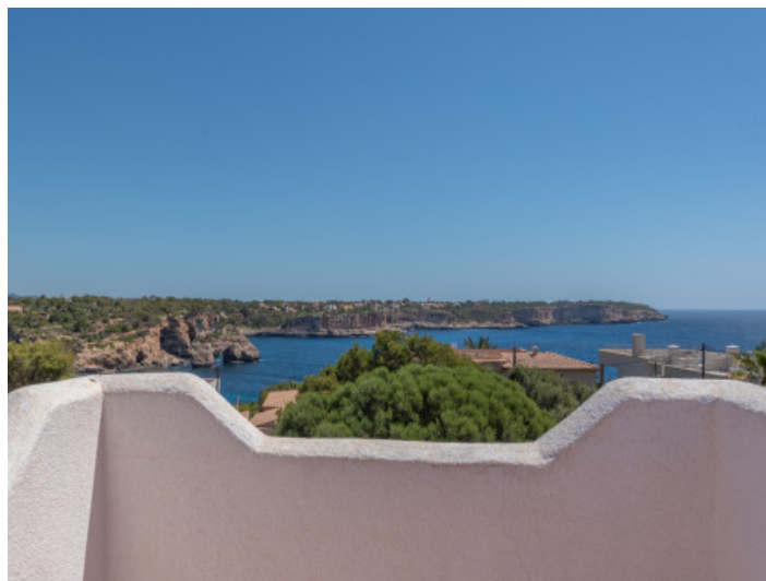
Wonderful sea views from the roof