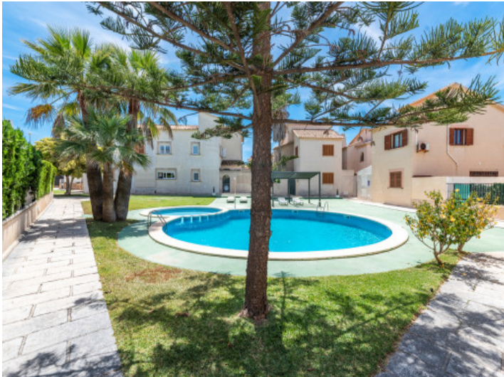
Inviting community pool