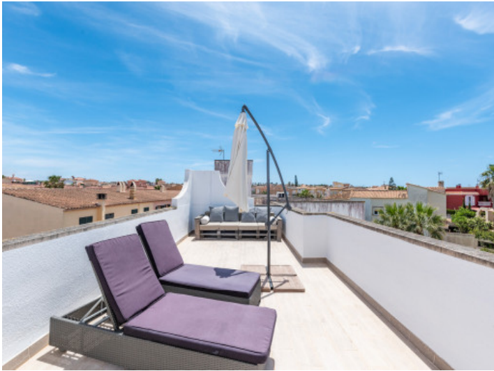
View of the terrace