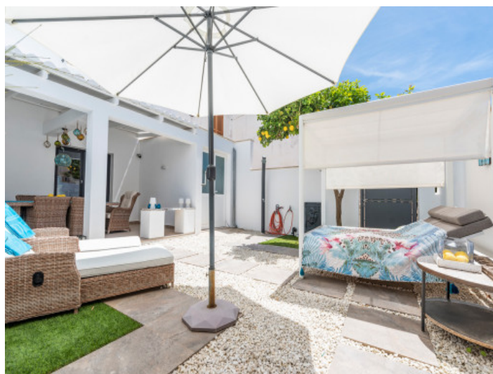
View of the terrace