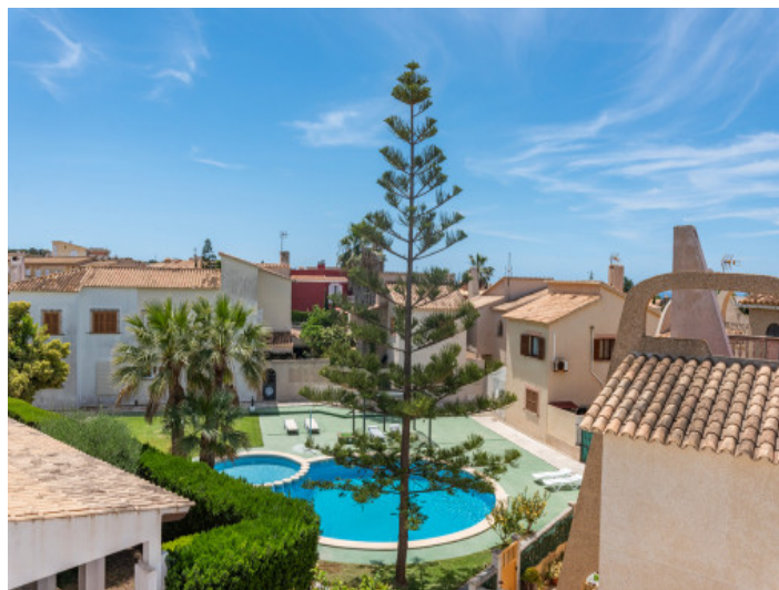
View to the community pool