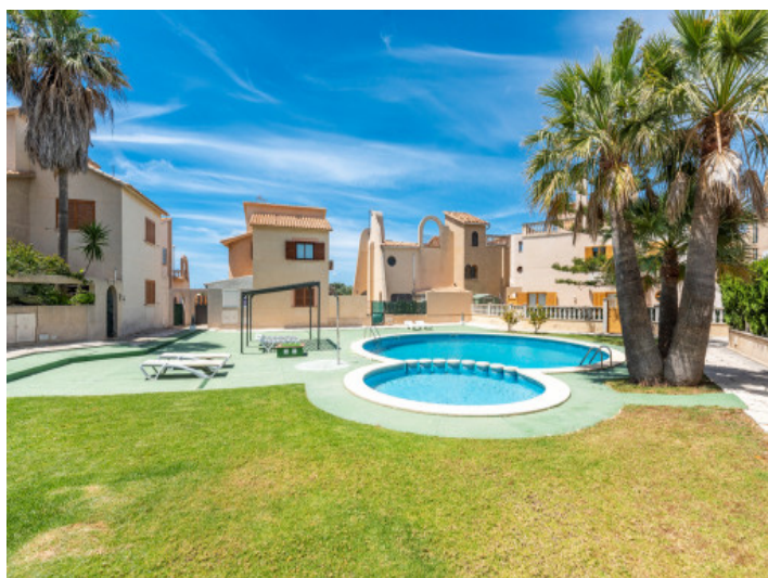
Green garden and pool area