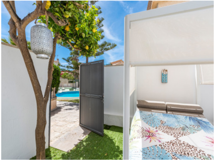
Access to the community pool