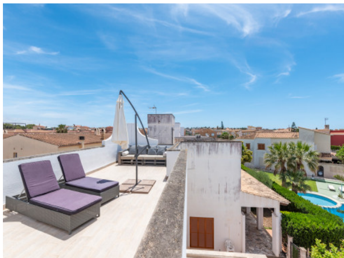
Fantastic roof top terrace